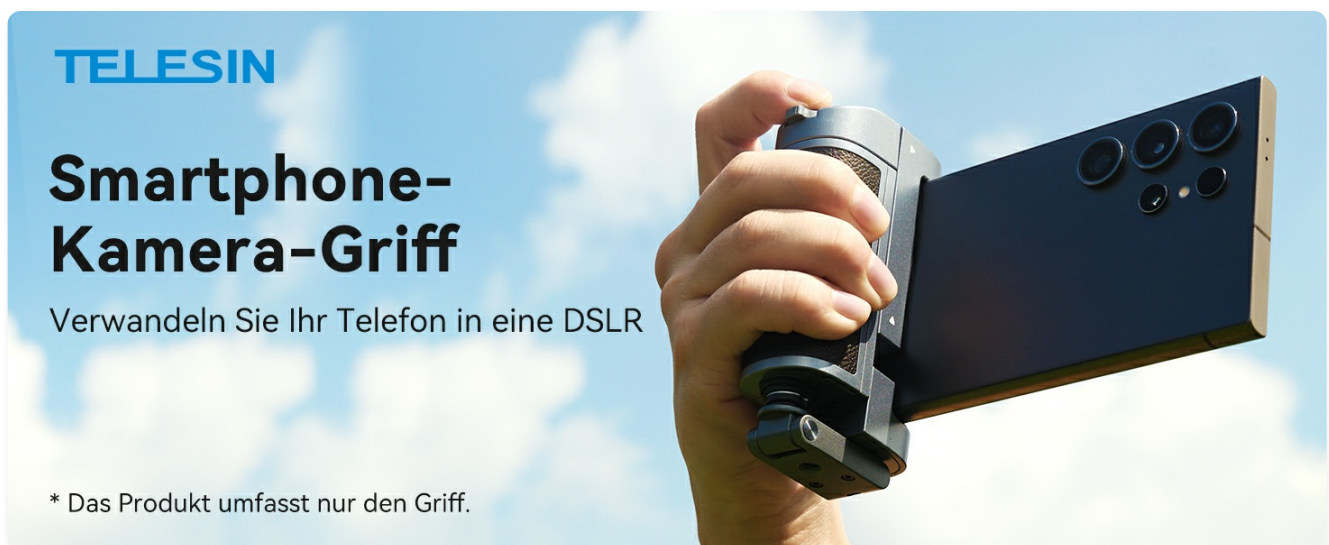
Image: The TELESIN Smartphone Camera Grip attached to a smartphone, illustrating its ergonomic design and how it enhances mobile photography.

This user manual provides comprehensive instructions for the TELESIN 3-in-1 Smartphone Grip Holder. This versatile device combines a comfortable grip, an extendable selfie stick, and a stable table stand, enhanced with a detachable Bluetooth remote control. It is designed to transform your smartphone into a more capable camera, offering DSLR-like controls for photography and videography.