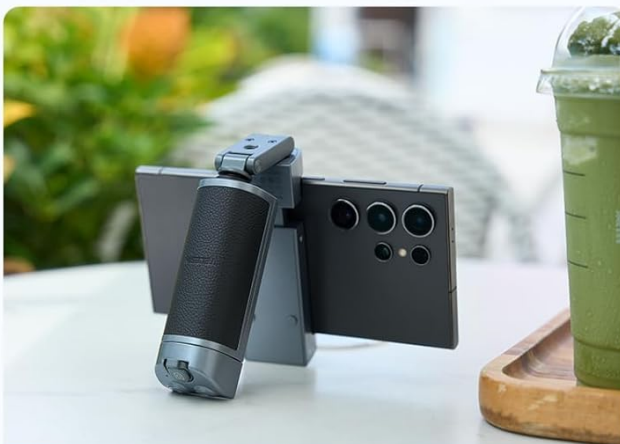
Instant Desktop Stand