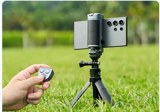
10-Meter Remote Control