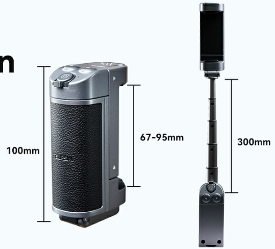
Image: A detailed diagram illustrating the product's dimensions, including its collapsed length (100mm), extended length (300mm), and clamp size (67-95mm), along with material and weight specifications.