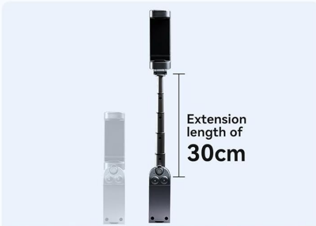
Hidden Selfie Stick