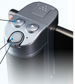
Image: Diagram highlighting the multifunctional aspects of the camera grip, including instant mode switching, classic half-shutter focus, double-tap for camera swap, and quick zoom with lever operation, all controlled via Bluetooth.