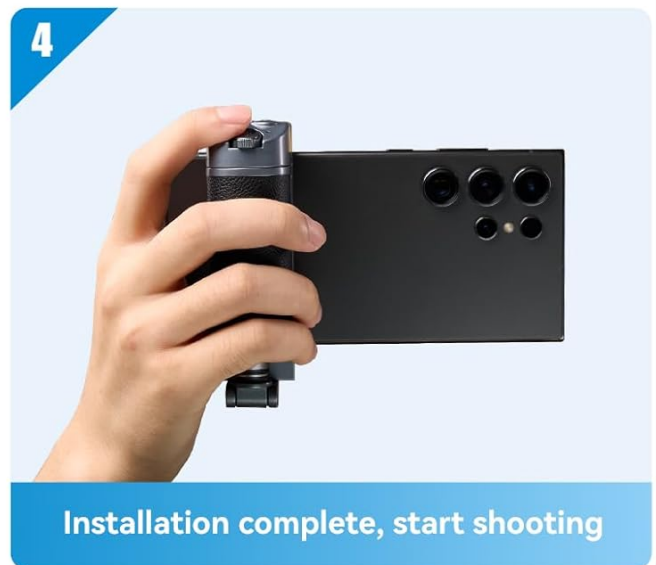
Image: A visual step-by-step guide demonstrating how to install a smartphone into the grip holder, emphasizing pulling the clamp, positioning the phone, inserting it, and securing it for a firm hold.