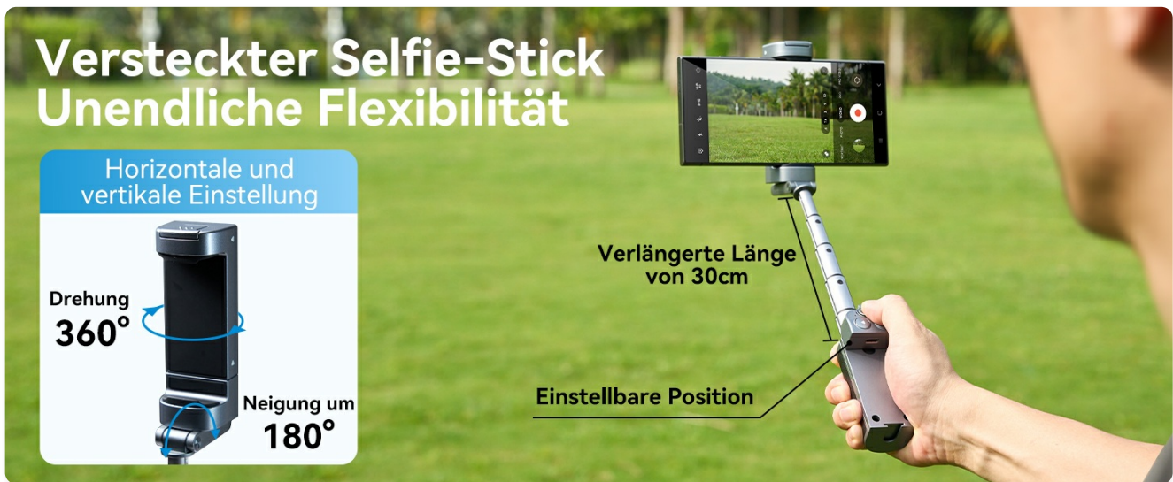
Image: Depicts the hidden selfie stick functionality, showing its extendable length of 30cm and the ability to adjust the phone horizontally and vertically with 360° rotation and 180° tilt for flexible shooting angles.