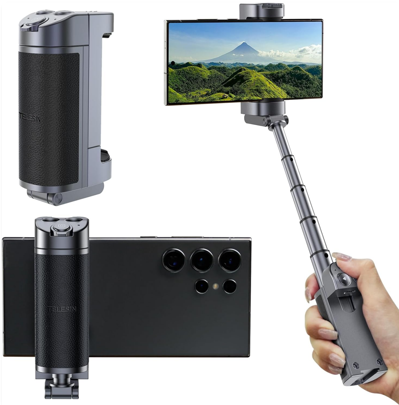
Image: A composite image showing the TELESIN grip in its three primary modes: as a compact handheld grip, extended as a selfie stick with a smartphone, and folded to serve as a stable desktop stand.