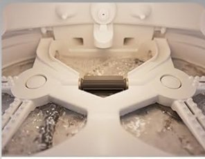
Self-Cleaning Washboard 2.0