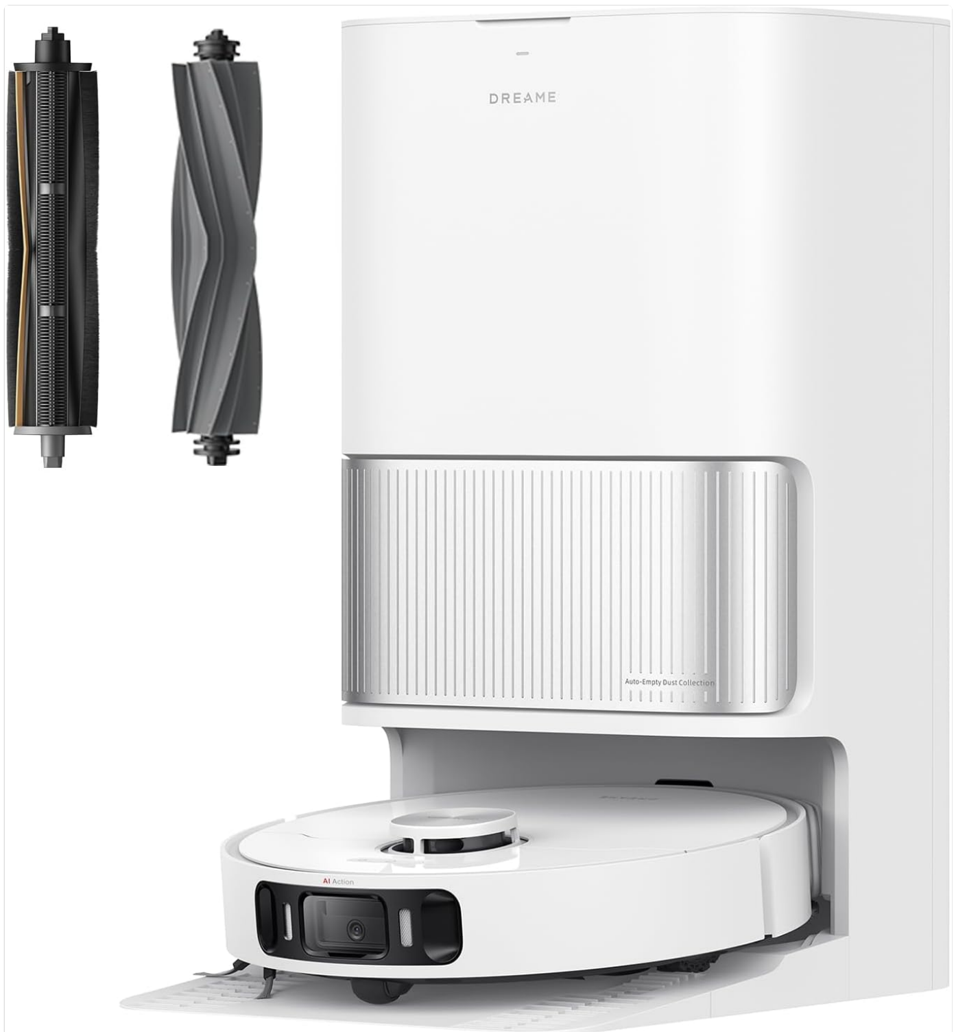
Image: The DREAME L40s Ultra AE Robot Vacuum docked in its white all-in-one base station, with two types of roller brushes displayed next to it. This illustrates the main components of the system.