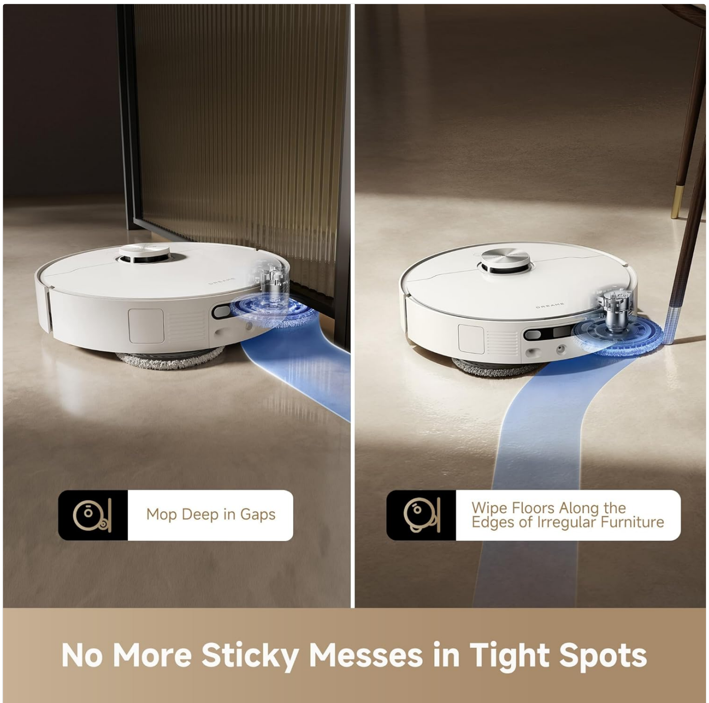
Image: Two panels illustrating the MopExtend technology. The left panel shows the mop extending to clean deep in gaps, while the right panel shows it wiping floors along the edges of irregular furniture, ensuring thorough cleaning in tight spots.