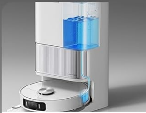
Auto Tank Water Refilling for Mopping