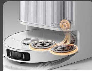
Automatic Mop Drying with Hot Air