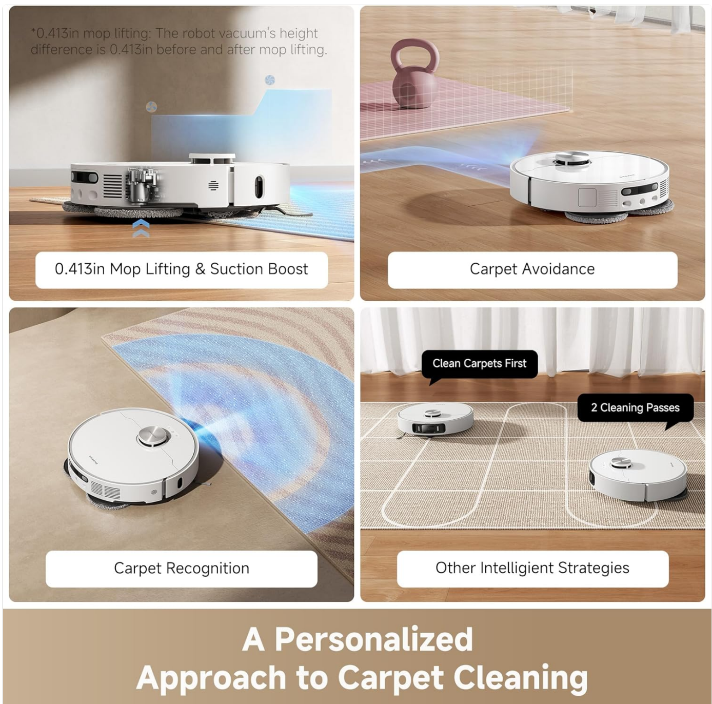
Image: Four panels demonstrating carpet cleaning capabilities: 0.413in Mop Lifting & Suction Boost, Carpet Avoidance, Carpet Recognition, and Other Intelligent Strategies like 2 Cleaning Passes. This shows the robot's tailored approach to carpet care.