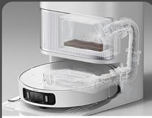
Auto-Empty up to 100 Days