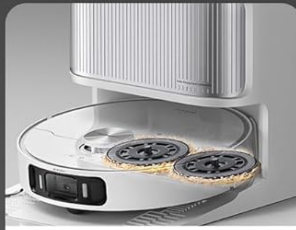
Mop Self-Cleaning with 167°F Hot Water