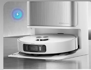
30% Faster Charging