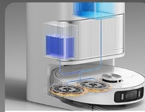
Auto Solution Refilling