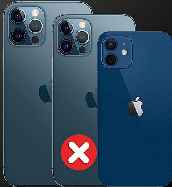
iPhone 12 Mini iPhone 12 Pro iPhone 12 Pro Max