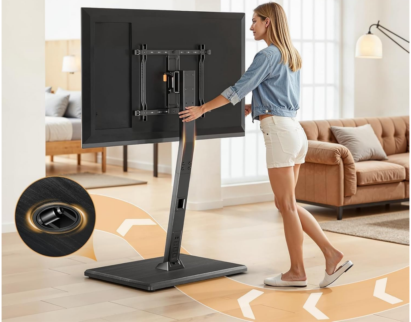
Image 5.4: Hidden casters for a streamlined appearance and mobility.