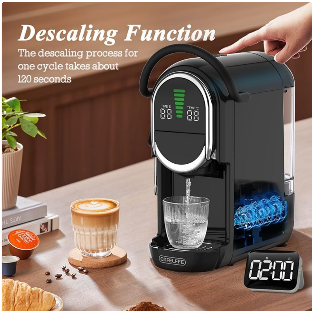
Image: Nes Original Capsule Adapter

A Nes Original capsule is shown being placed into its adapter, ready for brewing.