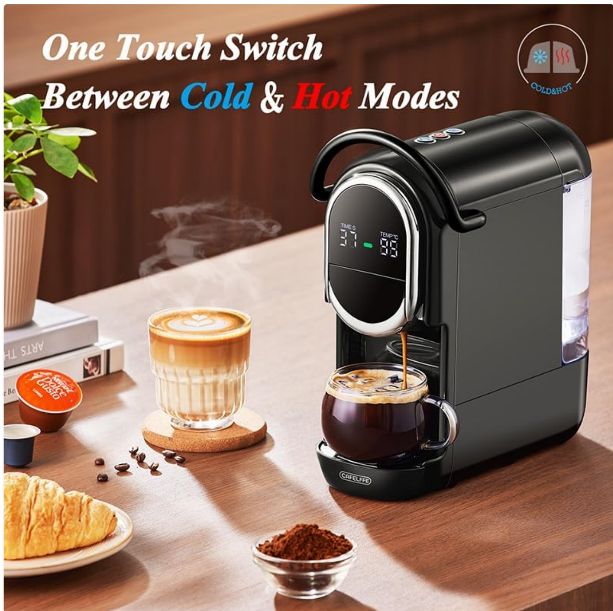
Image: Dolce Gusto Capsule Adapter

A Dolce Gusto capsule is shown being placed into its adapter, ready for brewing.