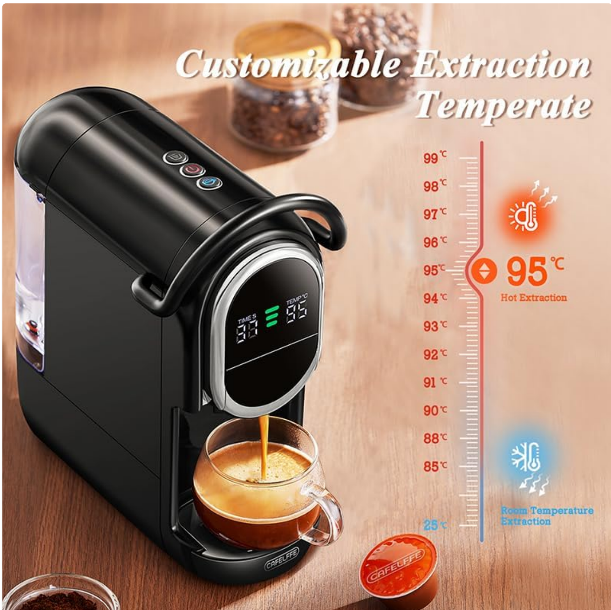
Image: Water Tank Usage

A person is shown removing, filling, and reinstalling the 600ml water tank on the Cafelffe MK-609S coffee machine.