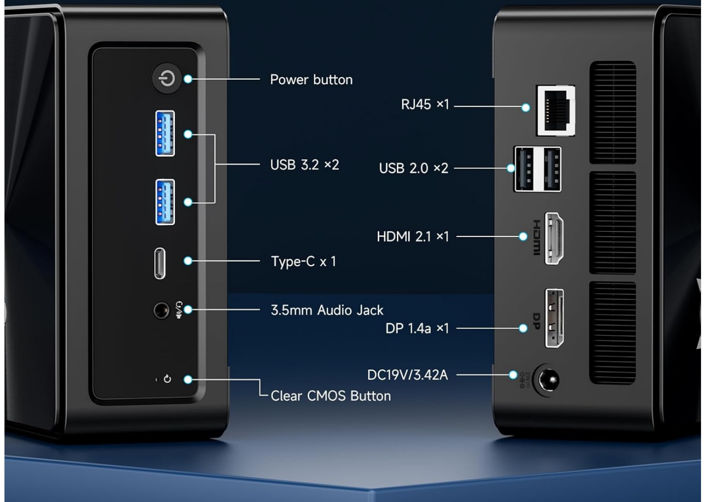
Image: Detailed view of the Bmax Mini PC's ports, including USB 3.2, USB 2.0, Type-C, HDMI 2.1, DisplayPort 1.4a, RJ45, 3.5mm Audio Jack, and DC Power In.