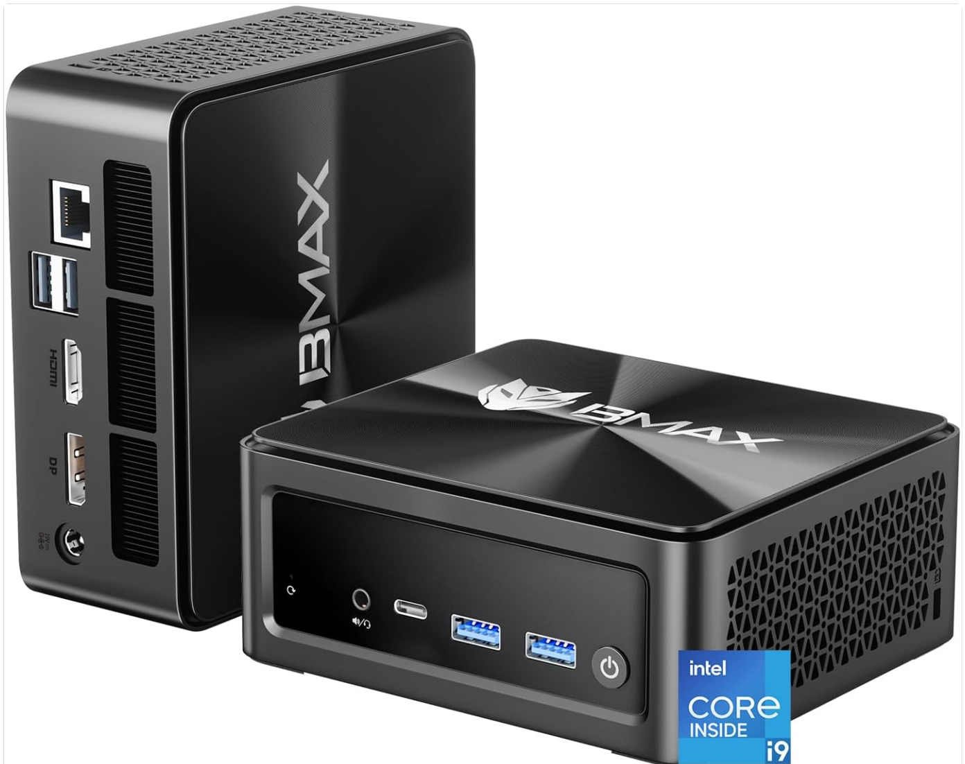
Image: Front and rear view of the Bmax Mini PC B9 Power, showcasing its compact design and various ports.

This manual provides comprehensive instructions for setting up, operating, and maintaining your Bmax Mini PC B9 Power. This high-performance mini desktop computer is equipped with an Intel Core i9-12900HK processor, 32GB DDR4 RAM, and a 1TB NVMe SSD, designed for efficient multitasking, gaming, and multimedia consumption. It supports triple 4K/60Hz display output and features advanced cooling technology.