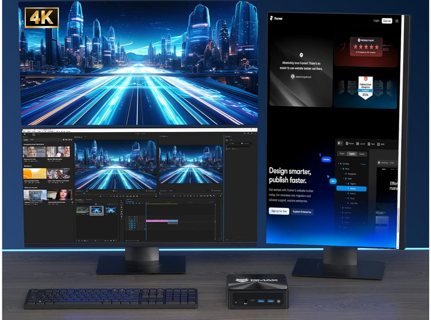
Image: Shows the Mini PC connected to three monitors, demonstrating its triple 4K@60Hz output capability for an enhanced visual experience.