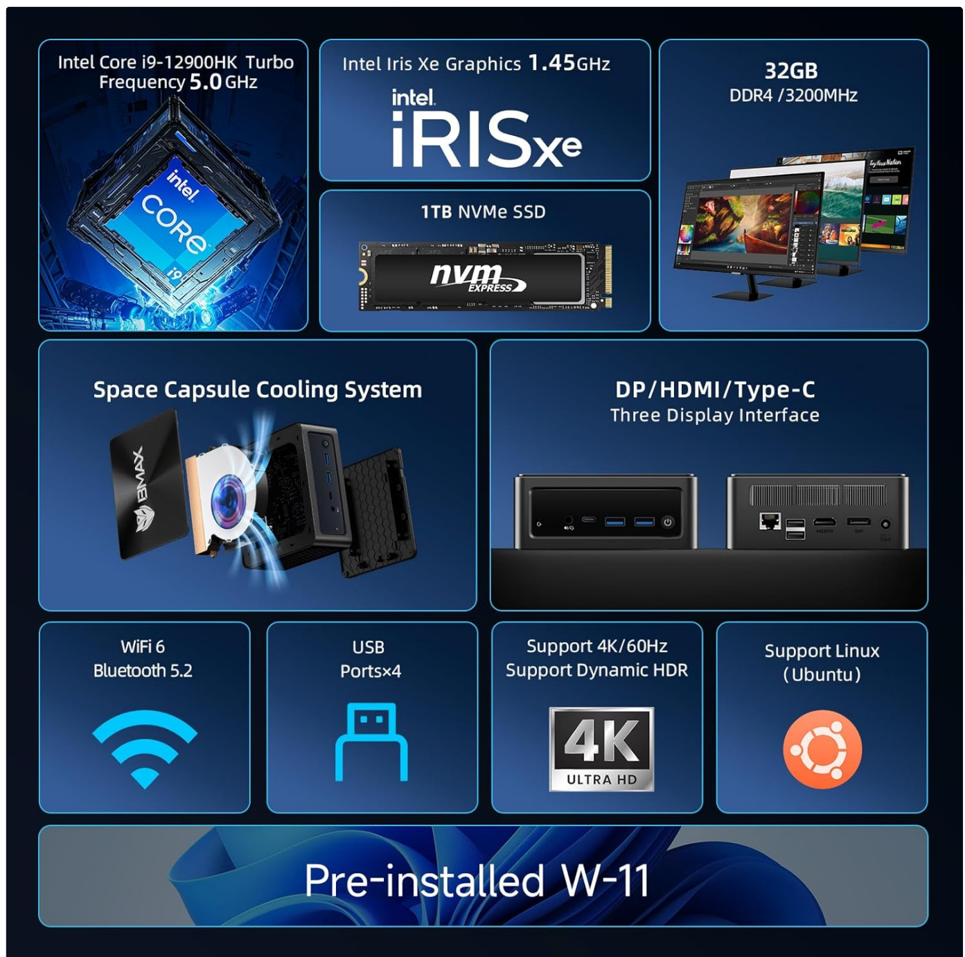
Image: An infographic highlighting key features such as Intel Core i9-12900HK, Intel Iris Xe Graphics, 32GB DDR4, 1TB NVMe SSD, Space Capsule Cooling System, triple display support, WiFi 6, Bluetooth 5.2, USB ports, 4K/60Hz support, Linux (Ubuntu) support, and pre-installed Windows 11.