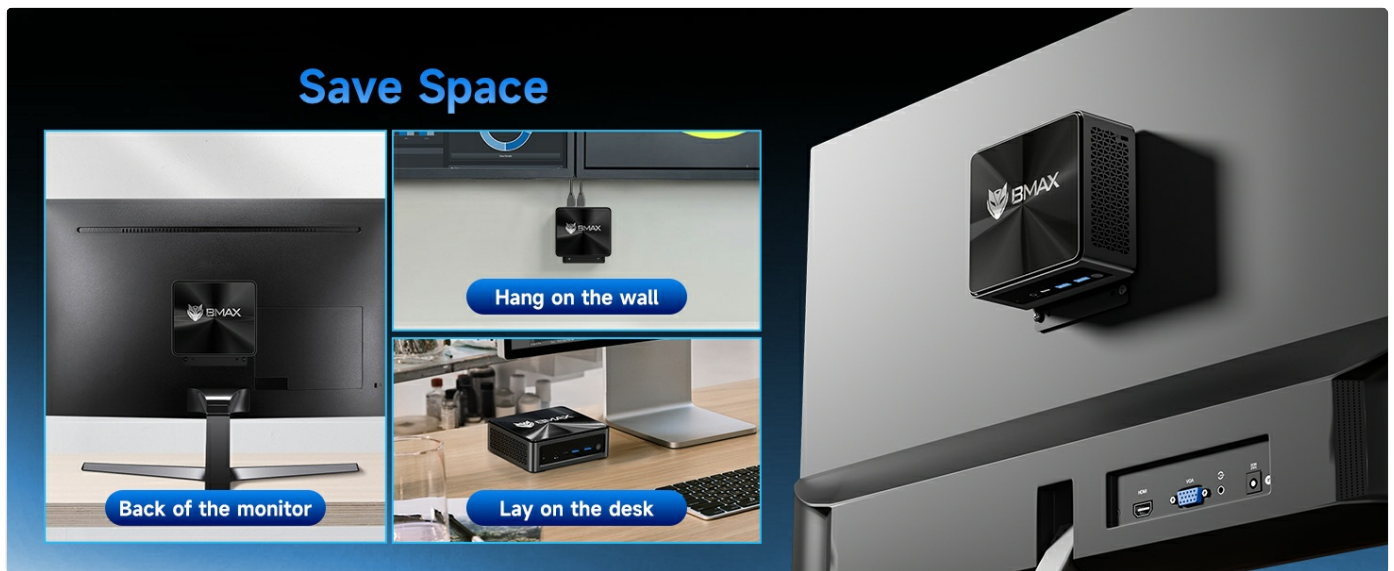
Image: Demonstrates various space-saving installation options, including mounting behind a monitor or placing on a desk.