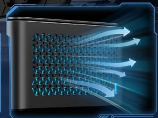
Efficient Heat Dissipation Design

Completely Improve Power Consumption and Performance