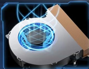
Giant Turbo Smart Fan