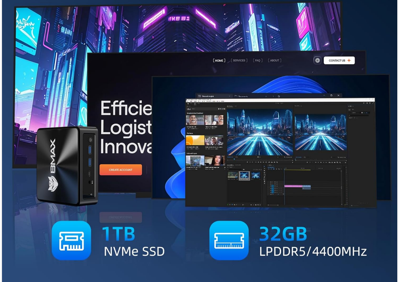
Image: Depicts the Mini PC handling various applications like Hulu, Photoshop, AI, After Effects, Word, Excel, and PowerPoint, alongside multimedia tasks such as listening to music, playing games, and watching movies, emphasizing its ability to accommodate massive files.