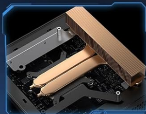
Enlarged Double Copper Heat Pipe