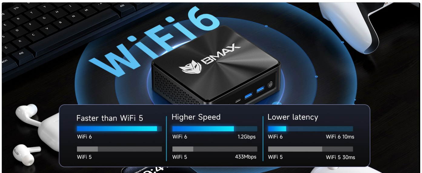
Image: A comparison chart illustrating the speed advantages of WiFi 6 over WiFi 5, showing faster speeds, higher throughput, and lower latency.

Your browser does not support the video tag.