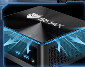
Top Cover Cooling Design