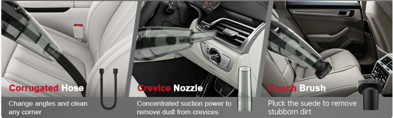
Image: The handheld vacuum being used to clean the interior of a car, demonstrating its portability and suitability for automotive cleaning.