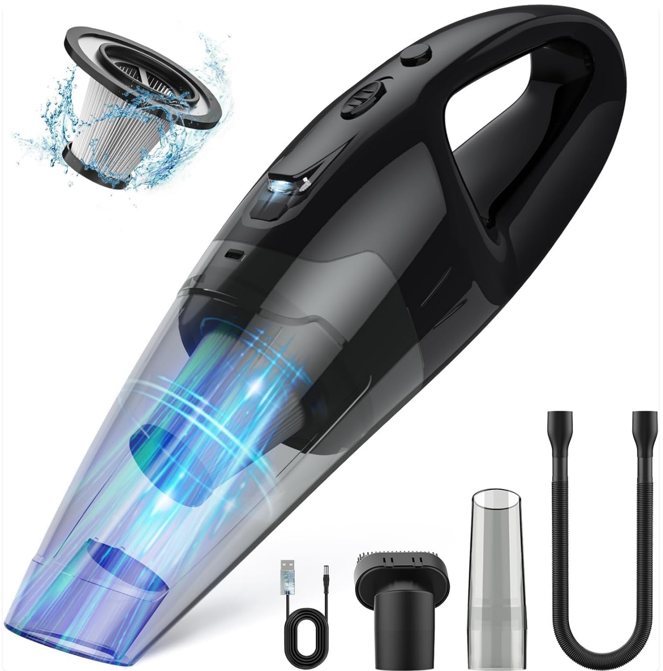
Image: The BSRCO Handheld Vacuum, showcasing its sleek design and included accessories like the filter, USB cable, and various nozzles.