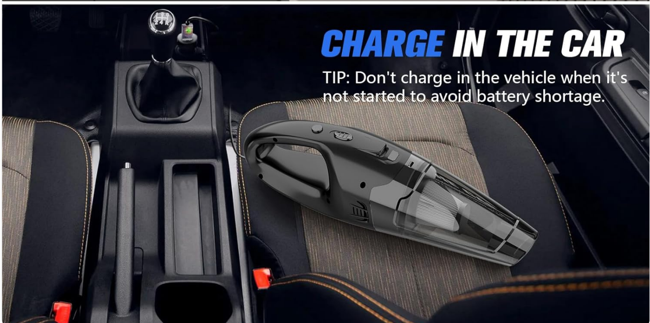
Image: The handheld vacuum connected to a USB power source, illustrating the charging process and the indicator light.