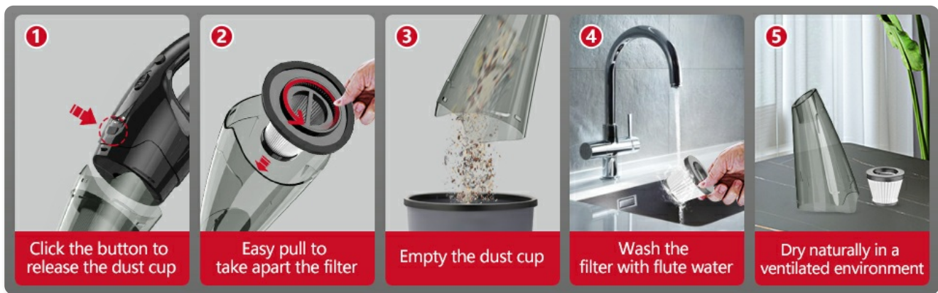
Image: A step-by-step visual guide demonstrating how to release the dust cup, remove the filter, empty debris, wash the filter, and allow it to dry.