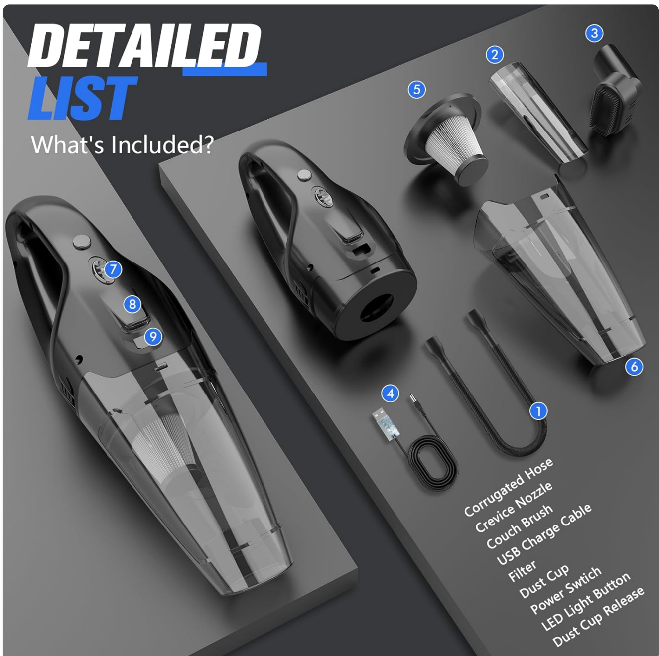
Image: An exploded view of the vacuum showing its internal components and all included accessories, clearly labeled for identification.