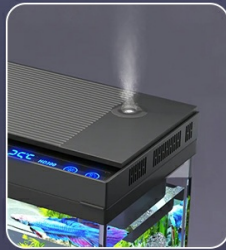
2-s interval spray

Customize the spacing and intensity of your chosen scent to fill your space with calming aromas.