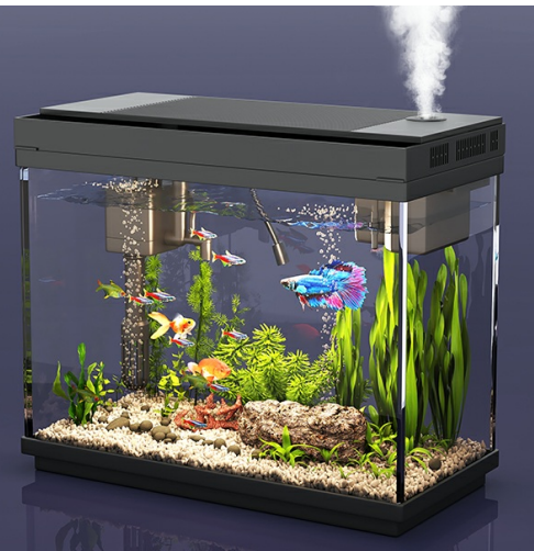
Figure 5: Self-cleaning water recycling system.