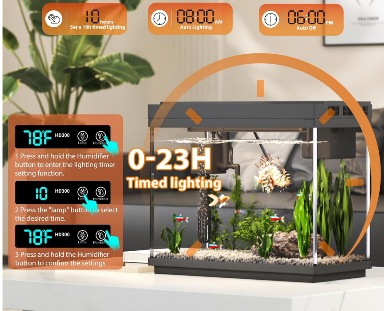
Figure 4: Light setting timer cycle.