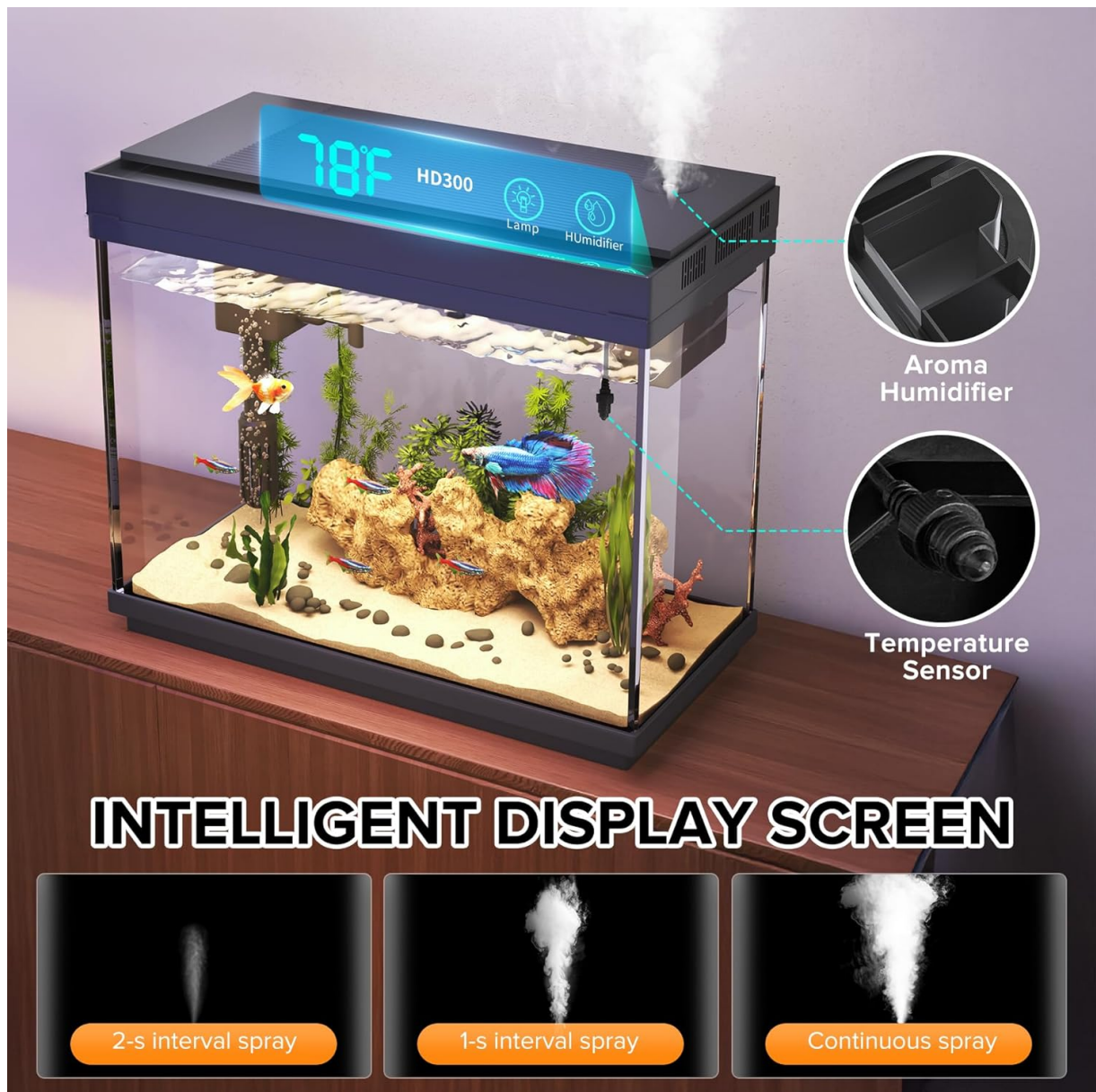
Figure 1: Included components of the Vehipa Fish Tank Starter Kit.