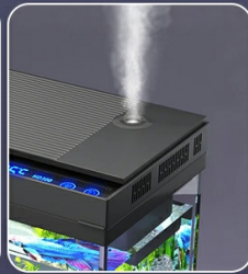
1-s interval spray