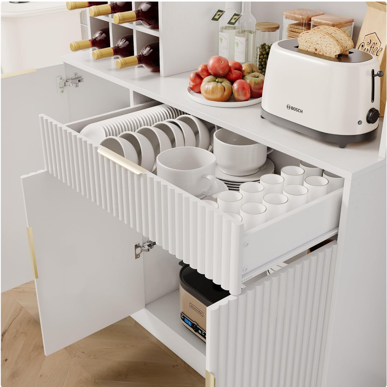
Image 4.2: The smooth-gliding drawer, ideal for storing smaller kitchen items like cutlery or dishware.