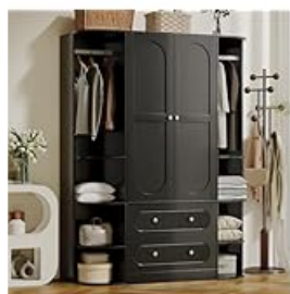
Image 4.3: Visual guide demonstrating the adjustable shelf feature, allowing customization of storage space.