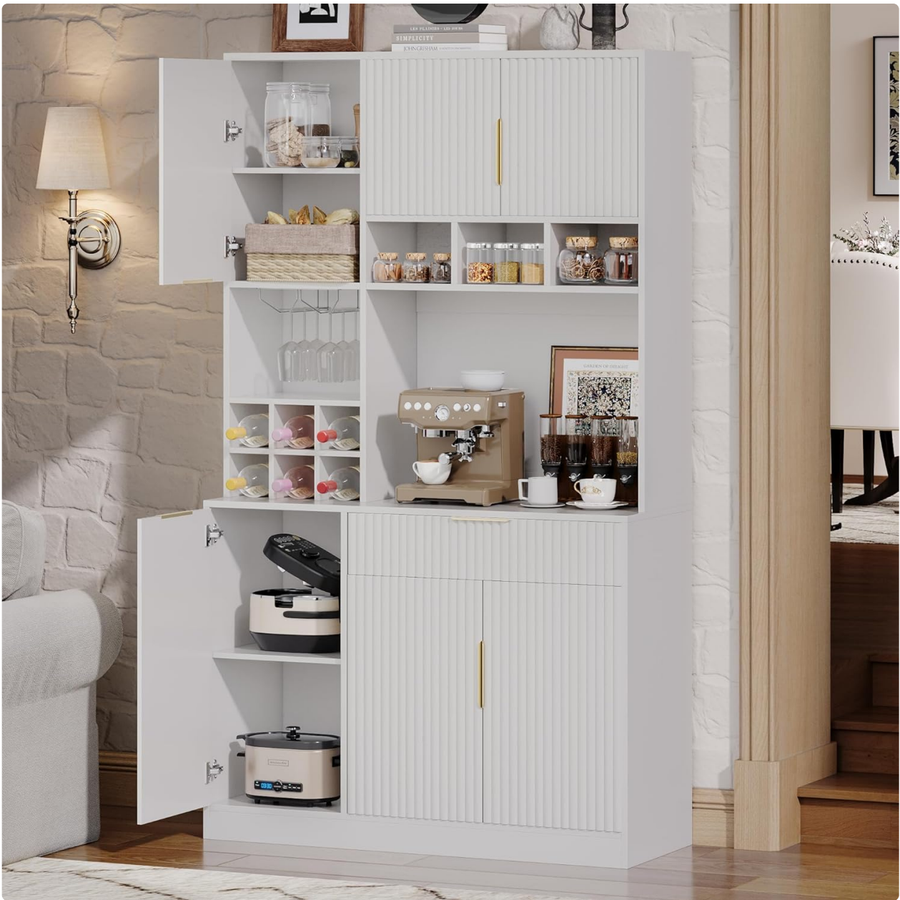
Image 2.1: The TOKSOM Kitchen Pantry Cabinet with its various storage options, including upper and lower cabinets, wine racks, and a central open area suitable for a microwave or coffee station.