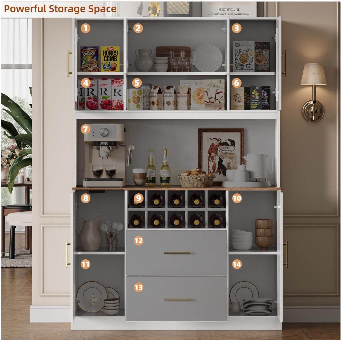
Figure 4: Detailed Storage Layout. This image highlights the various storage sections, including upper cabinets, open microwave shelf, wine racks, drawers, and lower cabinets, demonstrating the cabinet's organizational capacity.