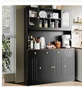
Figure 5: Adjustable Shelves. This detail shows how shelves can be repositioned to accommodate items of various heights, enhancing storage flexibility.