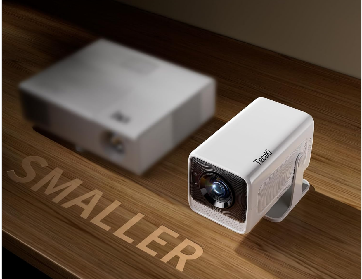
Image: A compact white projector unit, highlighting its small size and native 1080P resolution capabilities for clear visuals.

Crystal-Clear Visuals in a Space-Saving Design