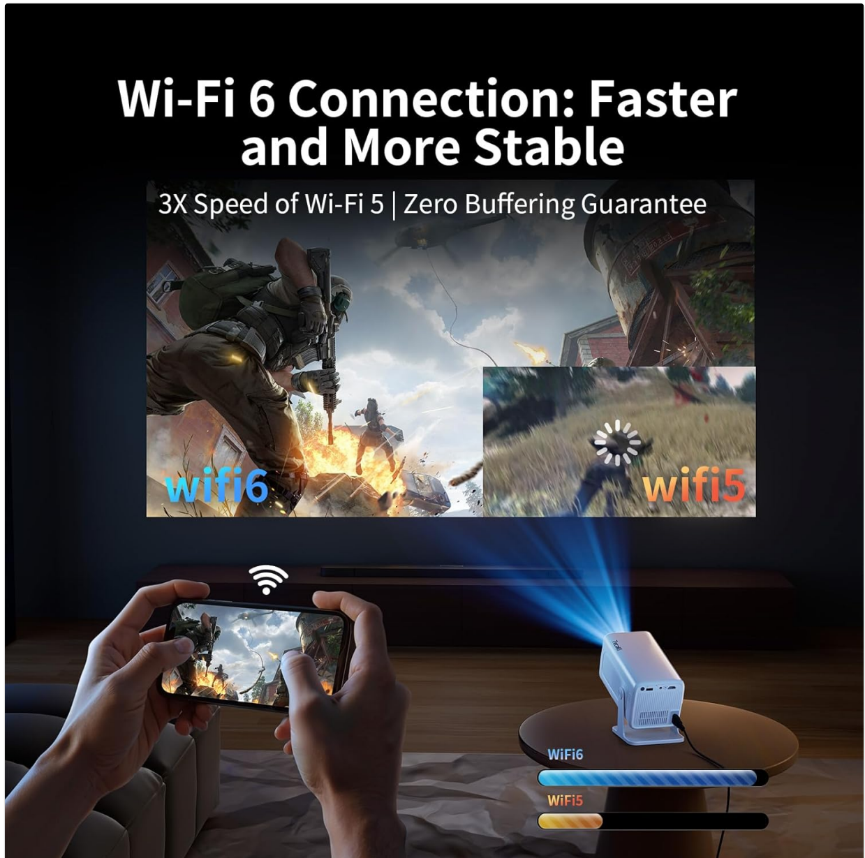
Image: A visual comparing WiFi 6 and WiFi 5 connection speeds, illustrating faster and more stable streaming with WiFi 6 for gaming and video content.