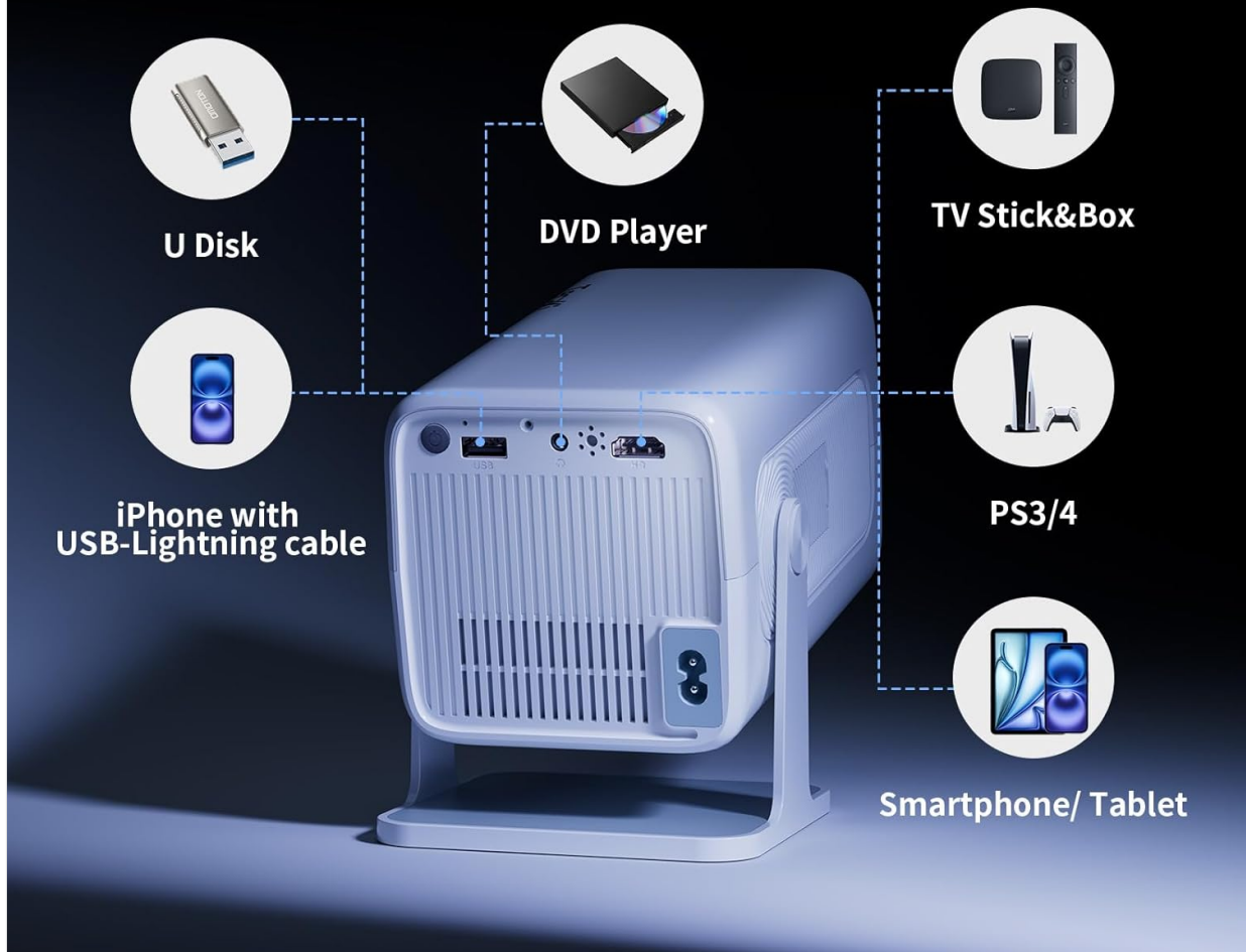
Image: A detailed view of the projector's rear panel, showing available ports including USB, HDMI, headphone jack, and AC power input, along with compatible devices like U Disk, DVD Player, TV Stick, PS3/4, and smartphones/tablets.

Connect iPhone to the projector with a USB to Lightning cable