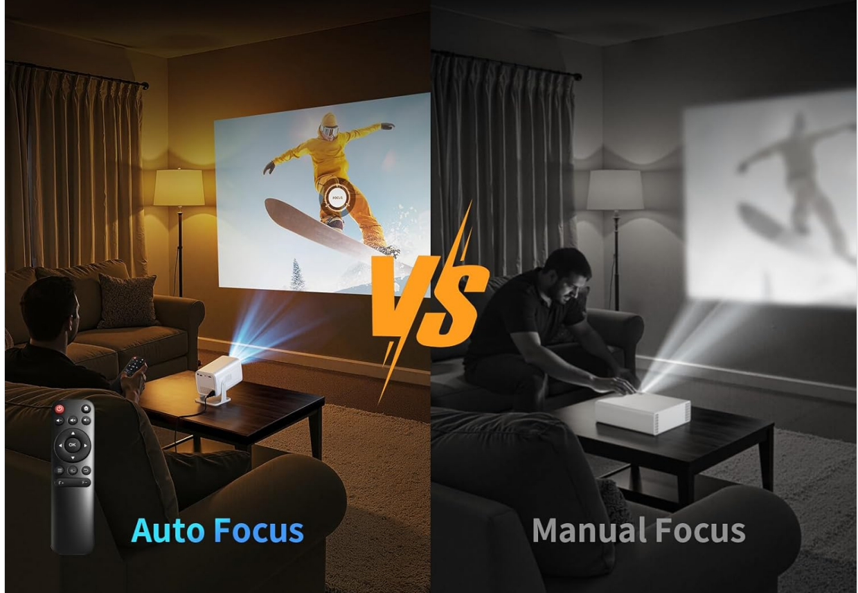
Image: A comparison showing the difference between electric auto-focus (clear image) and manual focus (blurry image) for the projector.