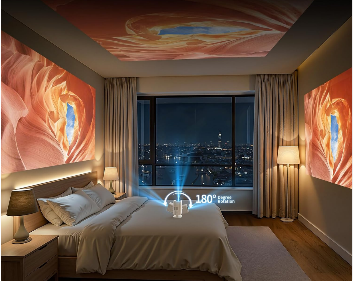
Image: A bedroom scene showing the projector casting an image onto the ceiling, demonstrating its 180-degree rotation capability for flexible projection angles.

From Ceiling to Wall – Imaging at Any Angle