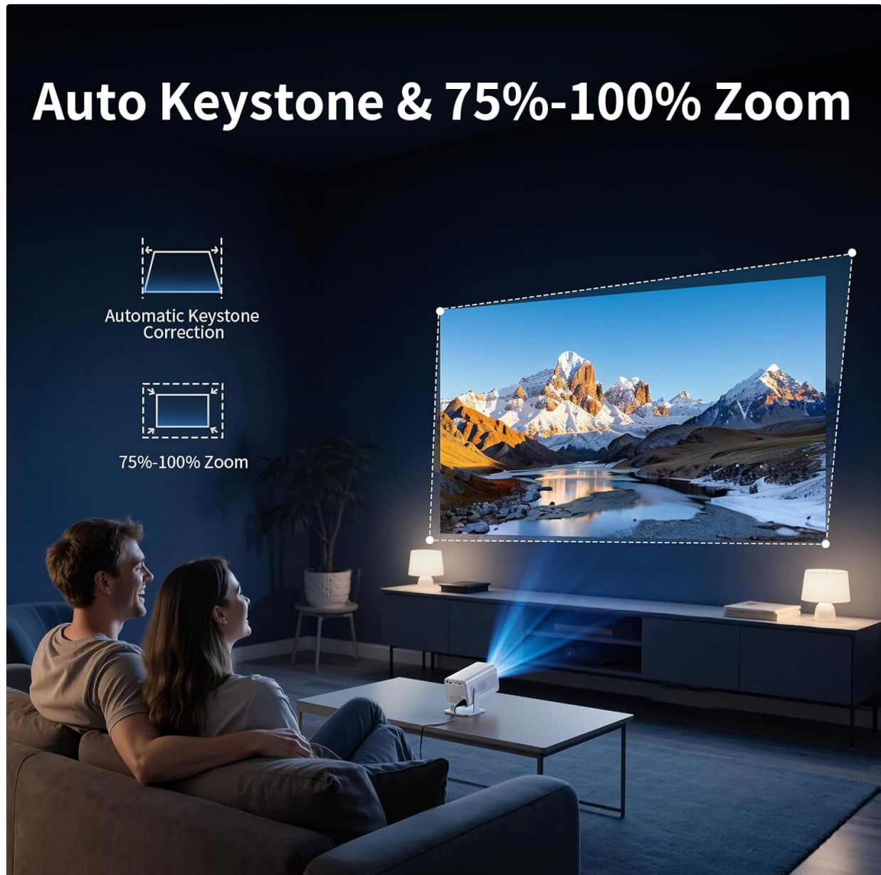
Image: A living room scene illustrating the projector's automatic keystone correction and zoom capabilities, ensuring a perfectly aligned and sized image.