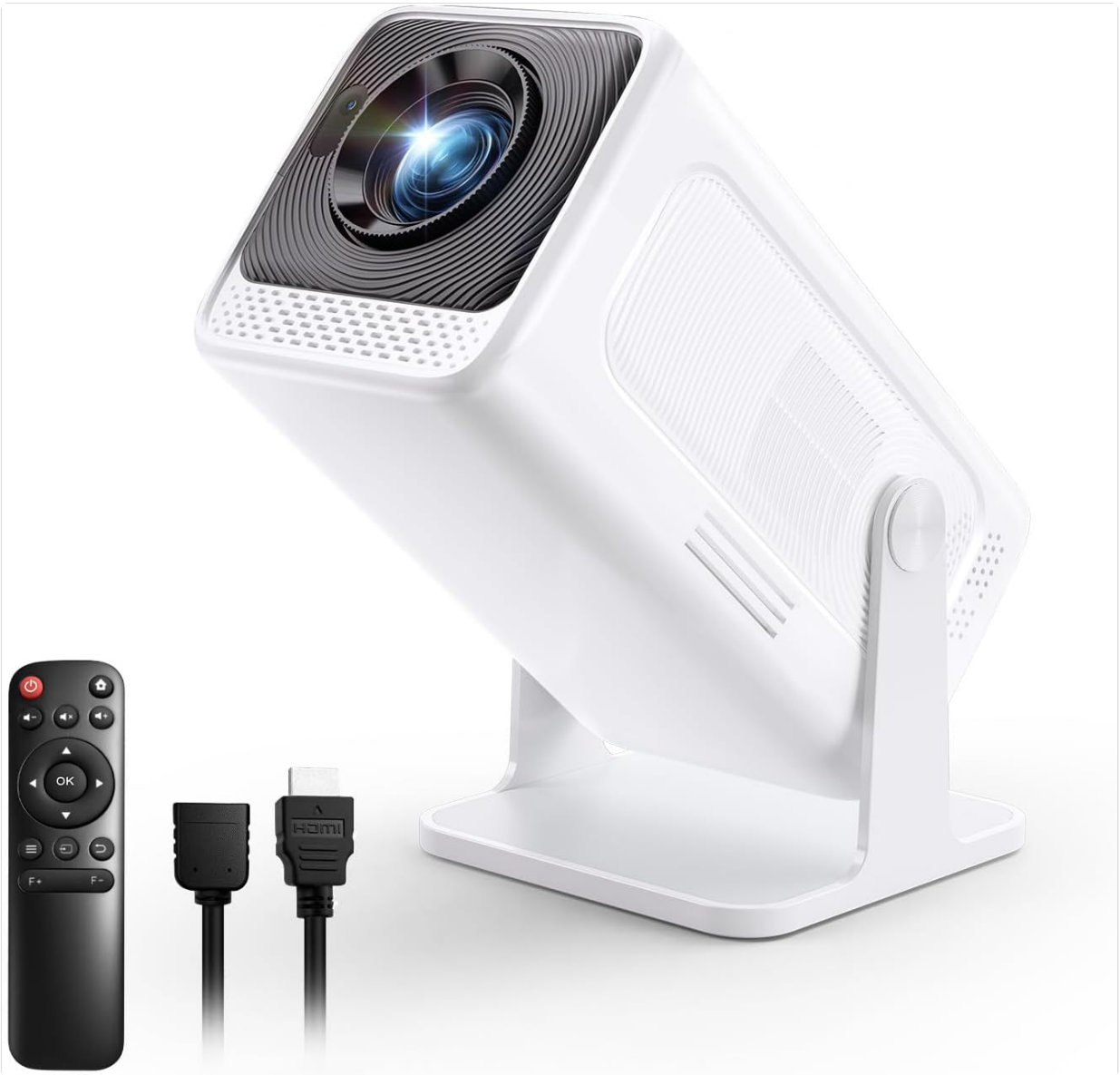
Image: Contents of the Tecaki X3 Mini Projector package, including the projector unit, remote control, power adapter, HDMI cable, and cleaning kit.