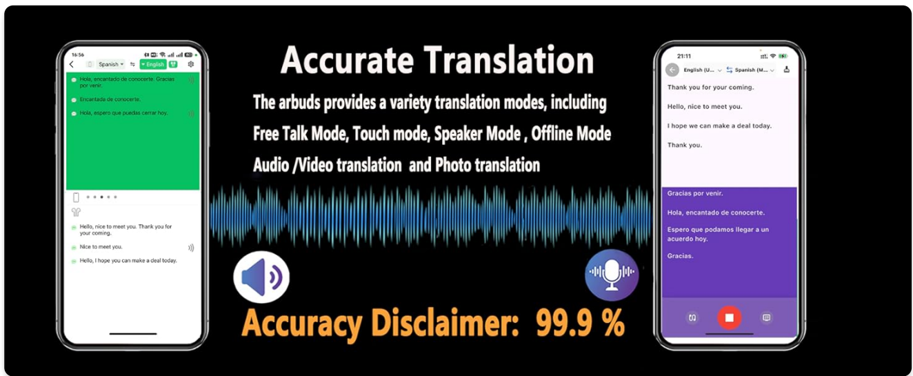
Figure 9: The app interface displaying various translation modes and high accuracy.