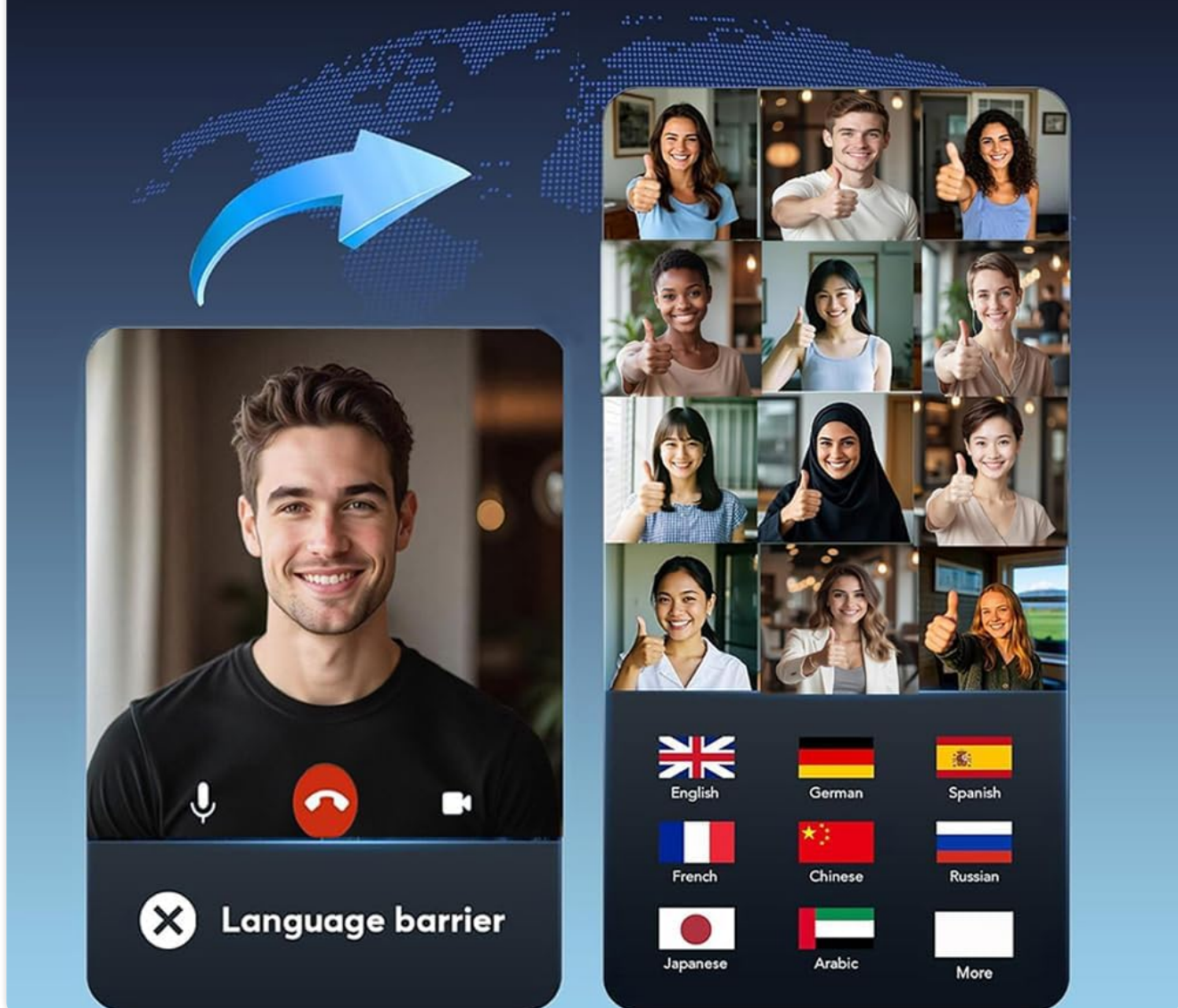
Figure 8: Seamless communication enabled by real-time translation.