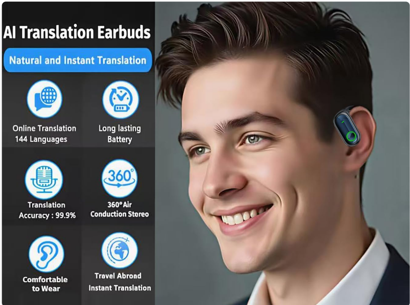
Figure 2: Earbud in use, showcasing key features like 144 languages and long battery life.