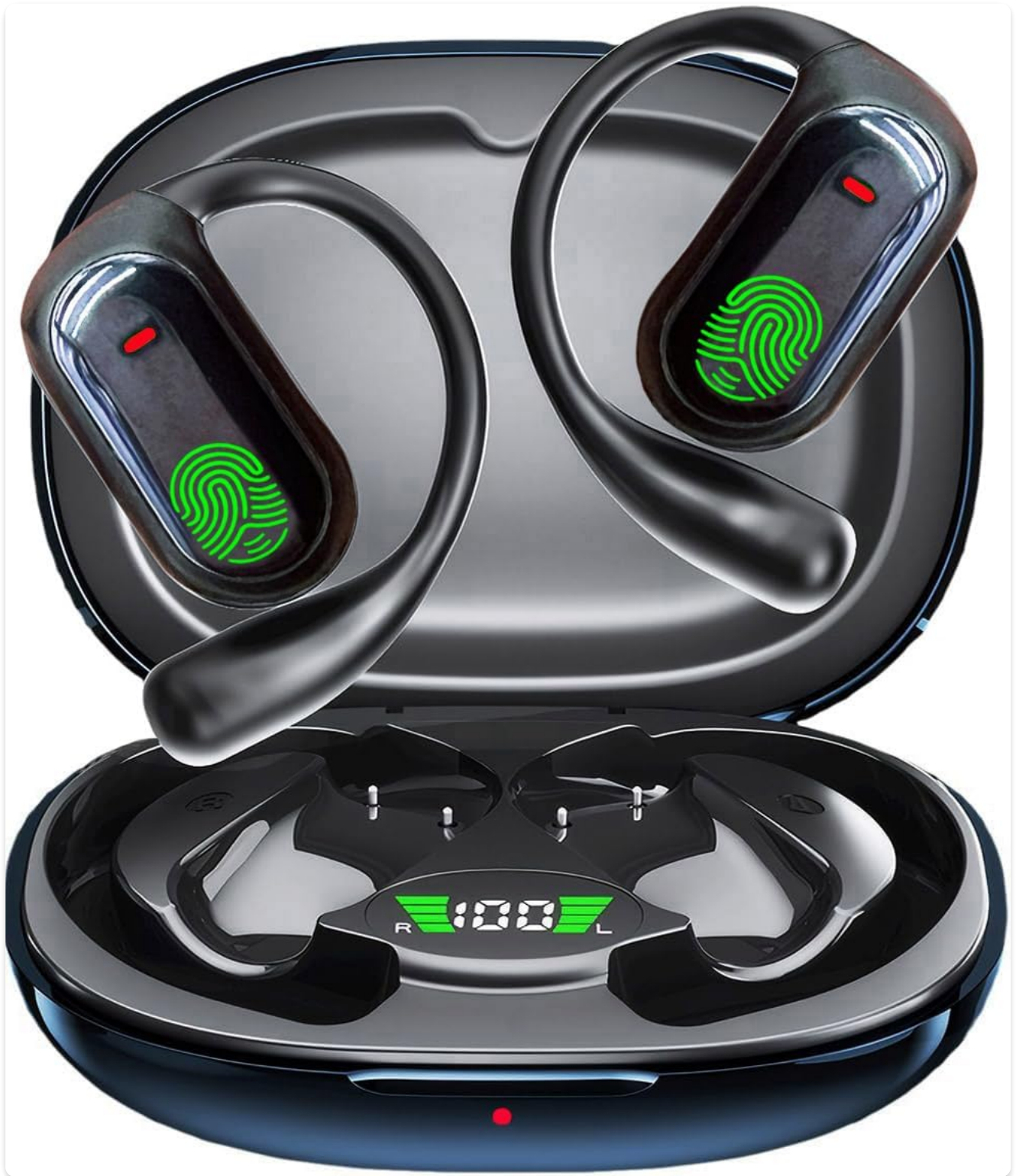
Figure 1: ZEAHOT AI Translation Earbuds in their charging case.