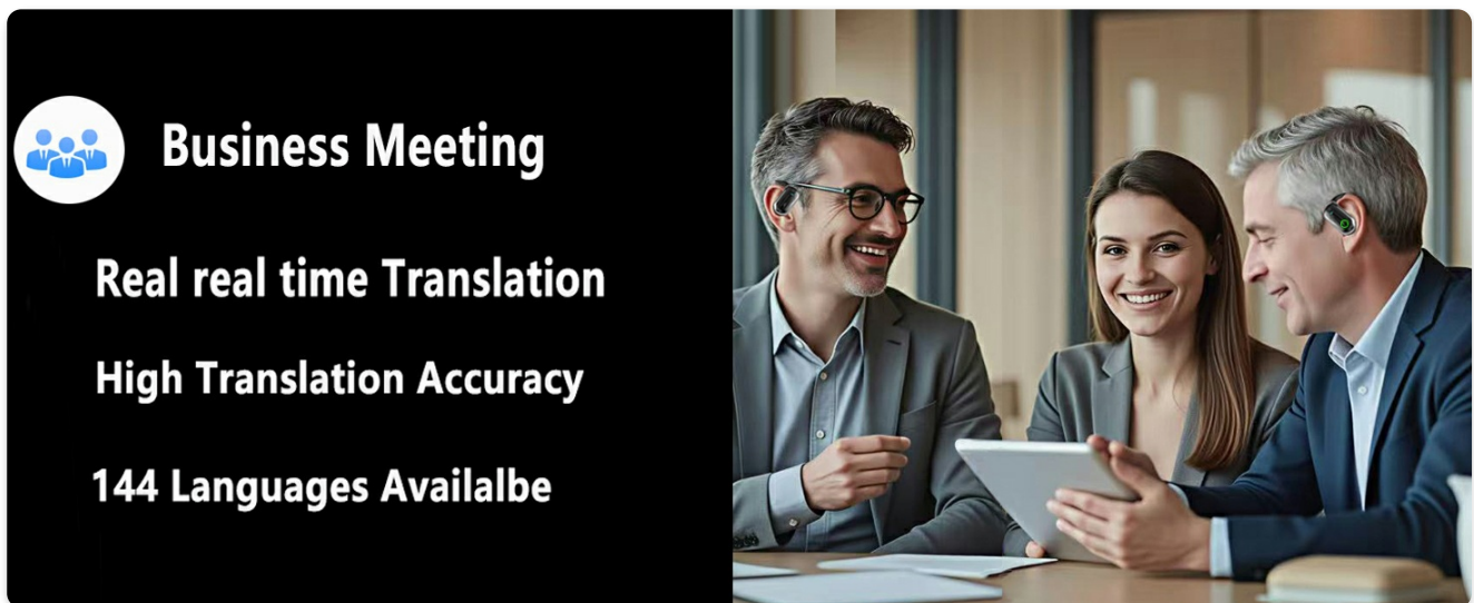
Figure 10: Earbuds enhancing communication in a business meeting.