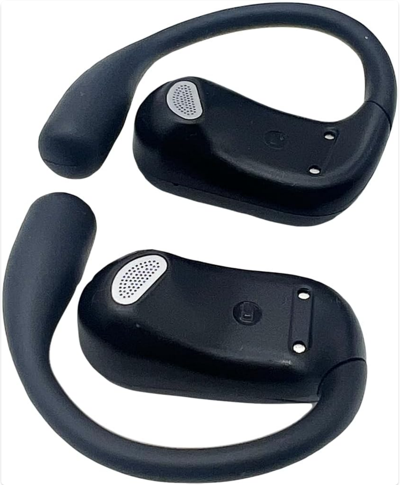
Figure 6: The ergonomic ear hook design for secure wearing.