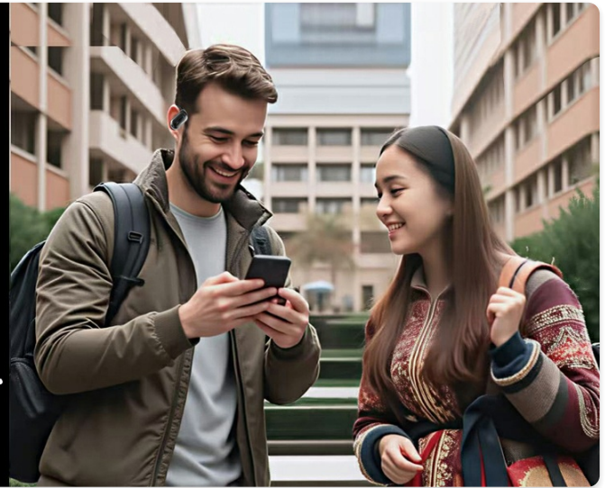
Figure 11: Earbuds providing assistance for travelers.

Our ZeaHot earbuds perfect for international traveling it makes communication easily No worry about languages barrier.