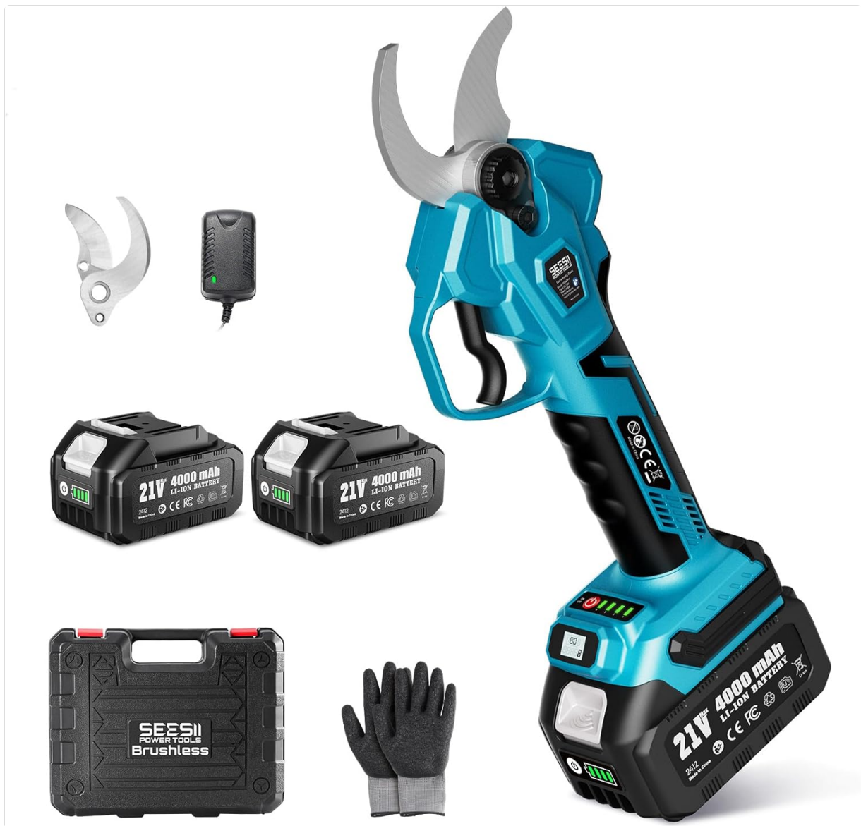
Image: The SEESII Electric Pruning Shears with its complete set of accessories, including two batteries, charger, extra blade, tools, glove, and storage case.