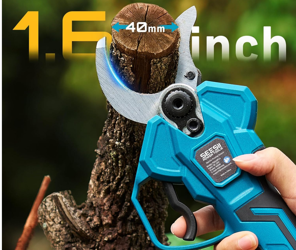
Image: The electric pruning shears demonstrating its 1.6-inch cutting diameter capability on a thick branch.