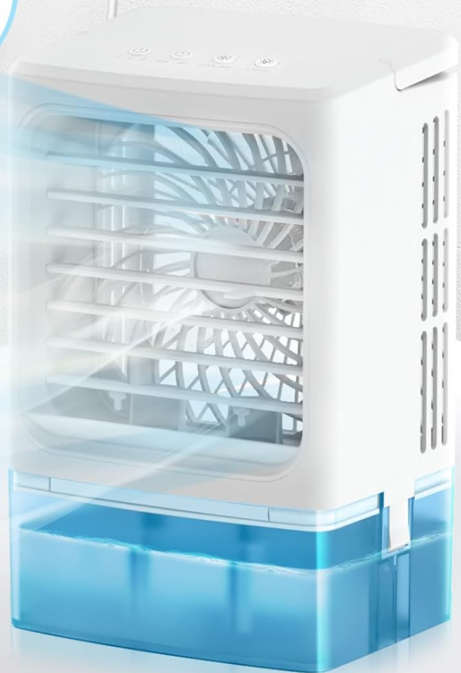
Figure 4: The air cooler can be powered by various USB sources, including chargers, power banks, laptops, computers, and car chargers.