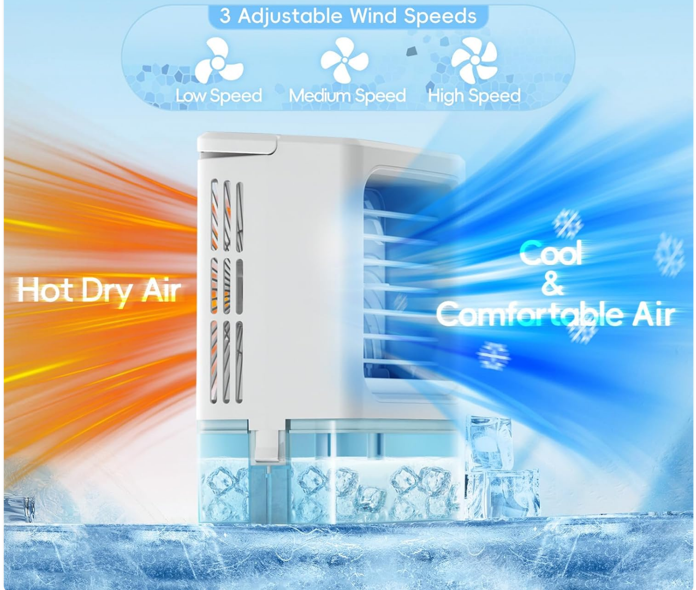
Figure 5: The air cooler effectively transforms hot, dry air into cool, comfortable air with three adjustable wind speeds.