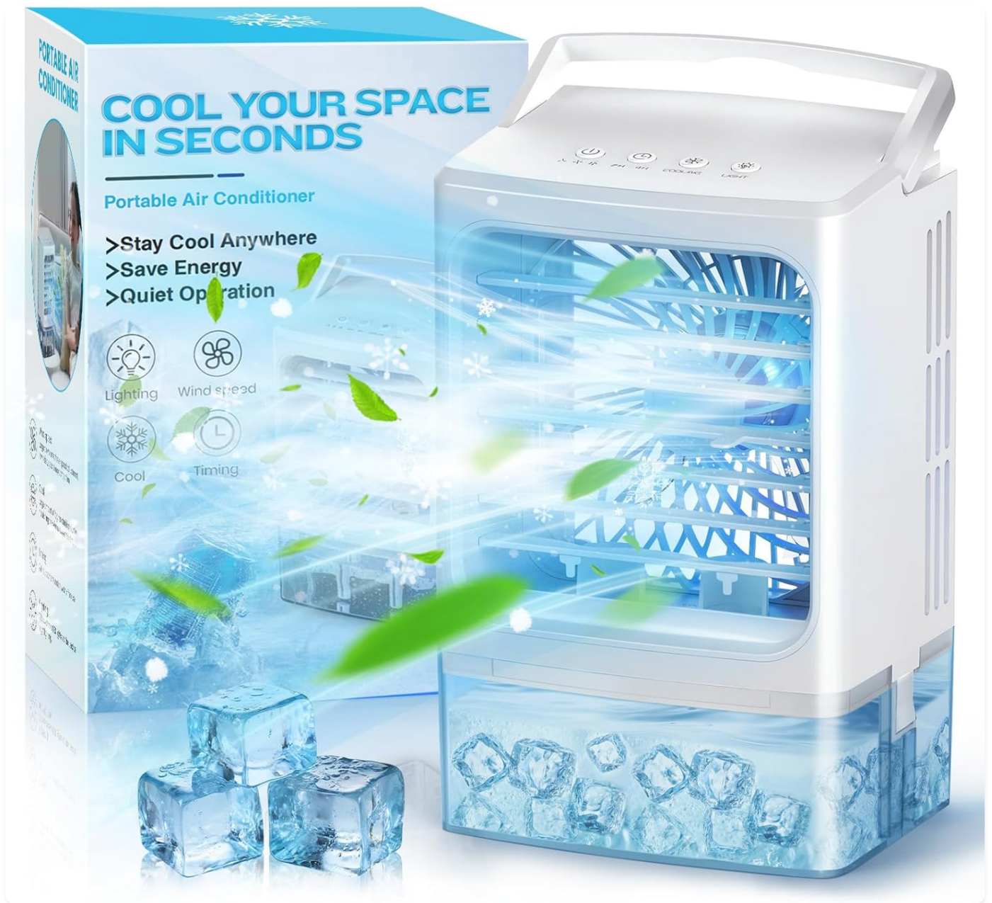
Figure 1: AOGITKE Portable Evaporative Air Cooler, showcasing its cooling capabilities with ice cubes and mist.

This device features a high-efficiency cooling system with dual mist, adjustable fan speeds, a large water tank, and a convenient timer function. It also includes a 7-color LED night light for enhanced ambiance.