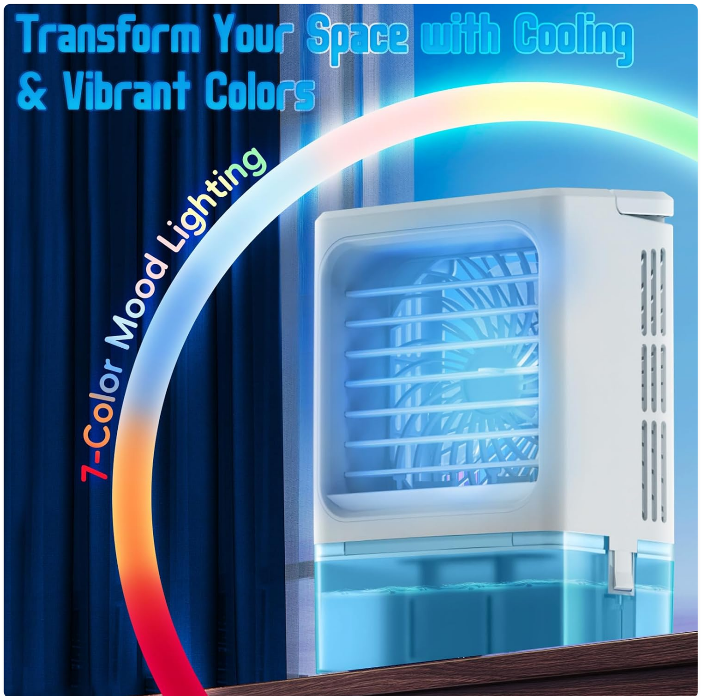
Figure 6: The air cooler features 7-color mood lighting to transform your space with vibrant colors.