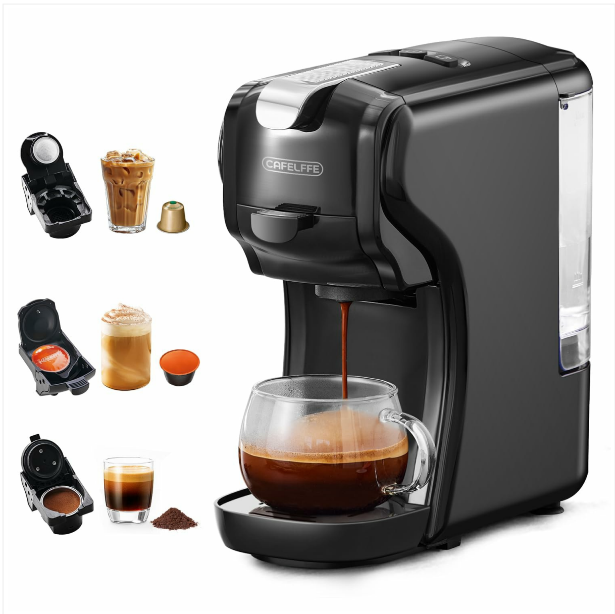
Image: The CAFELFFE MK-611 coffee machine in operation, brewing coffee into a glass cup.