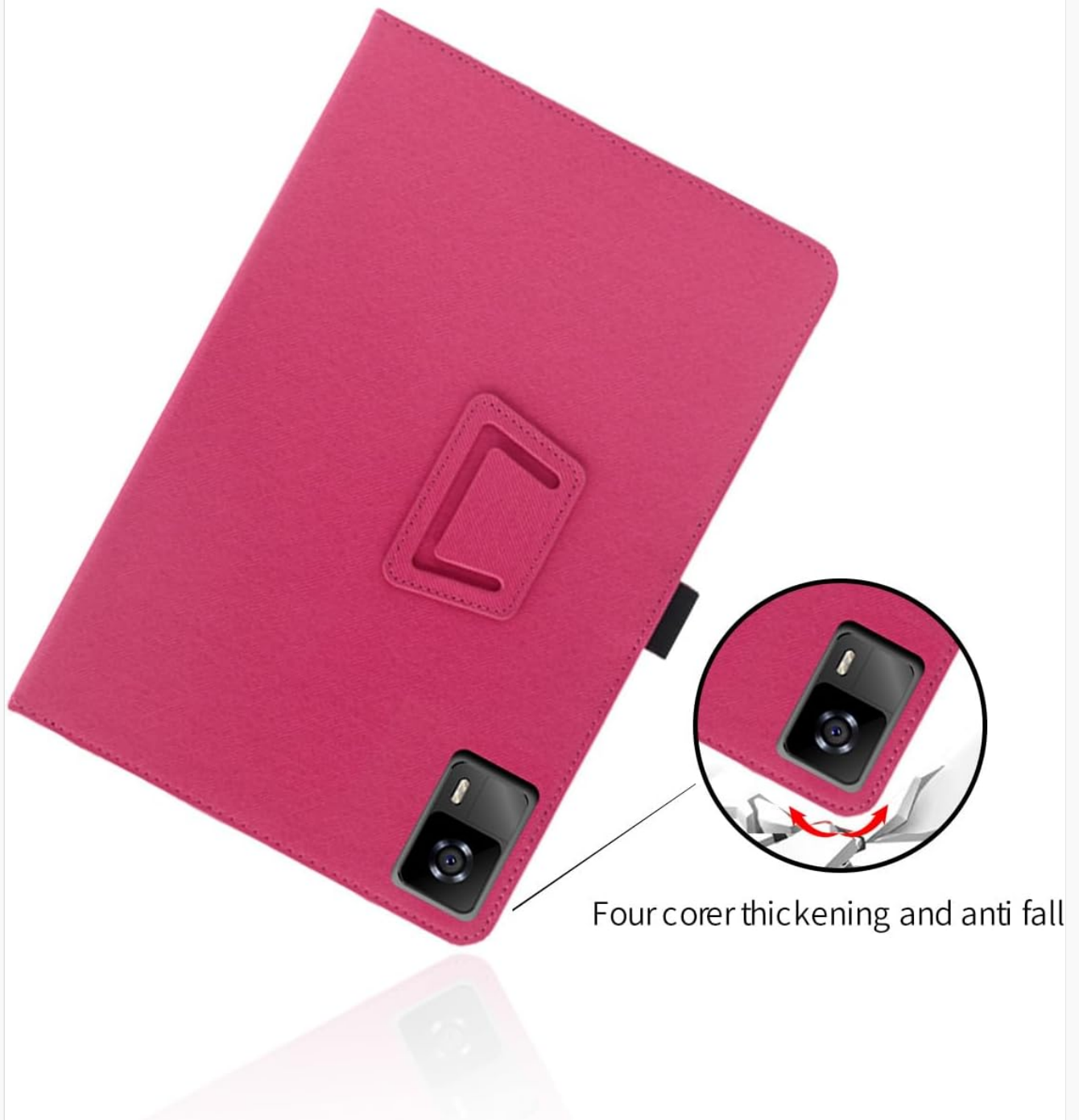
Image 4.2: Detail of the integrated hand strap, designed for comfortable and secure one-handed tablet use.