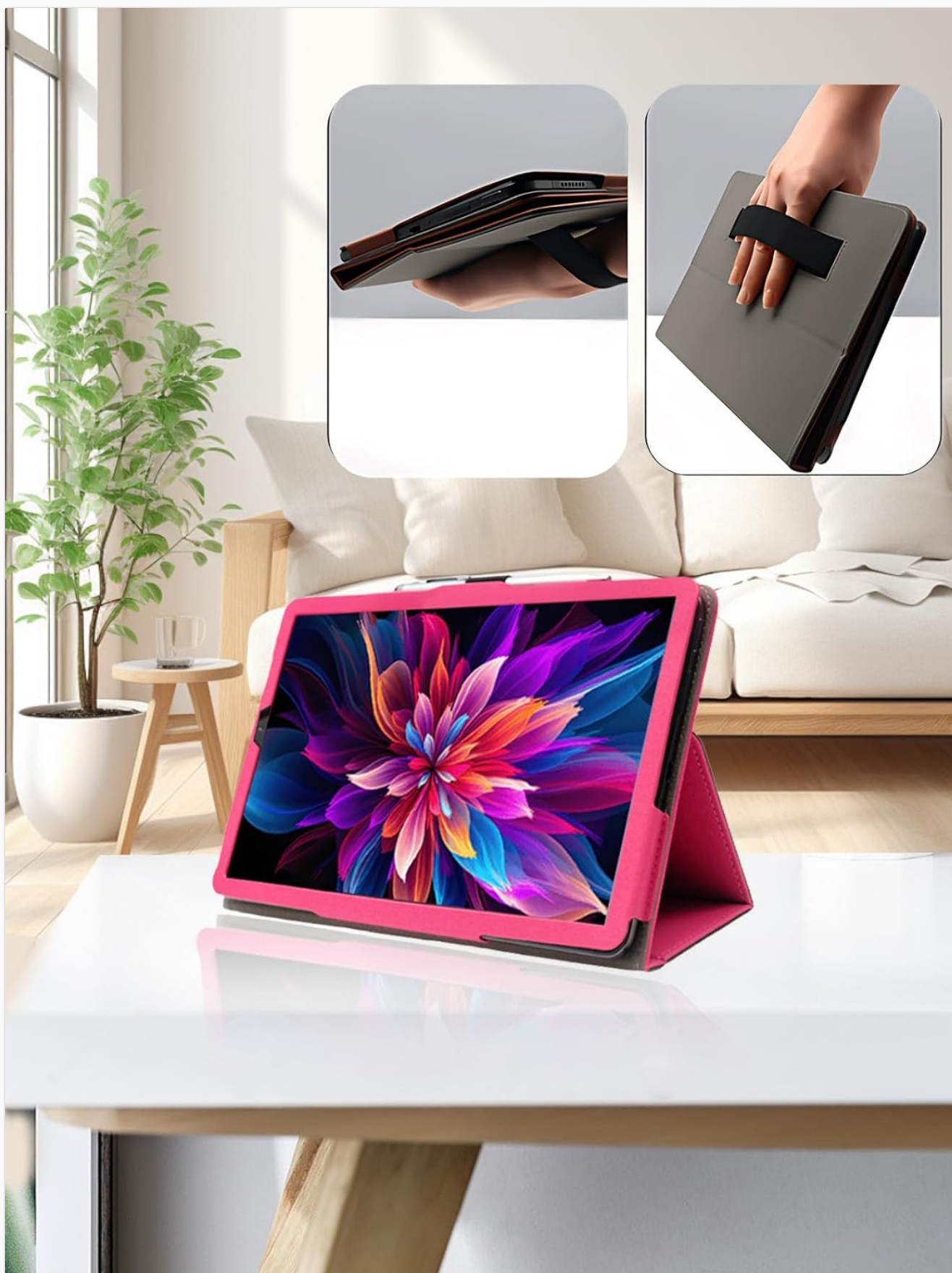
Image 3.1: Illustration of precise cutouts for volume, charging port, and camera, ensuring full accessibility.