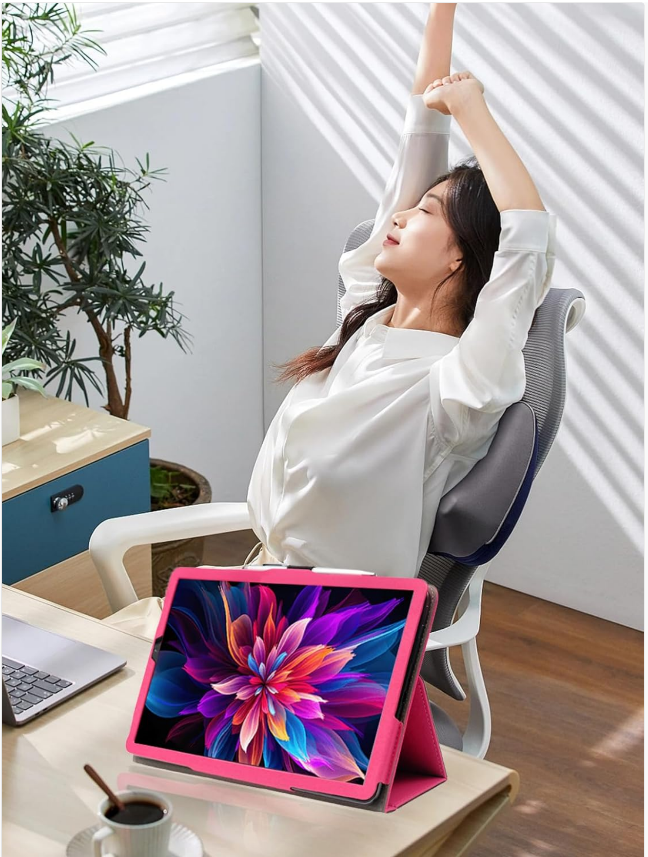
Image 4.1: The tablet case configured as a stand, providing an ergonomic viewing angle for extended use.