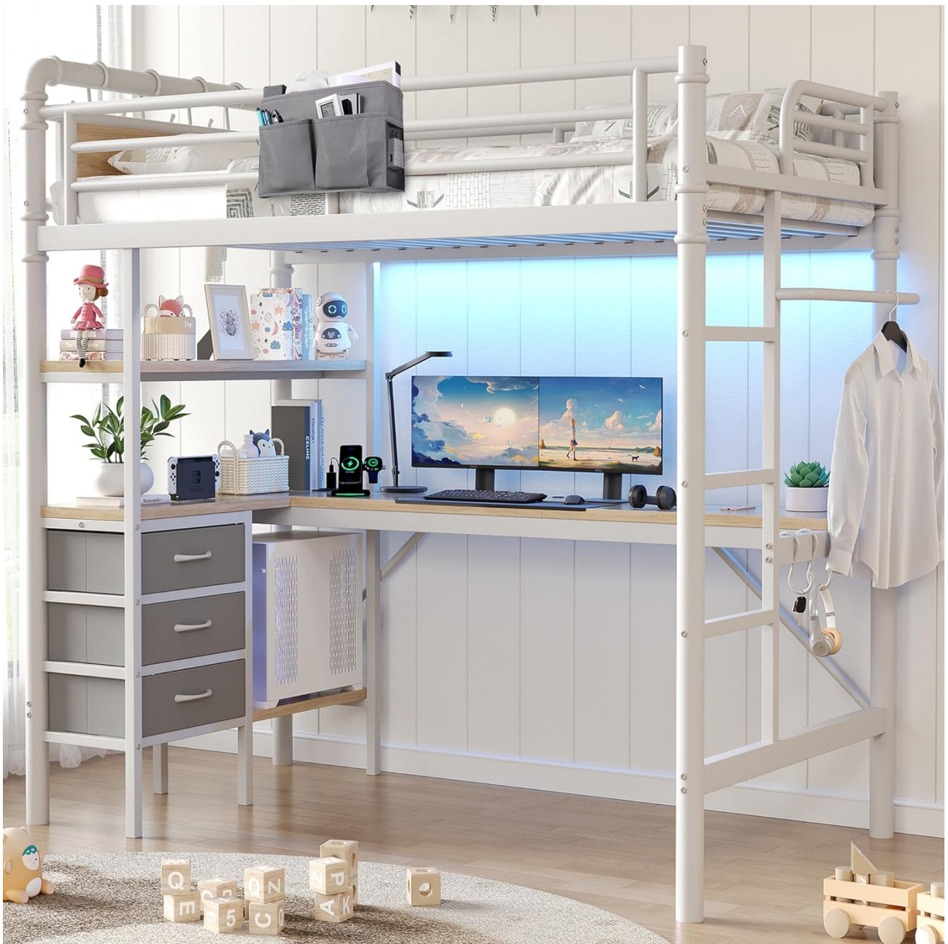
Figure 4.1: Fully assembled Jocoevol Twin Size Loft Bed with L-shaped desk, LED lighting, and storage.