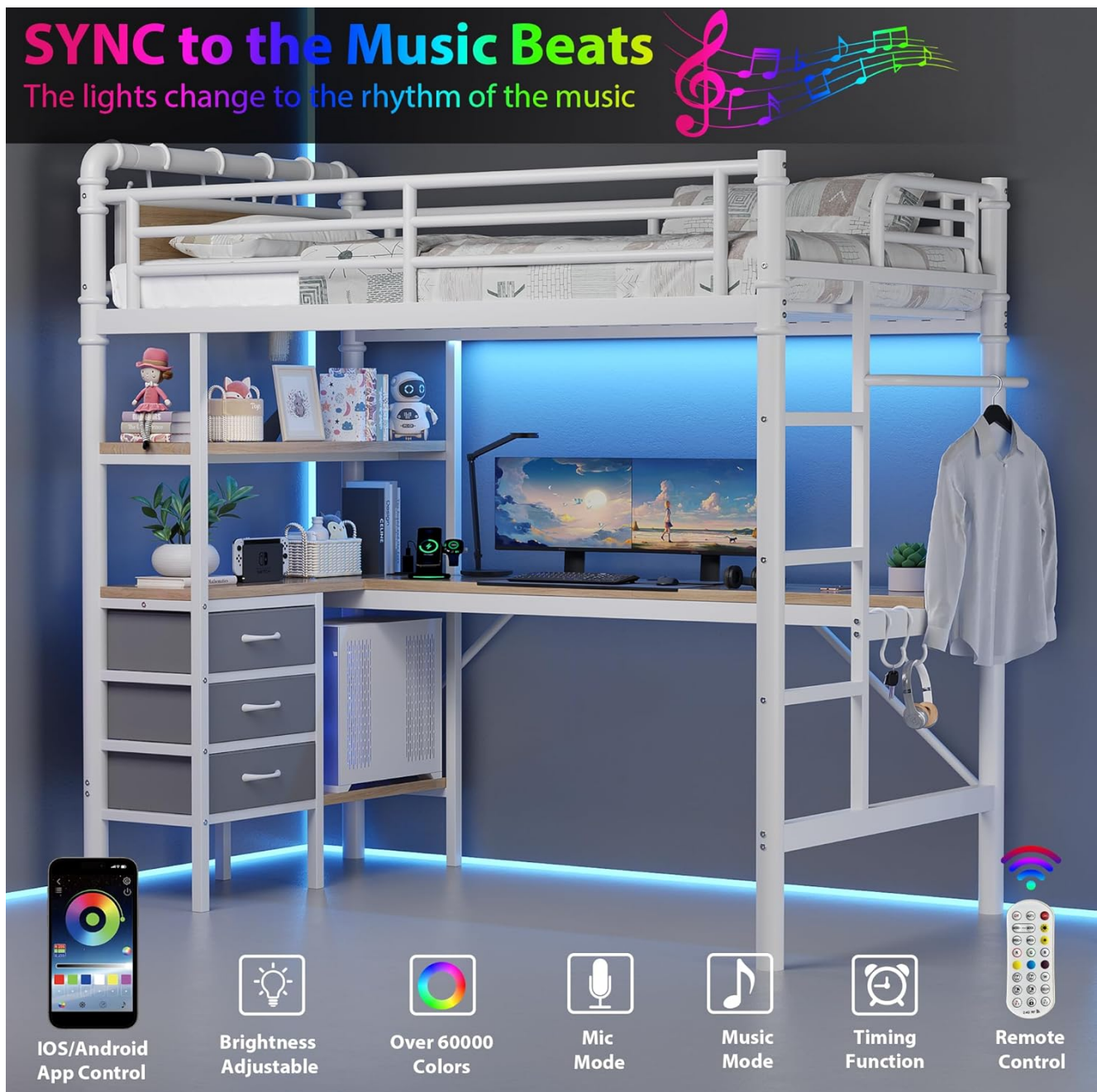
Figure 6.1: Overview of the RGB LED light features, including iOS/Android app control, brightness adjustment, over 60,000 colors, mic mode, music mode, timing function, and remote control.