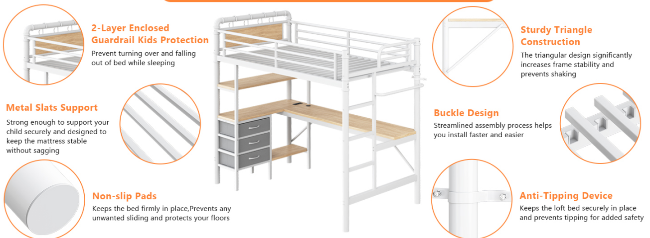
Figure 4.2: Diagram illustrating the heavy-duty metal frame construction, including 2-layer enclosed guardrail protection, sturdy triangle construction, metal slats support, buckle design, non-slip pads, and anti-tipping device.