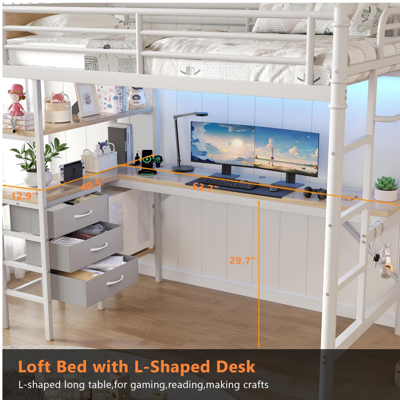
Figure 5.1: The L-shaped desk area, showing its dimensions (e.g., 63.7" length, 40.5" depth on the L-extension, 29.7" height from floor).

The L-shaped desk provides a spacious surface for various activities. The integrated shelves and fabric drawers offer organized storage. Arrange your items on the shelves and utilize the drawers for personal belongings.