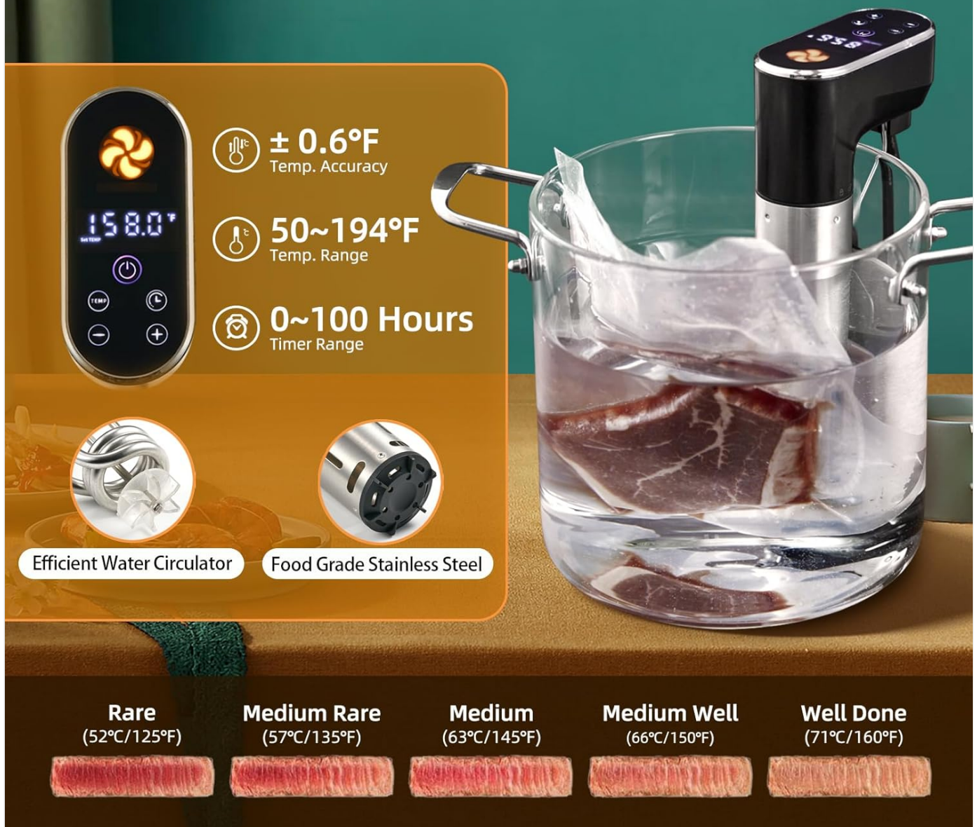
Figure 6: Accurate Temperature and Timer. Shows temperature accuracy of \pm 0.6^{\circ}\text{F} , temperature range of 50-194°F, and timer range of 0-100 hours. Also illustrates steak doneness levels from Rare to Well Done.