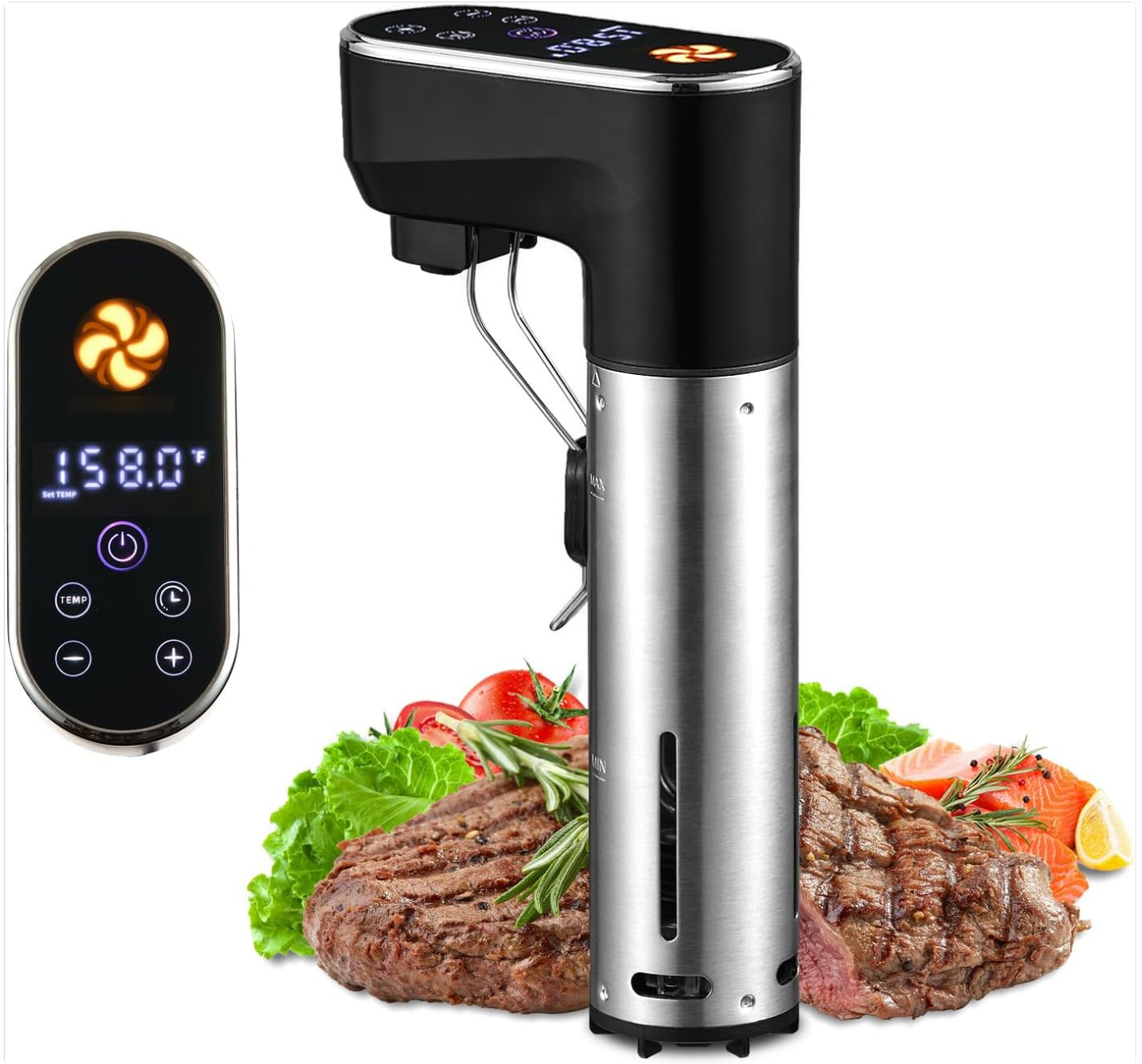
Figure 1: outohome Sous Vide Machine with control panel and cooked food.

The outohome Sous Vide Machine (Model MZJ-A01) is an immersion circulator designed for precise temperature cooking. It features a compact design and intuitive controls.