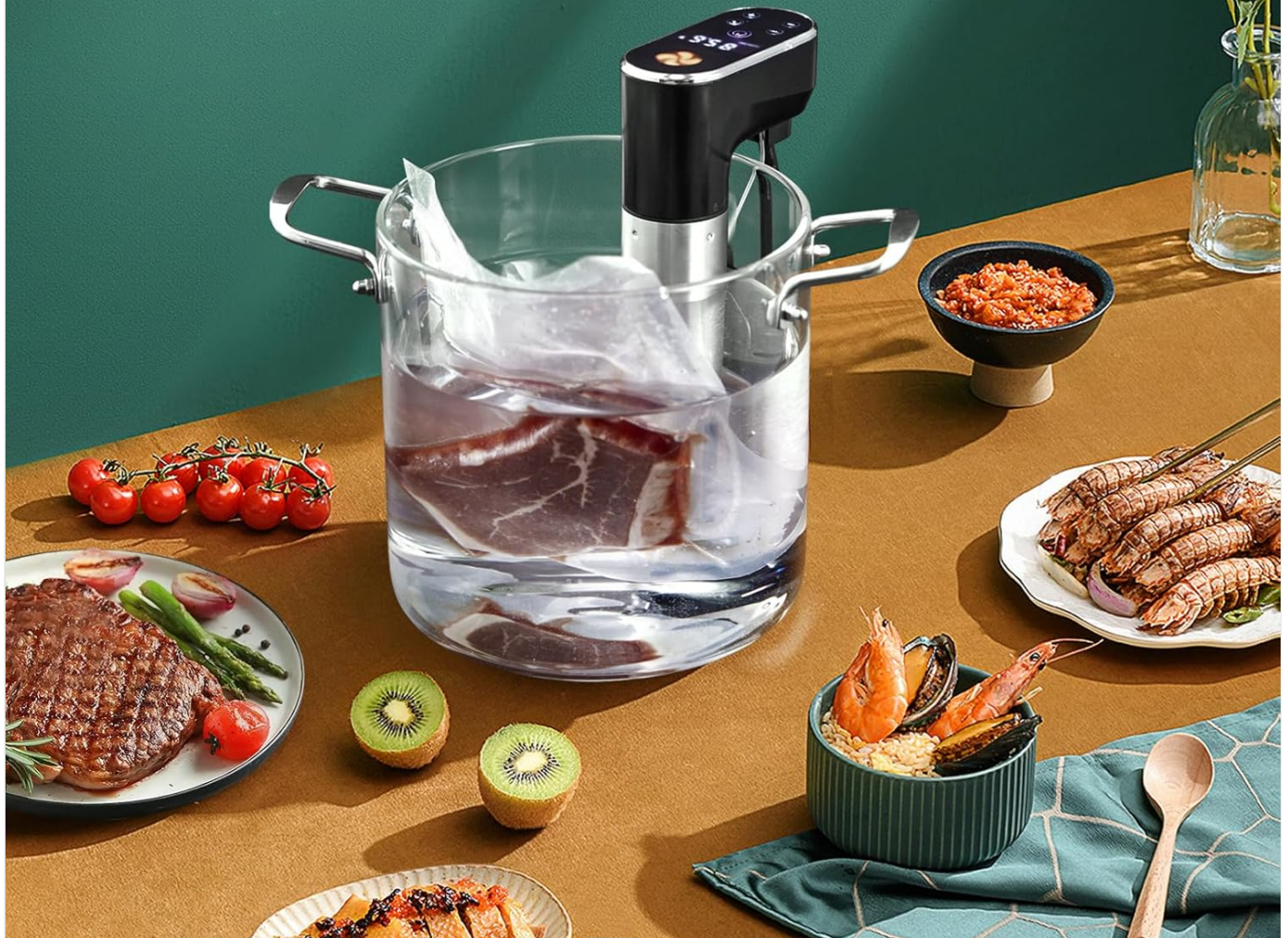
Figure 4: Sous vide machine properly set up in a cooking pot.