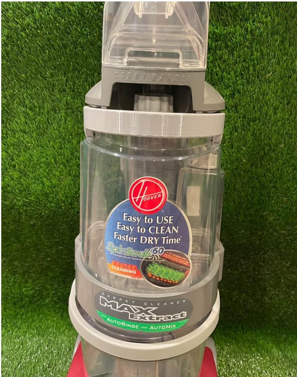
Image: The Hoover water tank with the replacement handle fully installed, showing the complete assembly.