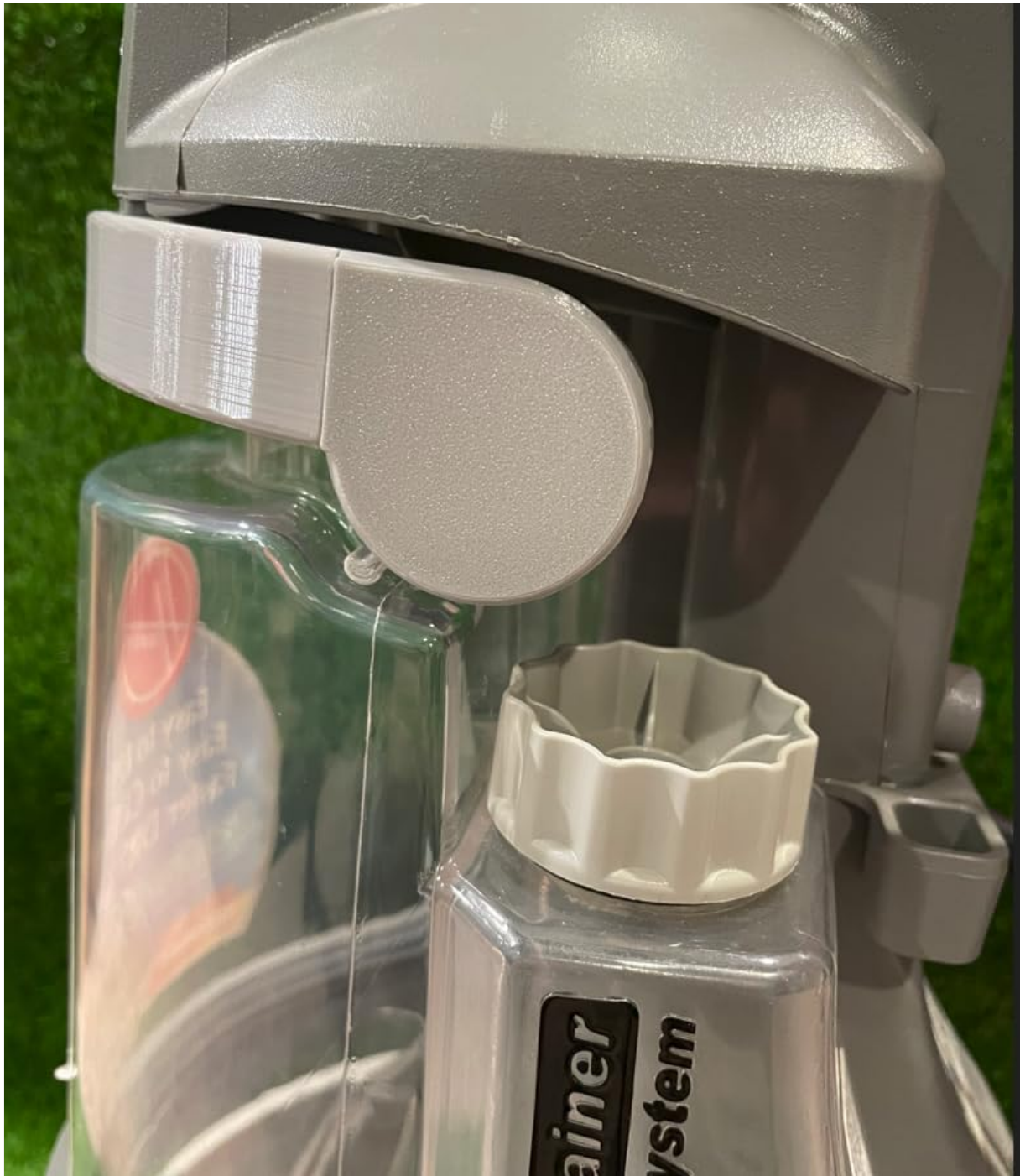
Image: A side close-up illustrating the secure connection of the handle to the water tank, highlighting the pivot point.