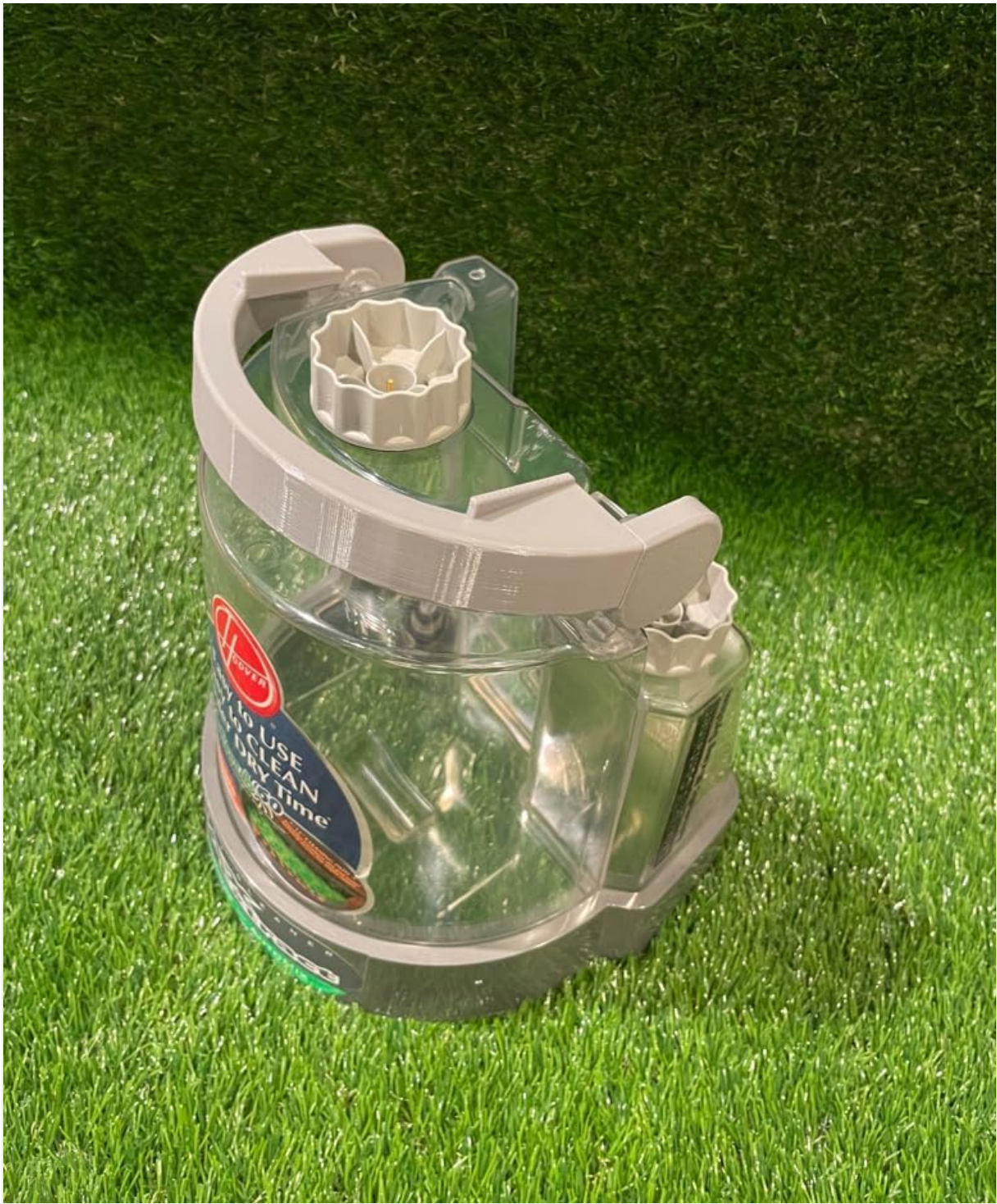
Image: The replacement handle securely attached to the top of a clear Hoover water tank, viewed from above.