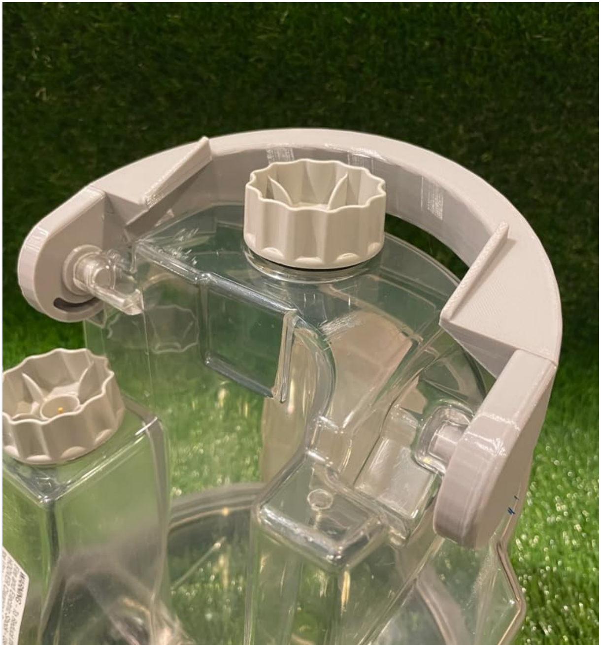
Image: A detailed view showing how the handle's pivot mechanism connects to the water tank, ensuring a snug fit.