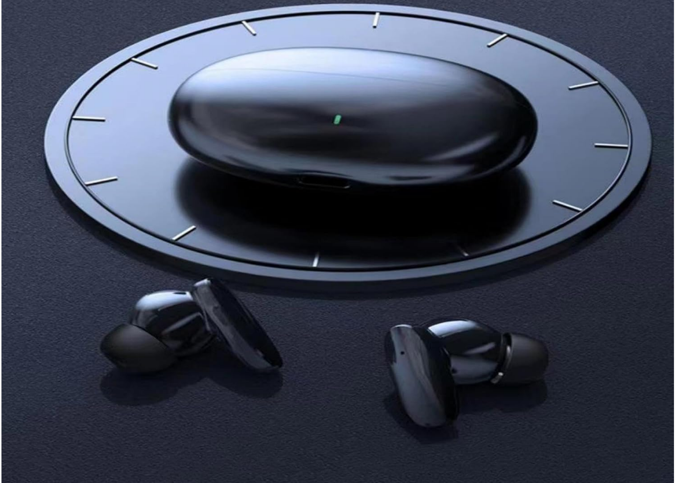
Image 2.1: Visual representation of the S90's extended battery endurance.

Powered by a button lithium battery that resists swelling over time, it offers longer lifespan and extended battery endurance