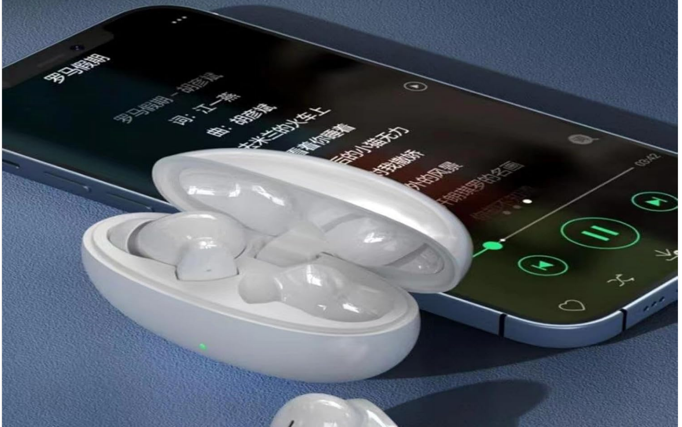
Image 2.4: The S90's quick and automatic connection upon opening the case.

Utilizing Hall switch technology paired with a high-speed processing chip, it automatically connects to your phone as soon as the case is opened, allowing instant use when you put them on