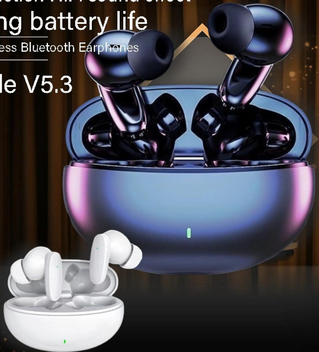
Image 1.1: Overview of the S90 True Wireless Bluetooth Earphones, emphasizing key features.