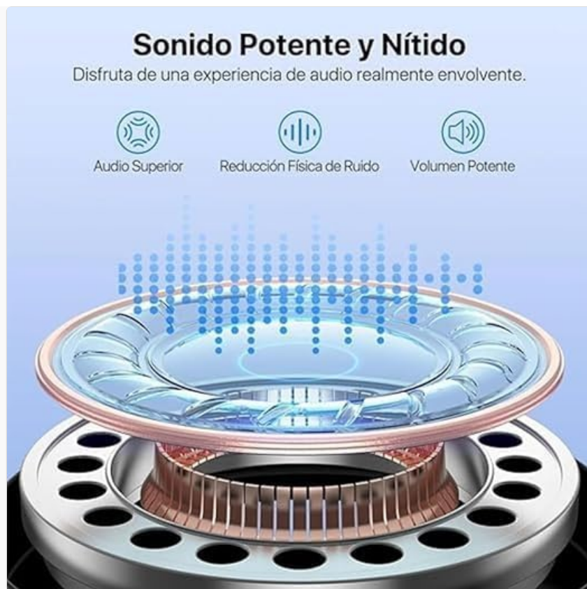
Image: A diagram illustrating superior audio, physical noise reduction, and powerful volume, highlighting the sound quality features of the earbuds.