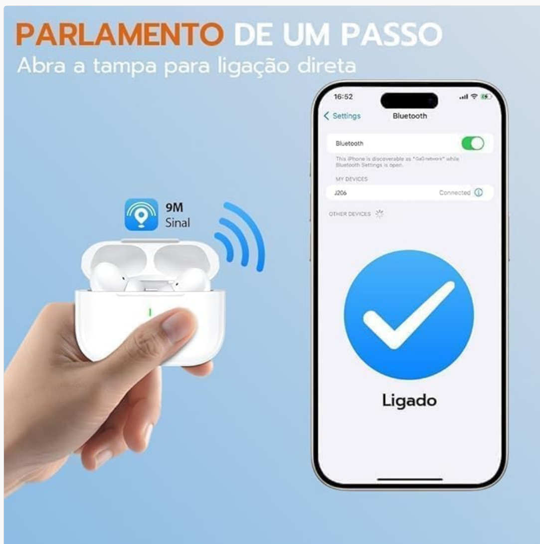
Image: A hand holding the open charging case, with a phone screen showing Bluetooth settings and a 'Connected' status, illustrating the one-step pairing process.