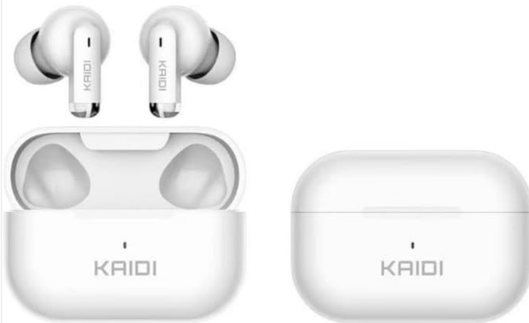
Image: The KAIDI KD-780 True Wireless Earbuds are shown in their open charging case, alongside a closed charging case. Both are white with the 'KAIDI' logo.