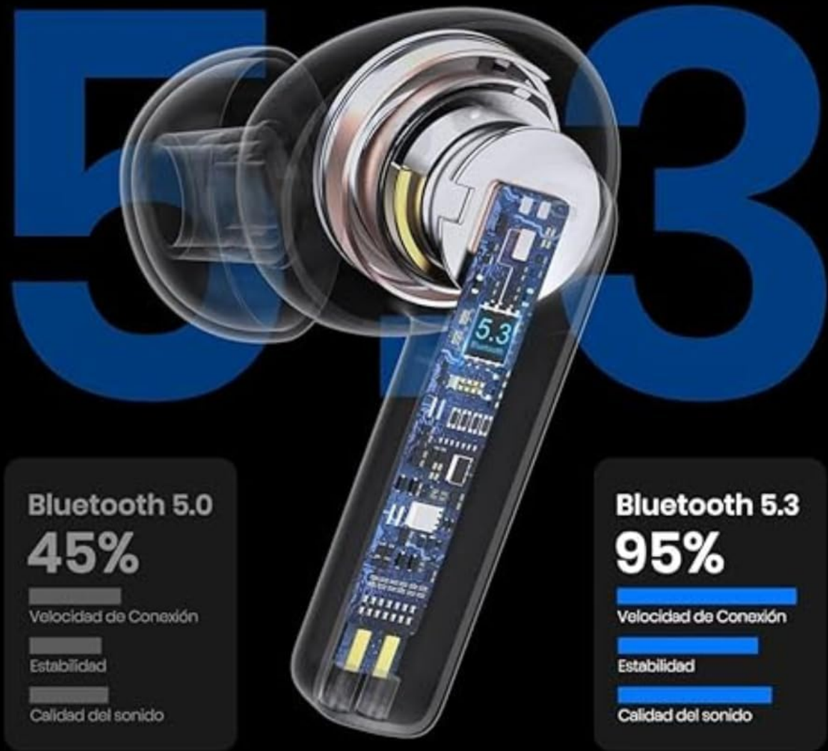
Image: A comparison graphic showing Bluetooth 5.0 vs. Bluetooth 5.3, highlighting 95% connection speed, stability, and sound quality for 5.3.