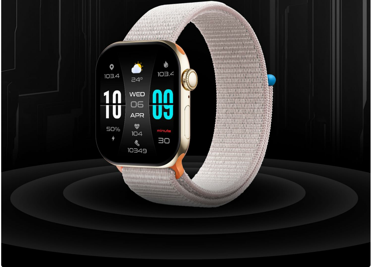
Image: Fire-Boltt Ring X Smart Watch in Mocha Mouse.