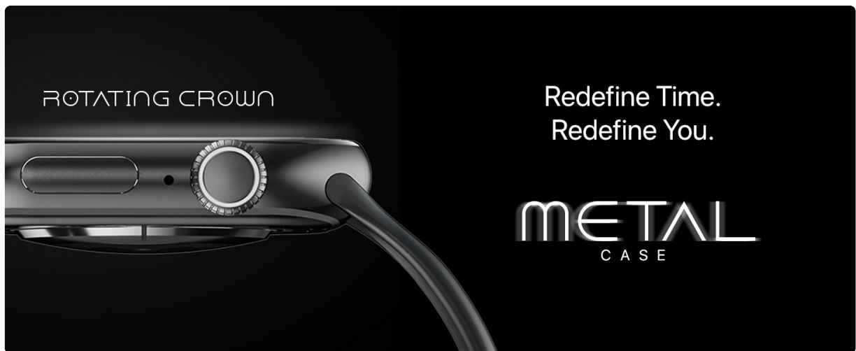
Image: The rotating crown and metal case of the Fire-Boltt Ring X Smart Watch.

The smartwatch features a durable zinc alloy case and a rotating crown for intuitive navigation. It is available in various band colors including Active Black, Active Starlight, Pink, Mocha Mouse, Blue, Active Green, and Black.