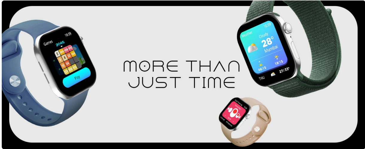
Image: Smart utilities and reminders available on the smartwatch.