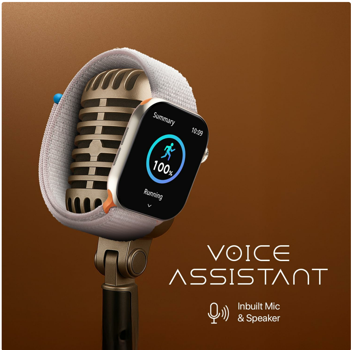
Image: Various menu options displayed on the smartwatch screen, demonstrating navigation.