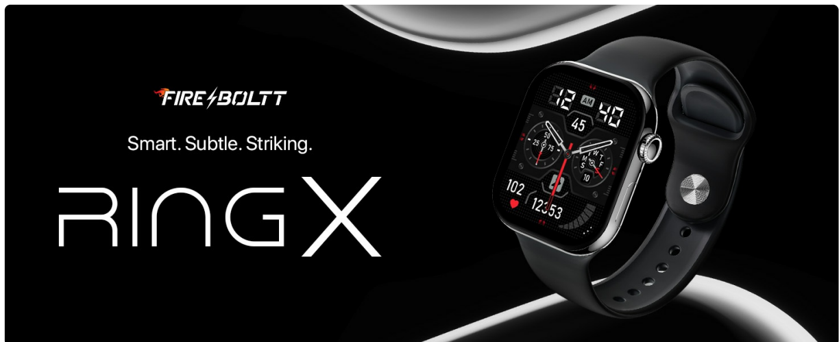
Image: The Fire-Boltt Ring X Smart Watch, highlighting its sleek design and the brand's slogan.

Thank you for choosing the Fire-Boltt Ring X Smart Watch. This manual provides essential information for the proper setup, operation, and maintenance of your device. Please read it thoroughly before use to ensure optimal performance and longevity of your smartwatch.