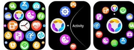
Image: Fire-Boltt Ring X Smart Watch in Active Starlight.