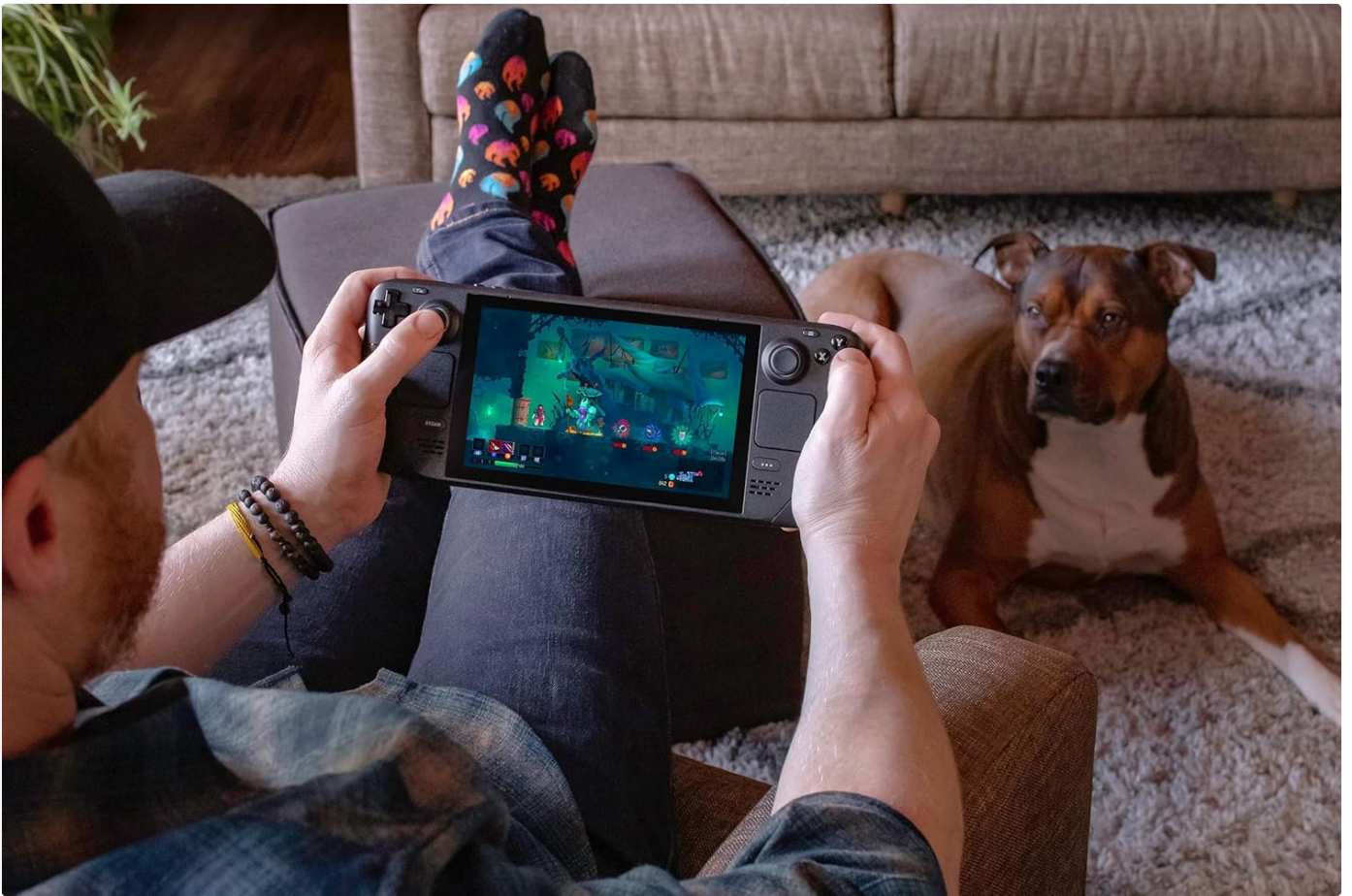
A user enjoying the Steam Deck OLED 512GB in a relaxed home setting.