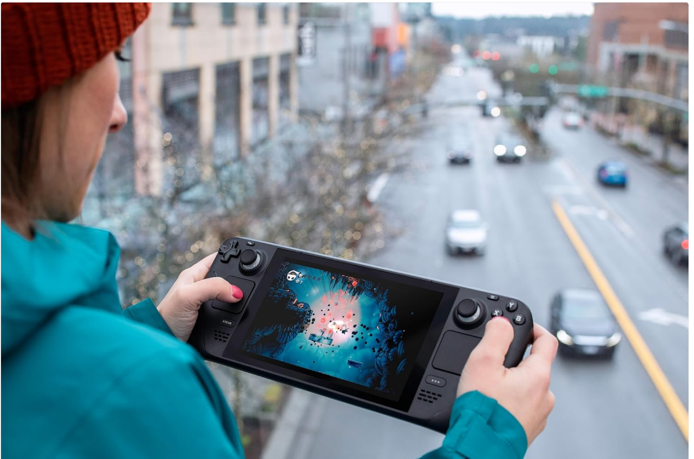
The Steam Deck OLED 512GB being used outdoors, demonstrating its portability.