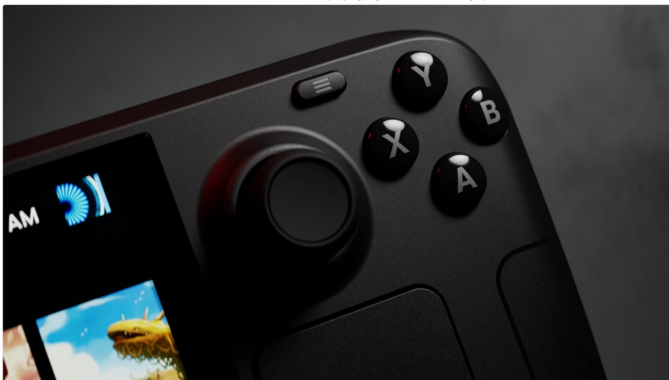
A close-up view of the Steam Deck's right-side controls, including the ABXY buttons and right joystick.