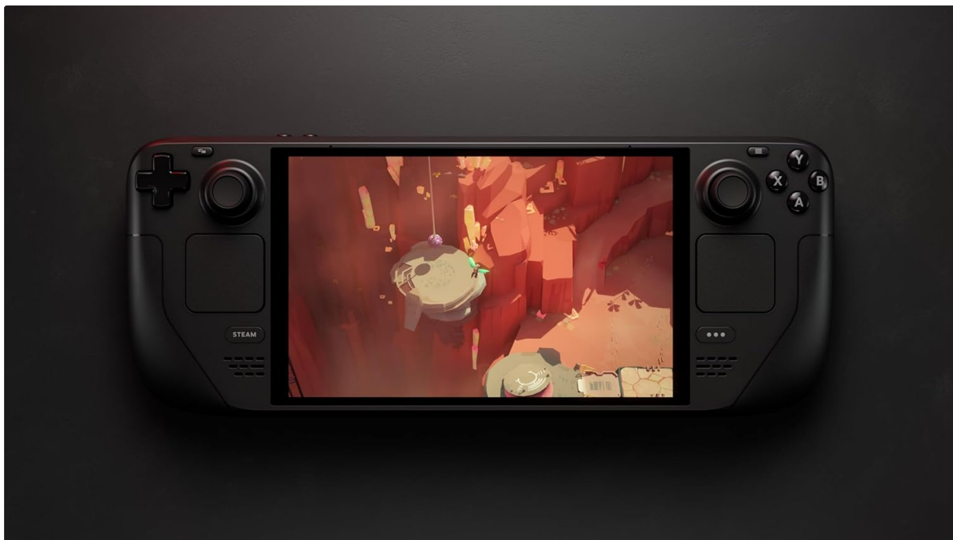
The Steam Deck OLED 512GB displaying a game with detailed graphics.