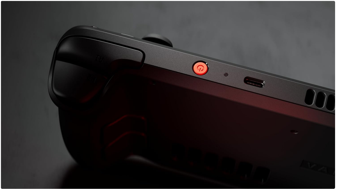
Top view of the Steam Deck, highlighting the power button and USB-C charging port.