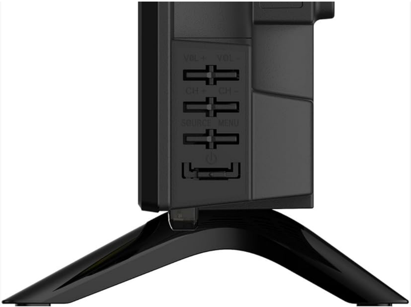
Figure 4.2: Side view of the TV, highlighting the integrated control buttons (Volume, Channel, Menu, Power).