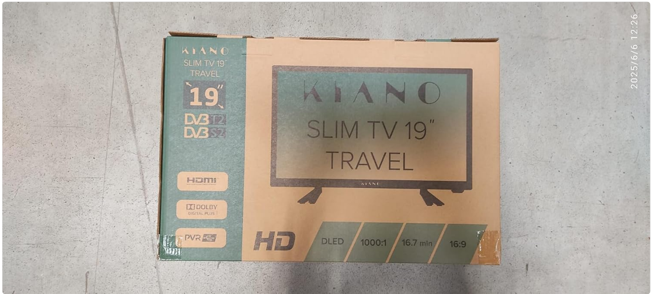
Figure 4.1: Front view of the KIANO 19-inch Portable HD TV, showing the screen and brand logo.