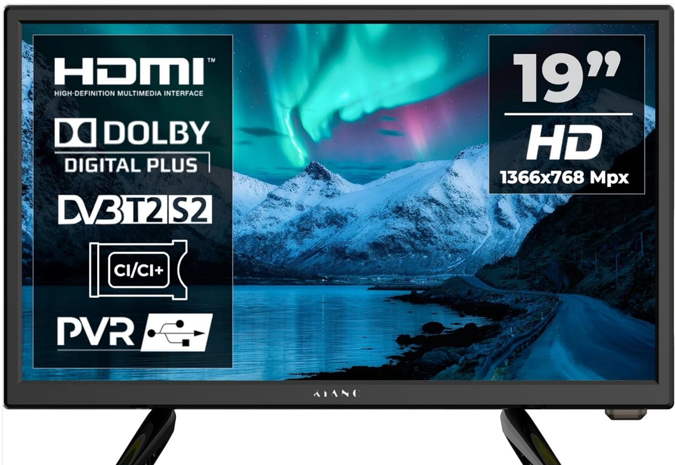
Figure 1.1: Front view of the KIANO 19-inch Portable HD TV.

Thank you for choosing the KIANO 19-inch Portable HD TV. This manual provides essential information for the safe and efficient operation of your new television. Please read it thoroughly before use and keep it for future reference. This portable television is ideal for use in various environments, including camping cars, trucks, and garden sheds, thanks to its versatile 12V/230V power supply. It features a DLED 1366x768 screen, DVB-T2/S2/C tuners, and multiple connectivity options including HDMI, USB, CI, and VGA.