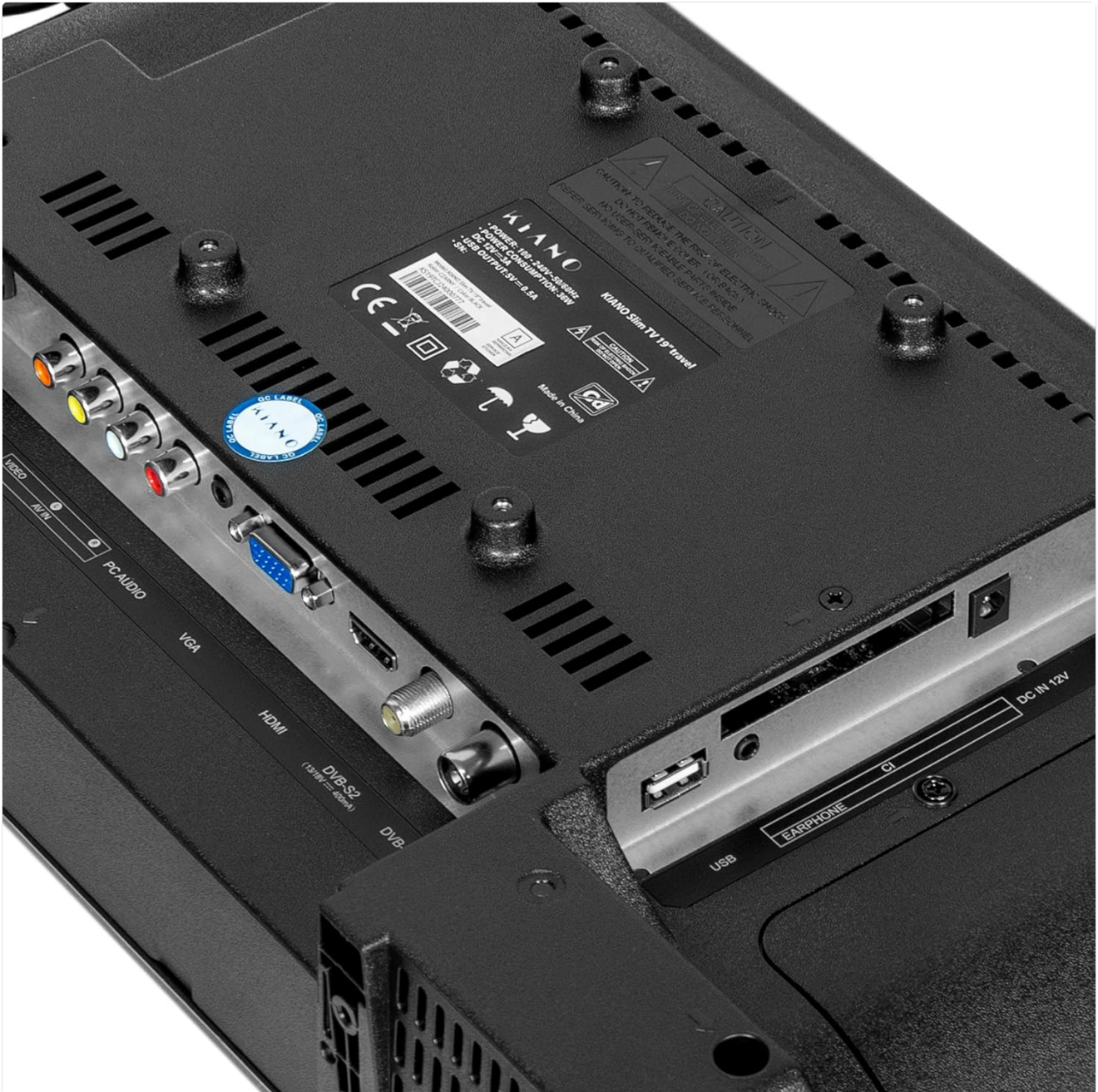
Figure 5.1: VESA 100x100 mounting points on the rear of the TV.

The KIANO 19-inch TV is VESA compatible (100x100mm), allowing it to be mounted on a wall using a compatible VESA wall mount bracket (not included). Follow the instructions provided with your wall mount bracket for safe installation.