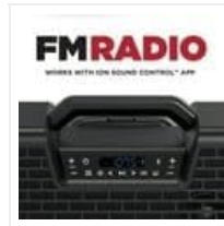
Figure 2: Top control panel of the Block Rocker Icon, featuring the power button, display, and FM radio controls.

Press and hold the Power button located on the control panel to turn the speaker on or off. The display will illuminate, indicating the unit is ready for use.