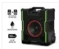
Figure 3: Key features of the Block Rocker Icon, highlighting its Stereo-Link capability for connecting two speakers.

For a true stereo sound experience, you can link two Block Rocker Icon speakers together using the proprietary Stereo-Link technology. Refer to the detailed instructions in the full manual for pairing two units.