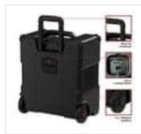
Figure 7: The integrated top handle and all-terrain wheels, designed for easy transport of the speaker.