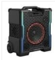
Figure 1: ION Block Rocker Icon Portable Bluetooth Speaker, showcasing its robust design and integrated lighting.

Thank you for purchasing the ION Block Rocker Icon All-Terrain Portable Bluetooth Speaker. This manual provides important information regarding the setup, operation, maintenance, and troubleshooting of your new speaker. Please read this manual thoroughly before using the product to ensure proper operation and to maximize its lifespan.