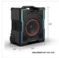
Figure 6: Diagram illustrating the dimensions of the Block Rocker Icon speaker.