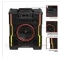
Figure 5: The Block Rocker Icon's front panel with dynamic multi-colored lights, controllable via the ION Sound Control app.

Enhance your experience by downloading the ION Sound Control app from your device's app store. The app allows for remote control of various speaker functions, including lighting effects, EQ adjustments, and more.