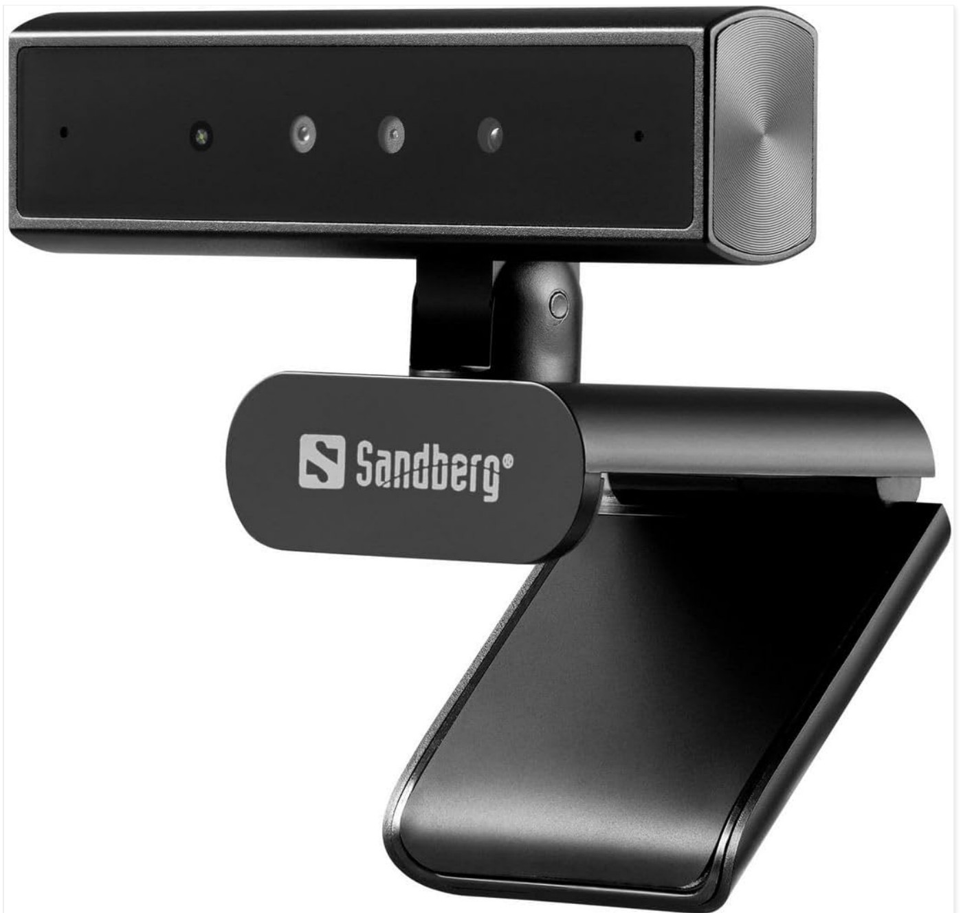
Image: The Sandberg Face-ID Webcam Mini Pro, featuring a sleek black design with a flexible mounting clip and the Sandberg logo prominently displayed.