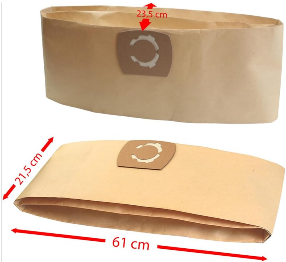
Image 2.2: This image illustrates the approximate dimensions of the MisterVac vacuum cleaner bag. When unfolded, the bag measures approximately 61 cm in length, 21.5 cm in height, and the opening width is about 23.5 cm.

The bags feature a robust cardboard cover that facilitates easy closure of the dust bag. The integrated claws on the bag's collar ensure a tight seal and secure fit against the vacuum cleaner's suction collector, preventing dust leakage.