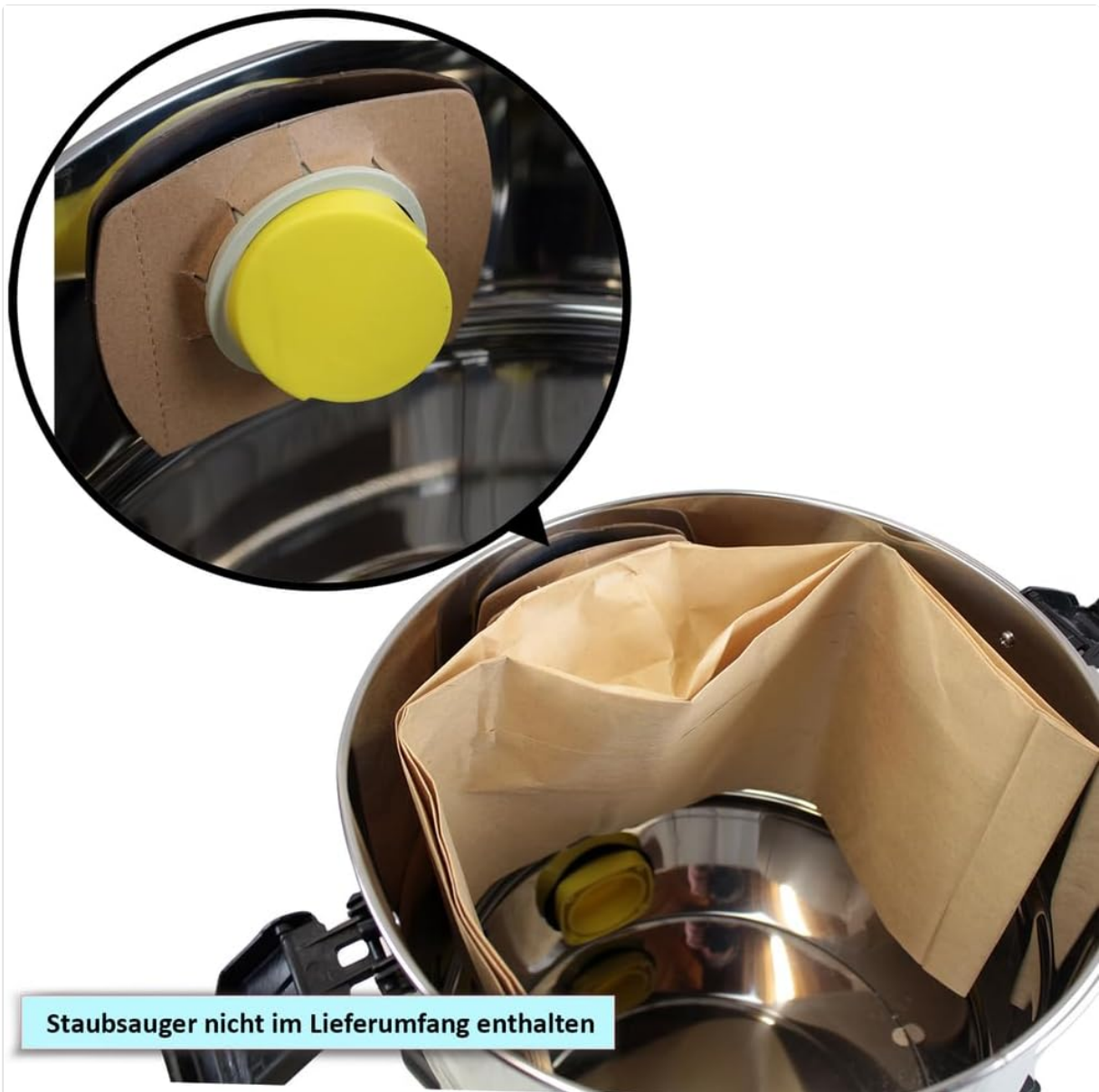
Image 4.2: A close-up view demonstrating how the MisterVac bag's cardboard collar connects to the vacuum cleaner's intake port. The yellow cap, part of the vacuum cleaner, helps to secure the bag's opening. Please note: The vacuum cleaner is not included.