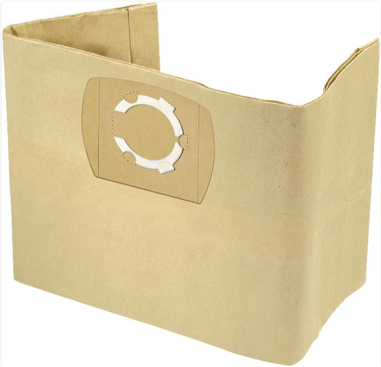
Image 2.1: A single MisterVac vacuum cleaner bag, folded and ready for use. It features a sturdy cardboard collar with a circular opening for connection to the vacuum cleaner's intake.