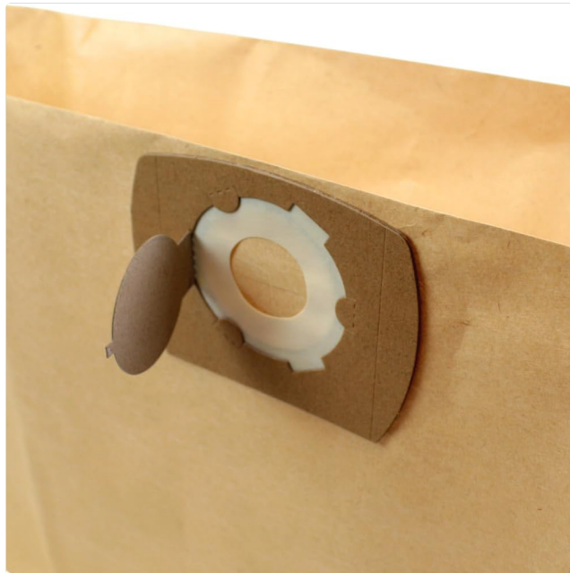
Image 2.3: A detailed view of the bag's cardboard collar, showing the circular opening and the small flap that can be used to seal the opening when the bag is full, preventing dust from escaping during disposal.