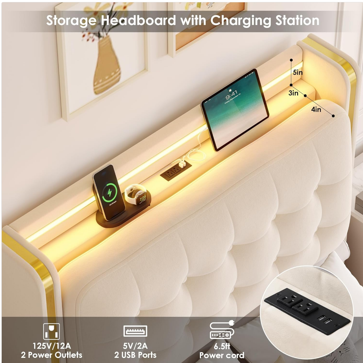
Figure 2: Detail of the headboard's charging station and storage area.