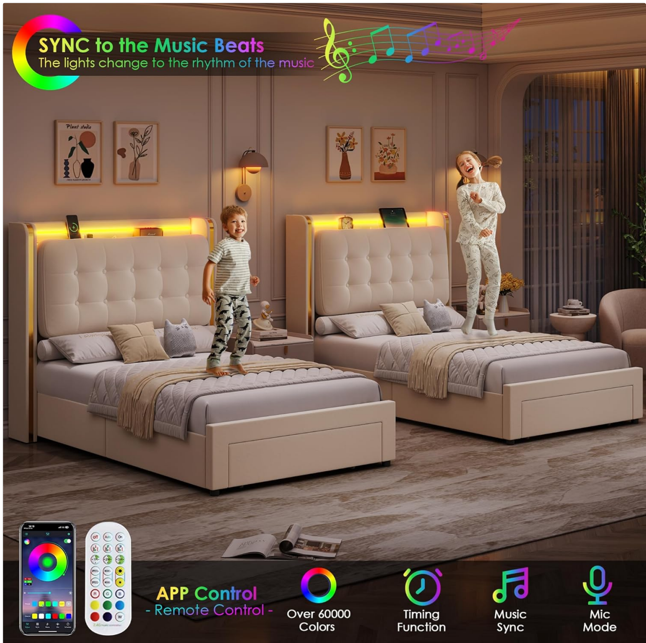
Figure 5: RGB LED lighting with remote and app control options.

The headboard features a built-in RGB light strip. Control the lights via the provided remote control or a compatible smartphone application. Multiple colors and modes are available, including music sync functionality.