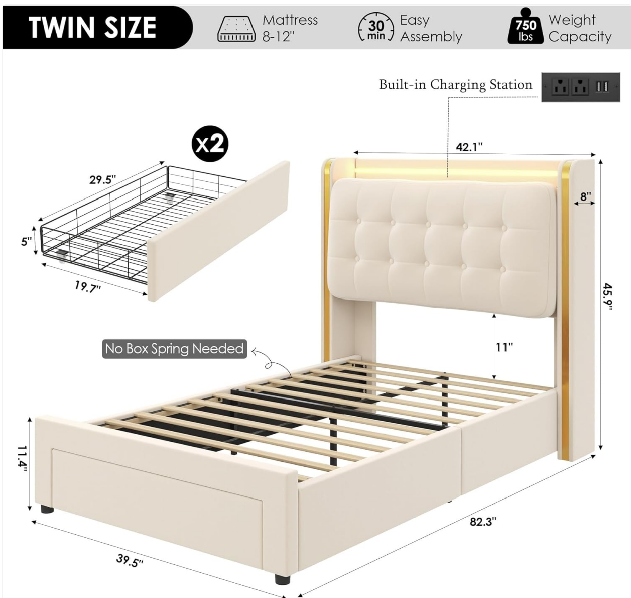
Figure 1: Overview of bed frame components and dimensions.

Clear an adequate space for assembly. Lay out all components on a soft surface to prevent damage. Identify all parts according to the included parts list.