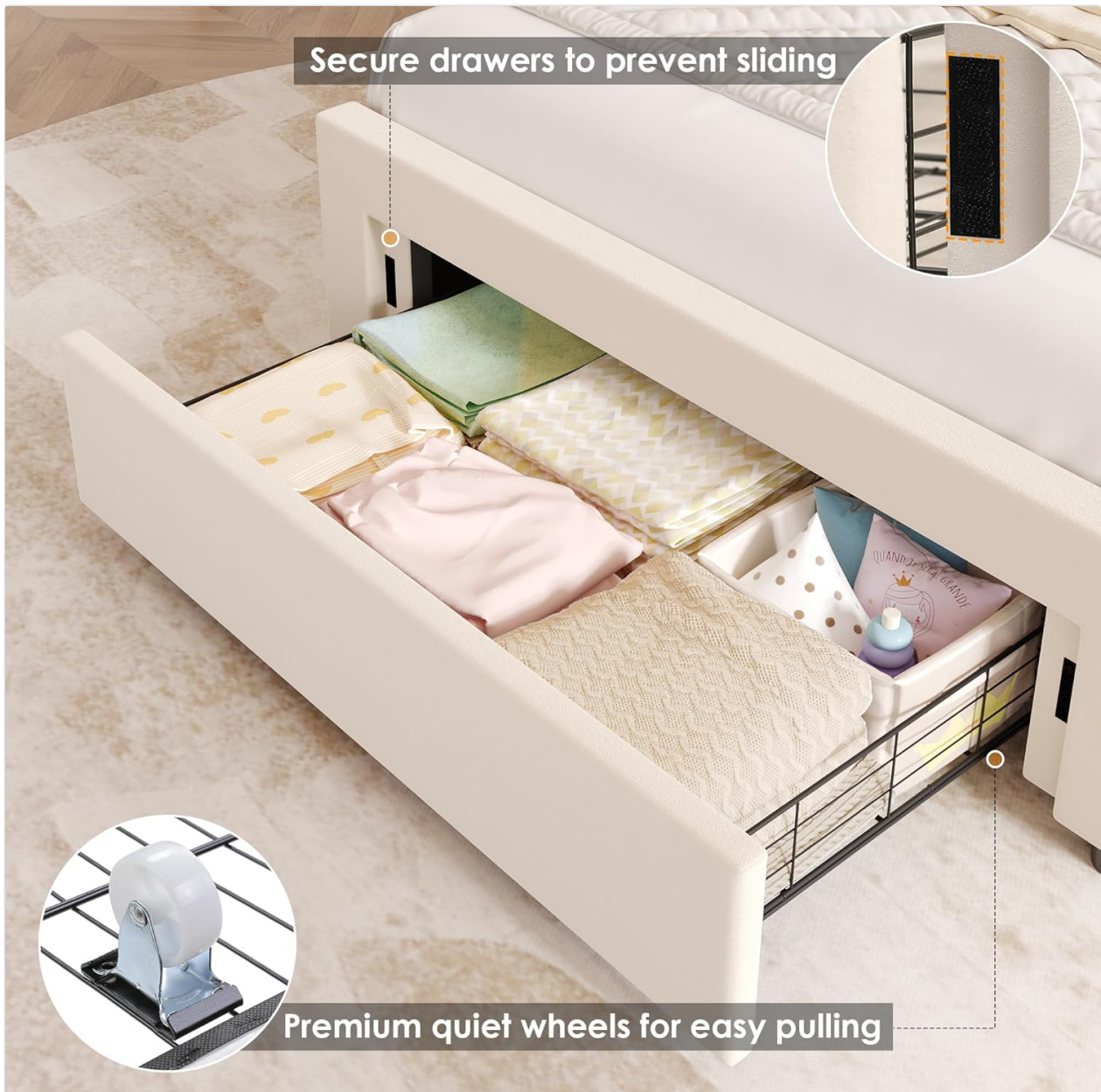
Figure 4: The spacious steel storage drawer, ideal for organizing various items.

Assemble the steel storage drawers according to the separate instructions. Each drawer includes two secure locking devices and four smooth, silent wheels for easy operation. Insert the assembled drawers into the designated slots under the bed frame.