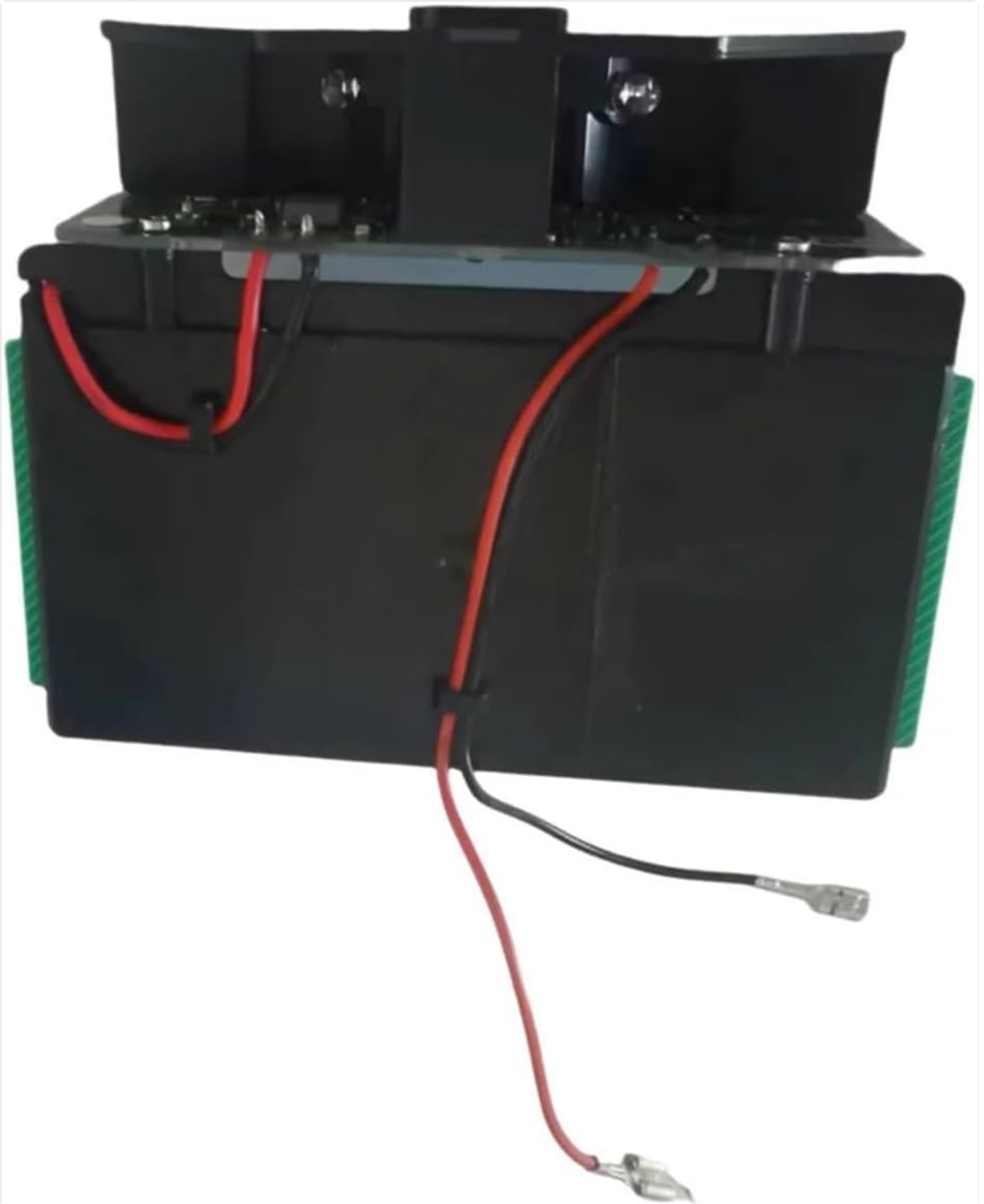
Figure 3: Bottom view of the circuit board, showing the protective casing and wire routing. This perspective helps in understanding how the board sits within the dock.