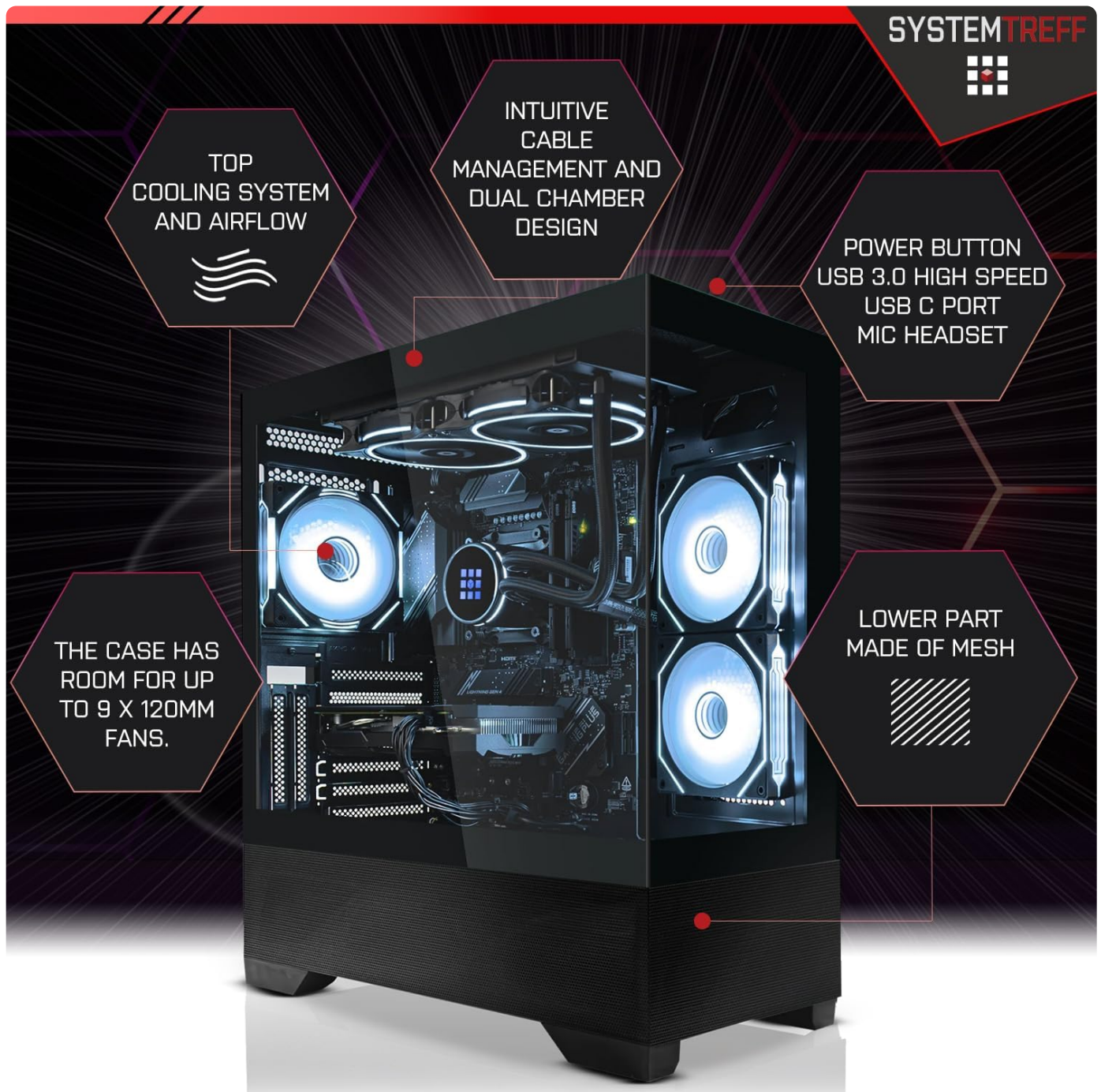
Image: An internal view of the PC case, emphasizing the top cooling system, intuitive cable management, dual chamber design, and the power button with USB 3.0, USB-C, and mic/headset ports. It also shows the lower part made of mesh for improved airflow.