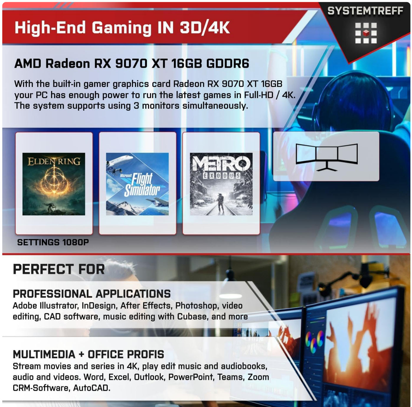
Image: An illustration showing the PC's capability for high-end gaming in 3D/4K, with examples of games like Elden Ring and Metro Exodus. It also highlights suitability for professional applications (Adobe Illustrator, InDesign, Photoshop, video editing, CAD software) and multimedia/office use (4K streaming, audiobooks, Word, Excel, Teams, AutoCAD).