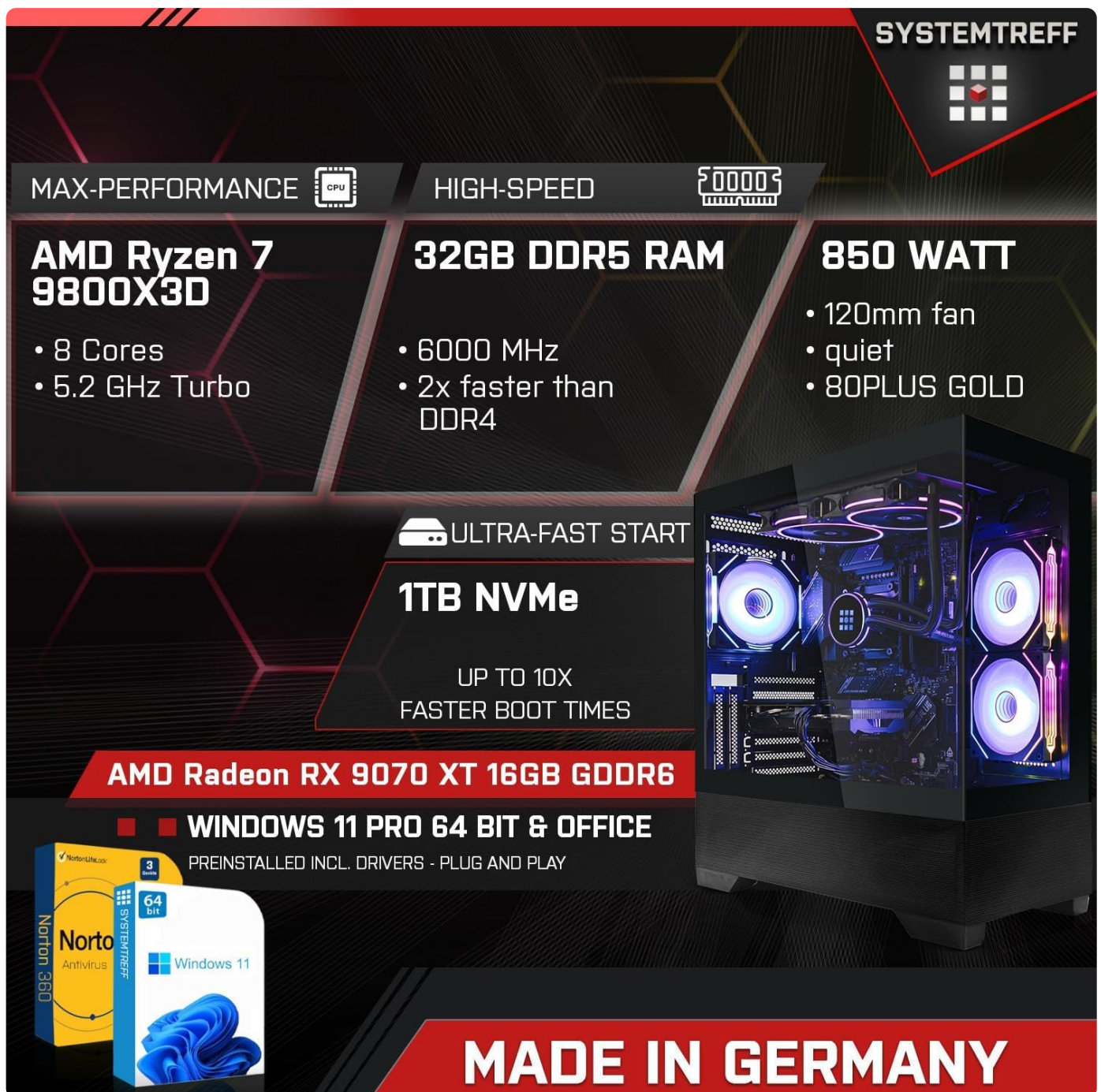
Image: An infographic highlighting the PC's core specifications: AMD Ryzen 7 9800X3D (8 Cores, 5.2GHz Turbo), 32GB DDR5 RAM (6000 MHz), 850 Watt PSU, 1TB NVMe SSD, AMD Radeon RX 9070 XT 16GB GDDR6, Windows 11 Pro, and Norton 360 Security.

The SYSTEMTREFF High-End Gaming PC is engineered for demanding gaming, streaming, and professional applications. It features an AMD Ryzen 7 9800X3D processor, AMD Radeon RX 9070 XT graphics, 32GB DDR5 RAM, and a fast 1TB M.2 NVMe SSD, ensuring exceptional performance and responsiveness. This system comes with Windows 11 Pro pre-installed, ready for immediate use.