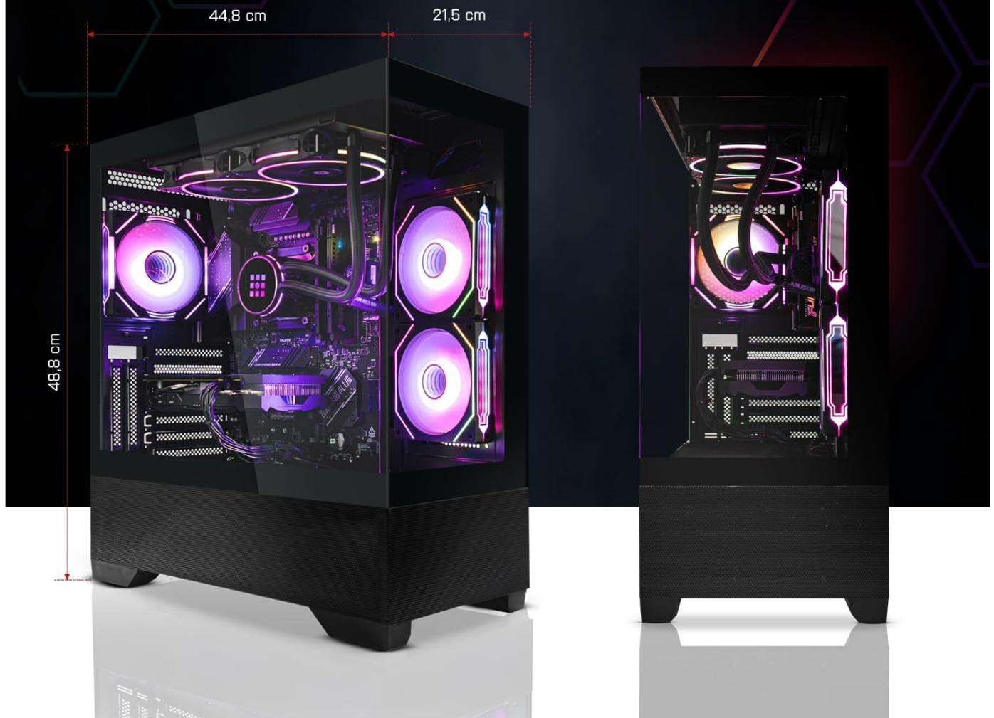
Image: A visual representation of the PC case dimensions: 44.8 cm (depth), 21.5 cm (width), and 48.8 cm (height).