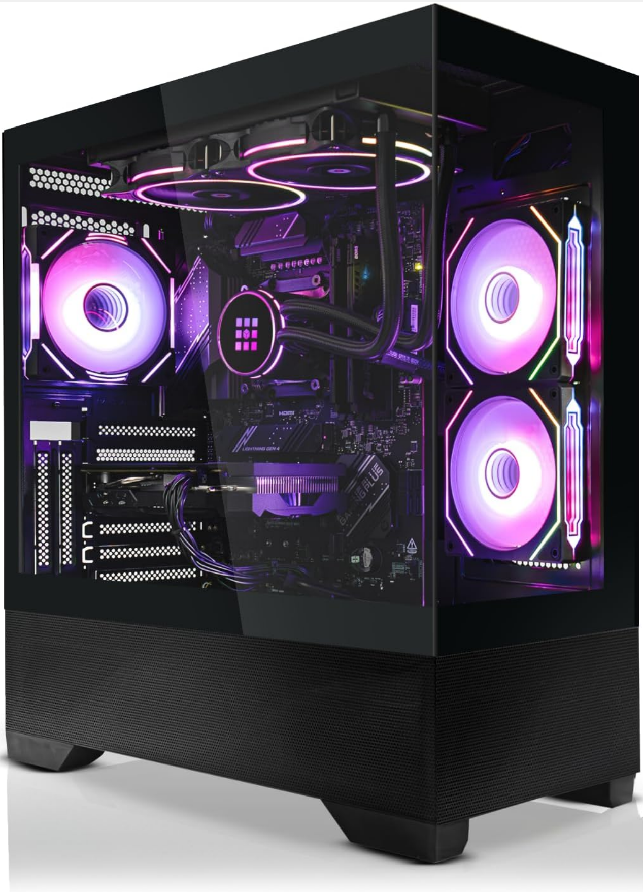
Image: The SYSTEMTREFF High-End Gaming PC tower, showcasing its transparent side panel with vibrant internal RGB lighting and cooling fans.