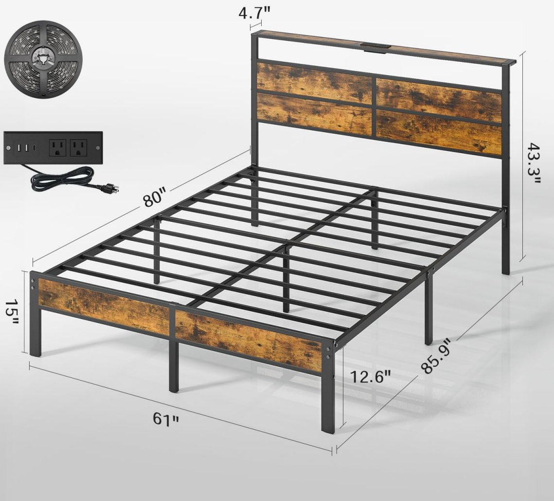
Image 1: Overview of Liains Queen Size Bed Frame components and dimensions (L: 85.9", W: 60.6", H: 43.3").