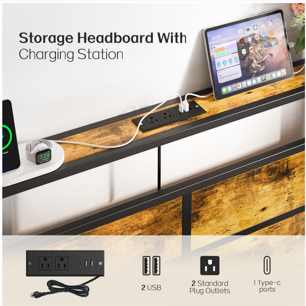
Image 3: The headboard's built-in charging station, featuring two USB ports, two standard AC outlets, and one Type-C port.