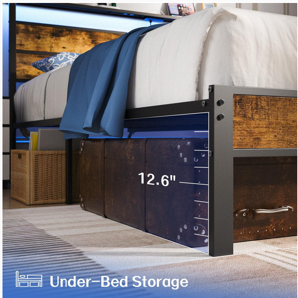
Image 6: Illustration of the 12.6-inch under-bed clearance, suitable for storage containers.