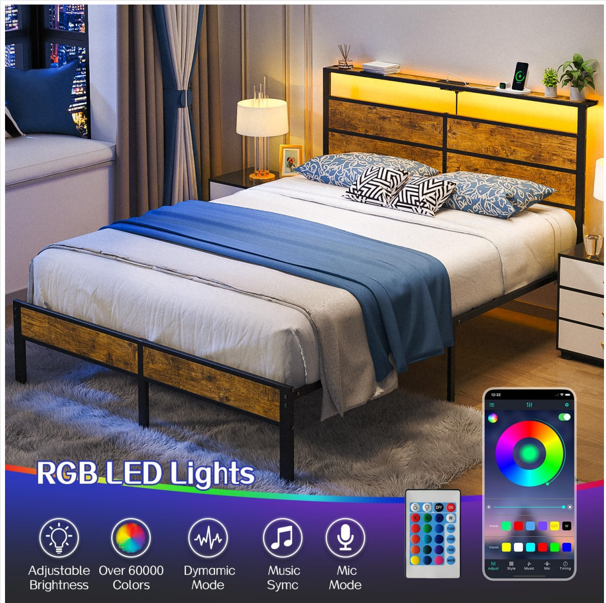
Image 4: The bed frame with its RGB LED lights set to a blue hue, demonstrating the customizable lighting options.