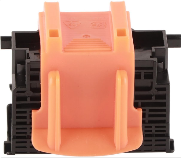
Figure 2.1: Top view of the print head with its orange protective cover installed. This cover helps prevent damage to the delicate internal components during handling and storage.