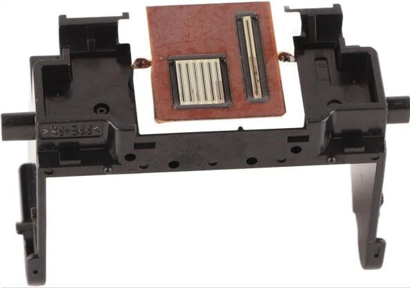
Figure 2.2: Bottom view of the print head with the protective cover removed, revealing the print nozzle array and electrical contacts. These are the critical components for ink delivery and communication with the printer.