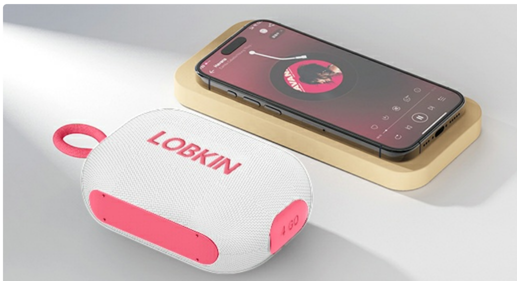
Pairing the LOBKIN ES10 speaker with a mobile device for audio playback.