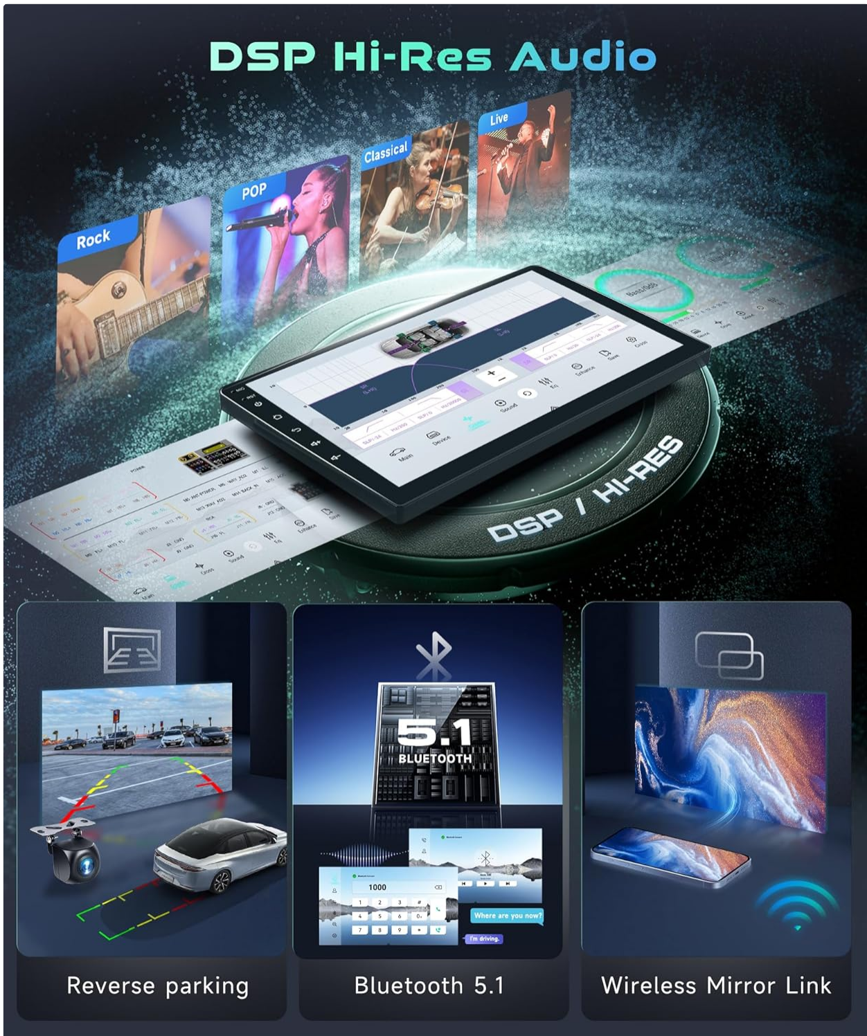
Image: MAHVEC car stereo's DSP audio settings interface with equalizer controls.

Adjust audio settings using the Digital Sound Processor (DSP) to customize sound output. This includes equalizer settings, balance, fader, and subwoofer controls for an optimized listening experience.