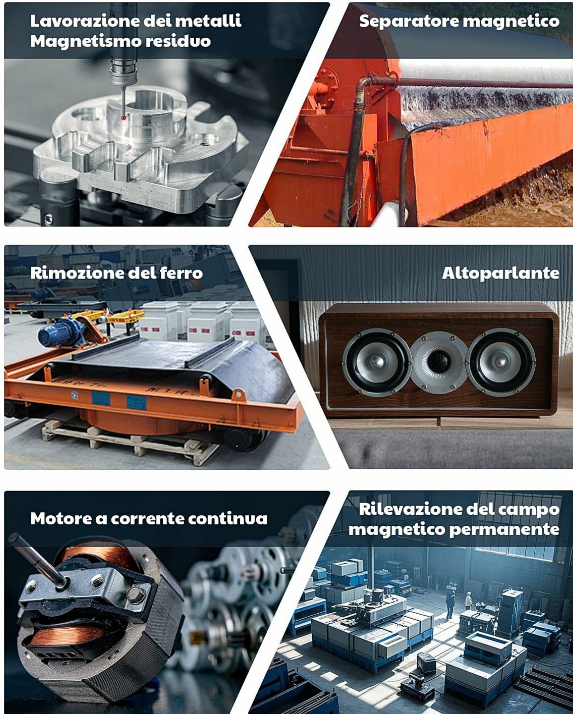
Figure 9.1: The AEGTEST 8103 is suitable for diverse applications such as measuring residual magnetism in metalworking, evaluating magnetic separators, monitoring iron removal, testing loudspeakers, analyzing DC motors, and detecting permanent magnetic fields in various industrial settings.