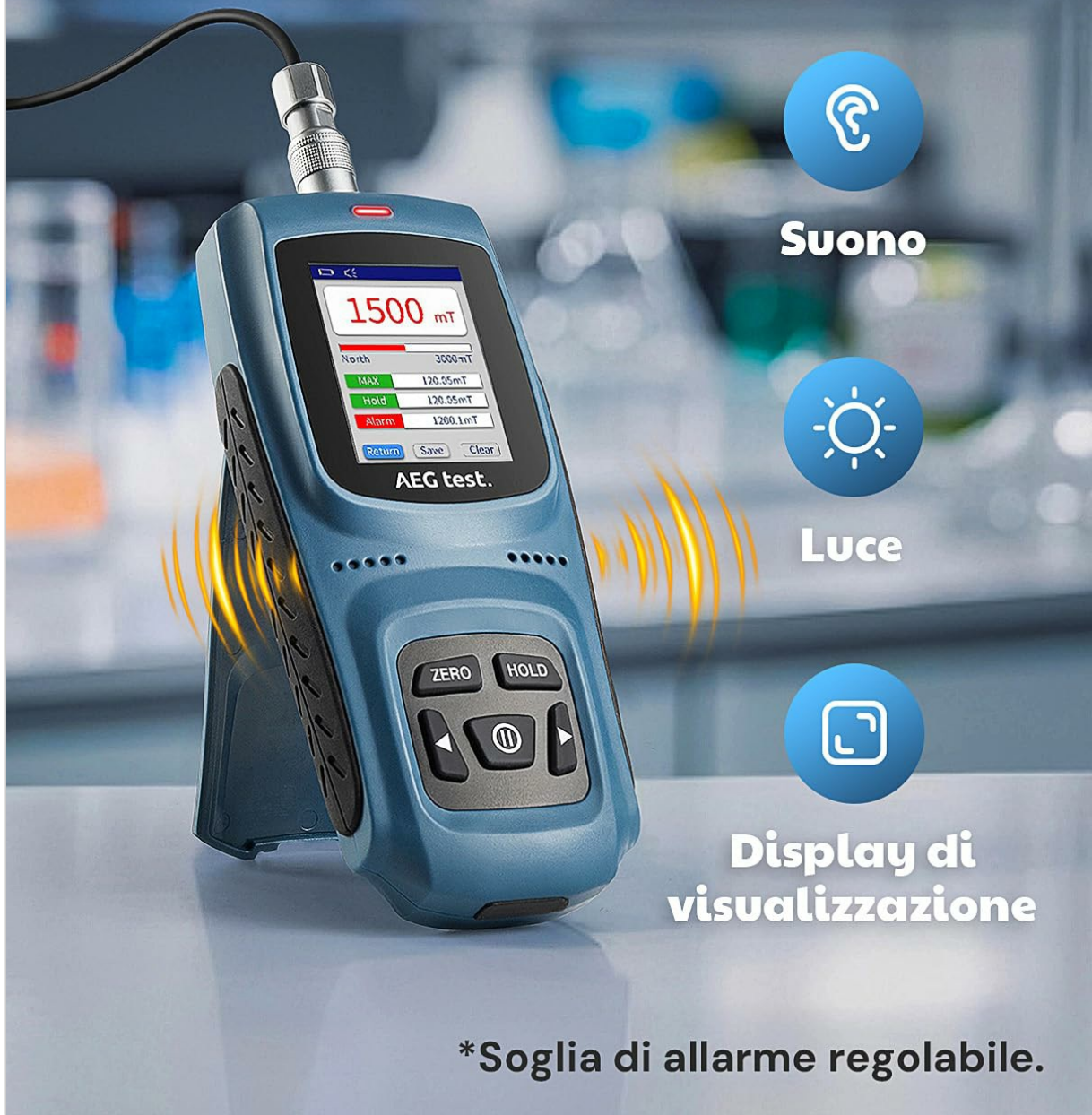
Figure 5.2: The immediate alarm feature provides easy monitoring with sound, light, and display notifications. The alarm threshold is adjustable to suit specific measurement requirements.