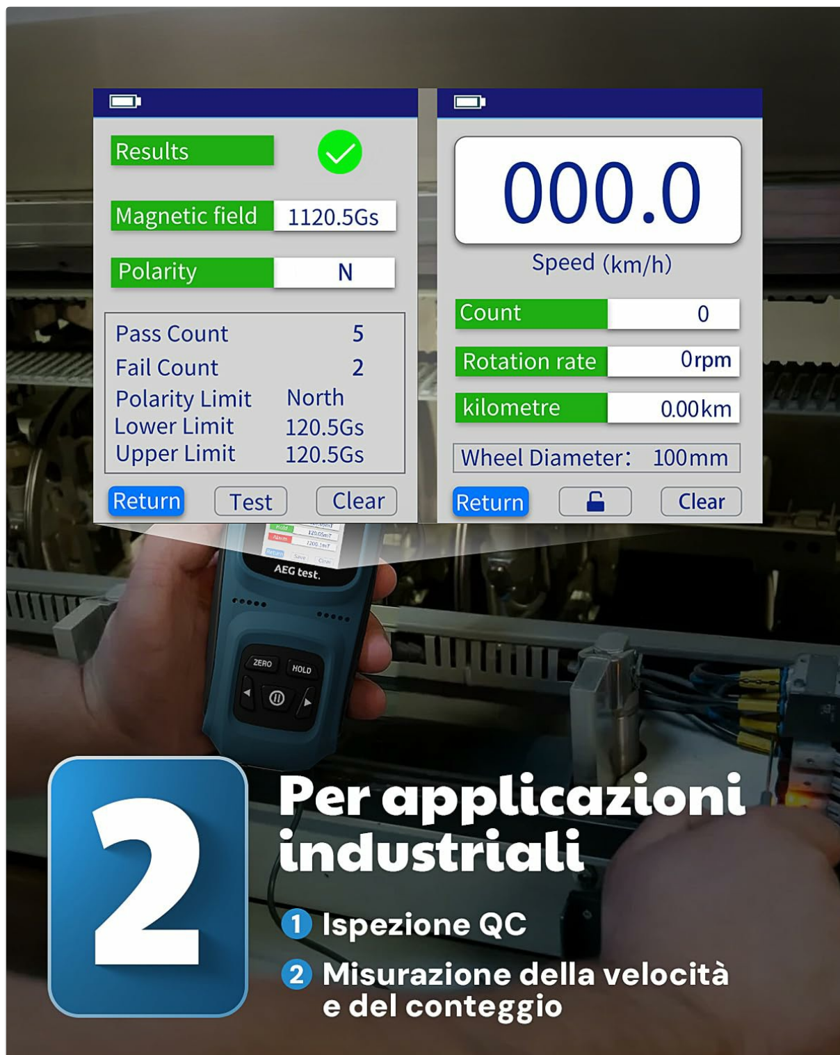
Figure 5.3: The device supports industrial applications through two modes: 1) QC Inspection, showing pass/fail counts and polarity limits, and 2) Speed and Counting Measurement, displaying speed, count, rotation rate, and distance.