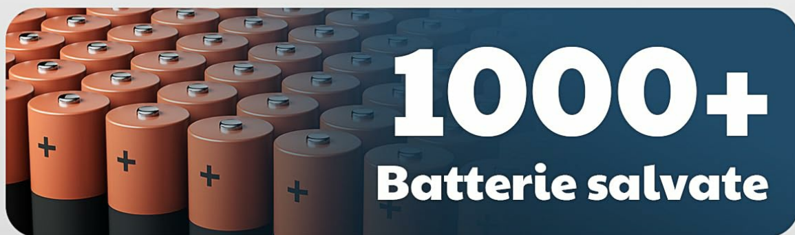
Figure 4.1: The device features a Type-C charging port, offering up to 16 hours of battery life. This rechargeable design helps save over 1000 disposable batteries over its lifespan.