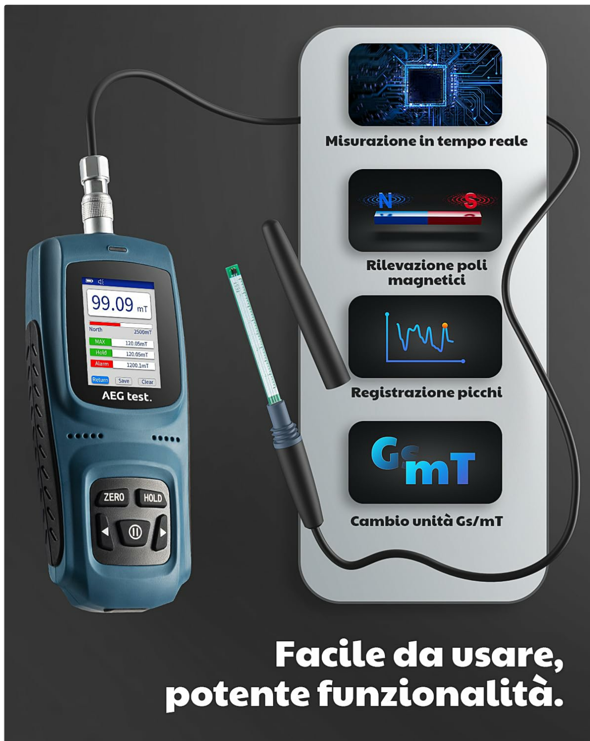
Figure 5.1: The user-friendly interface allows for real-time measurement, magnetic pole detection, peak value recording, and switching between Gs/mT units. This illustrates the device's powerful and easy-to-use functionality.