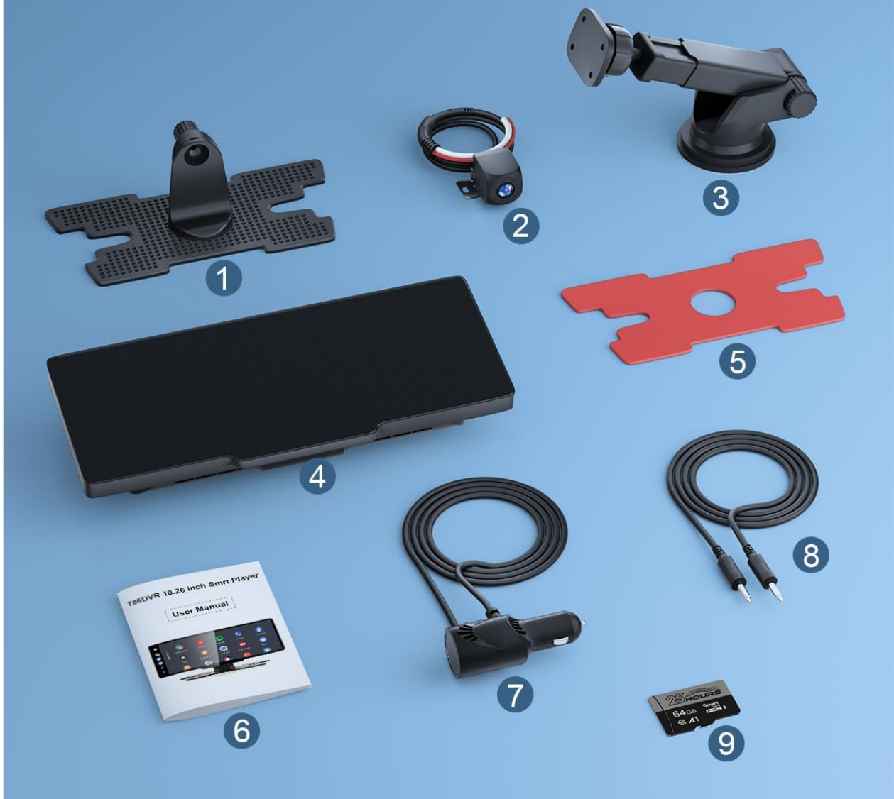
Image: The package contents laid out, showing the main screen, front and rear cameras, various cables, and mounting options.