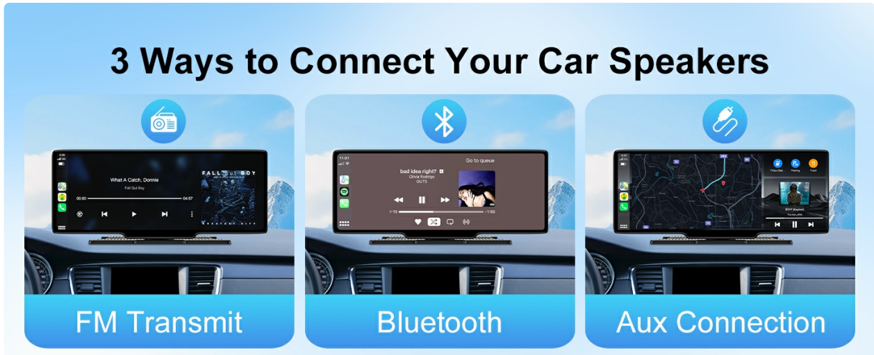
Image: Visual guide demonstrating the three primary audio connection methods: FM Transmit, Bluetooth, and Aux Connection.