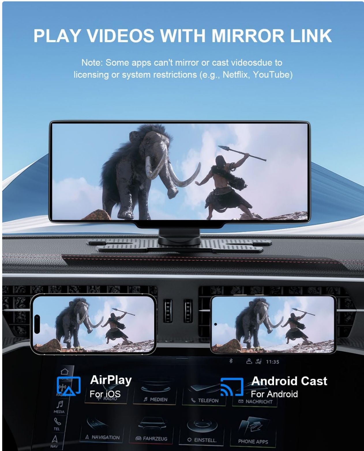
Image: The HK3 screen showing a video mirrored from a smartphone, illustrating the AirPlay and Android Cast features.

Stream movies, YouTube, TikTok, and other content from your phone to the 10.26-inch IPS touchscreen via AirPlay (for iOS) or Miracast (for Android).