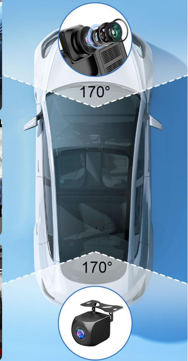
Image: Visual representation of the dash cam and backup camera system, highlighting features like G-sensor, loop recording, and parking guidelines.