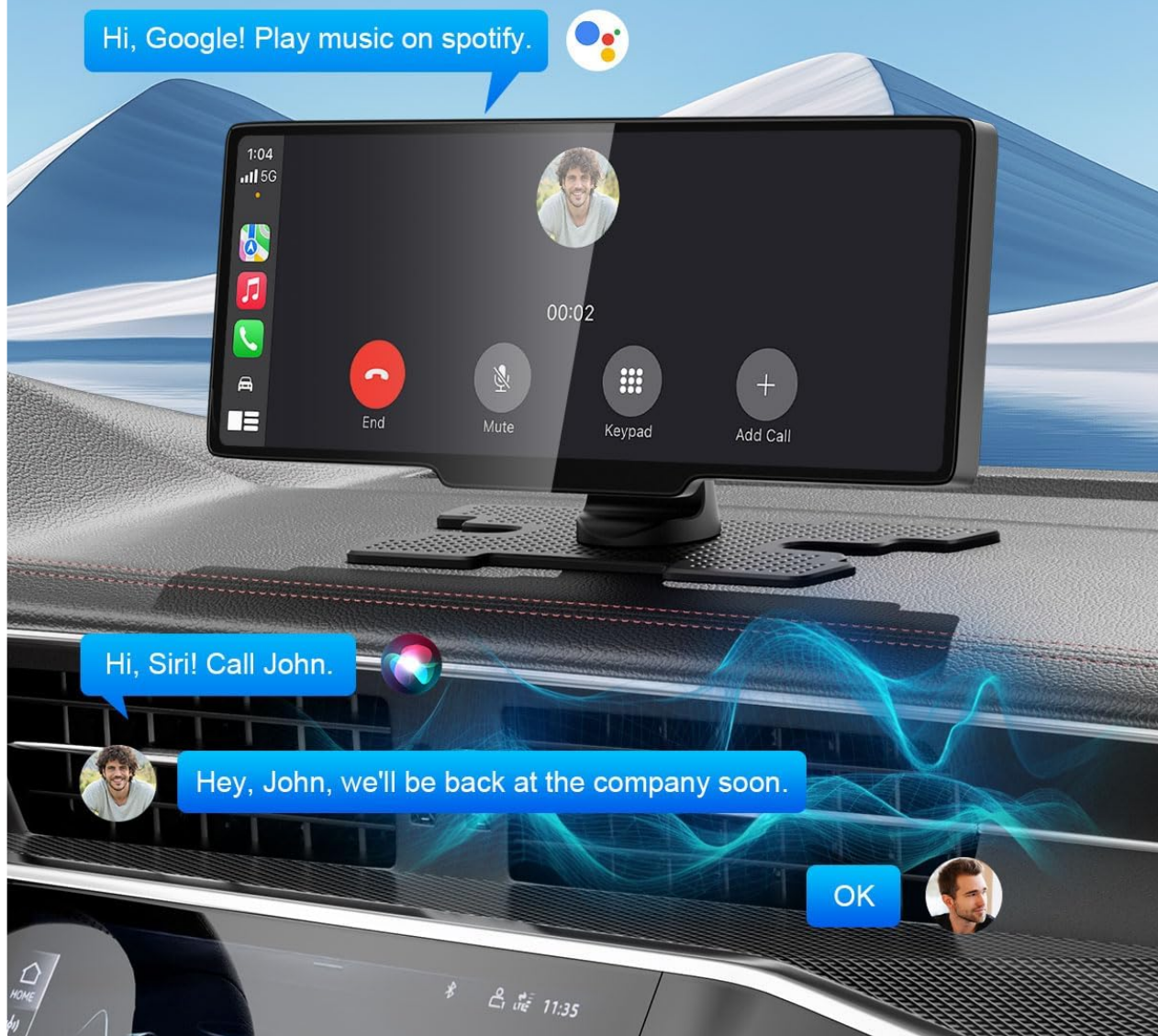
Image: A visual representation of the hands-free voice control feature, showing speech bubbles for commands like 'Hi, Google! Play music on Spotify' and 'Hi, Siri! Call John'.

You can use Siri/Google Voice Assistant to control navigation, make phonecalls, play music, and perform other command operations.