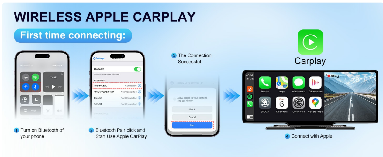
Image: Detailed steps for connecting an iPhone to Wireless Apple CarPlay on the HK3 screen.