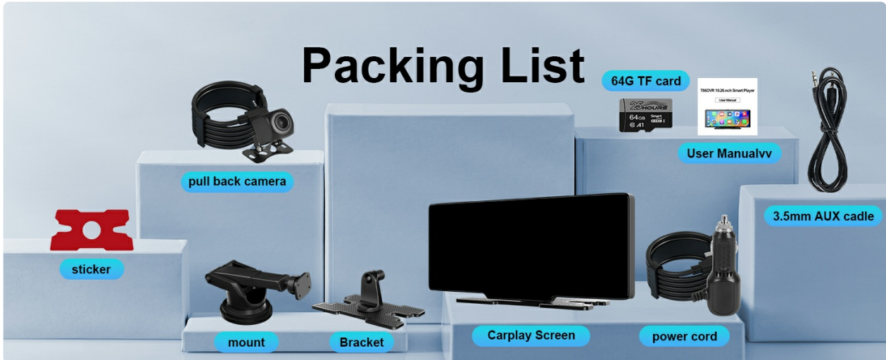
Image: Illustration of the two included mounting brackets, showing their adjustable nature.