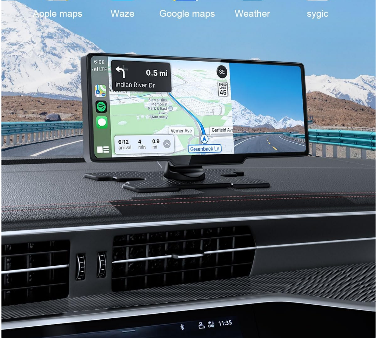
Image: The HK3 screen showing a navigation map with icons for Apple Maps, Waze, Google Maps, Weather, and Sygic.