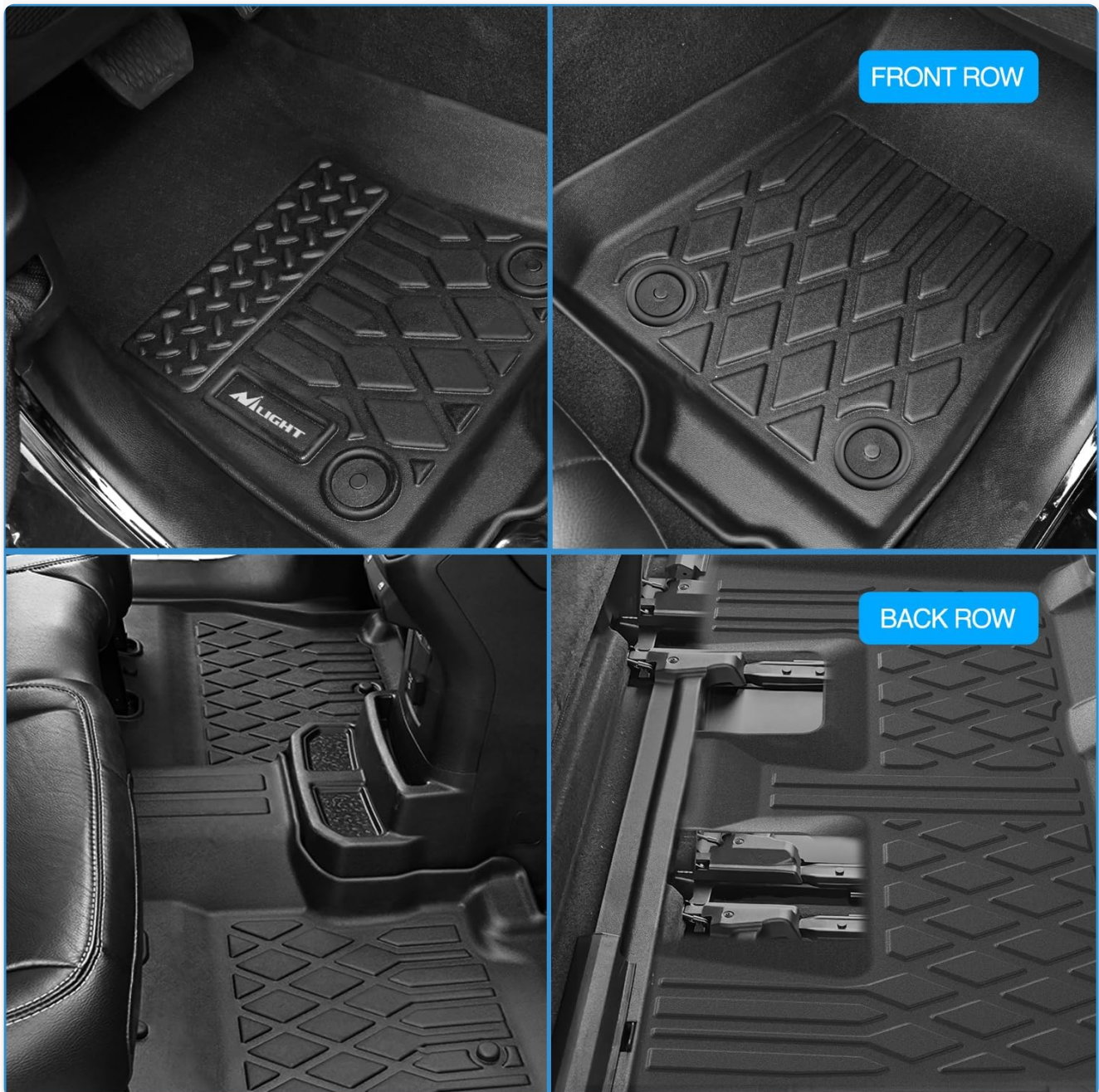
Image: A four-panel image showing detailed views of the front row (driver and passenger side) and back row floor mats installed in a vehicle, highlighting their texture and fit.