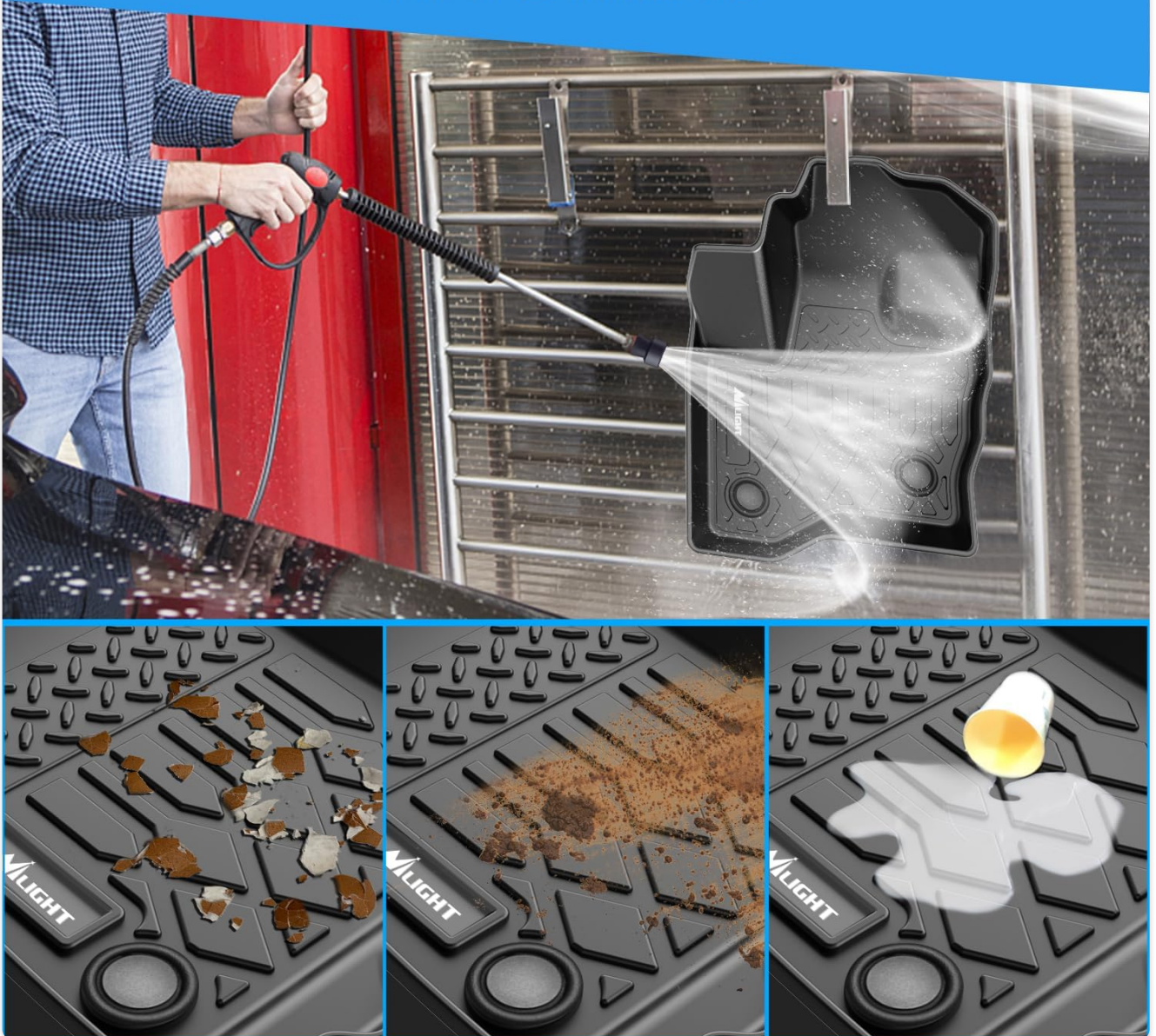
Image: A graphic illustrating the all-weather protection capabilities of the floor mats against rain, dust, and snow, with various vehicle scenarios.