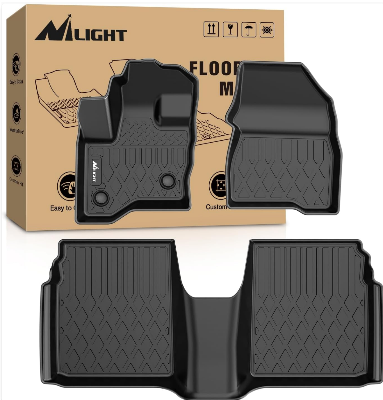
Image: The Nilight Floor Mats, showing the front and rear mats, alongside their product packaging.