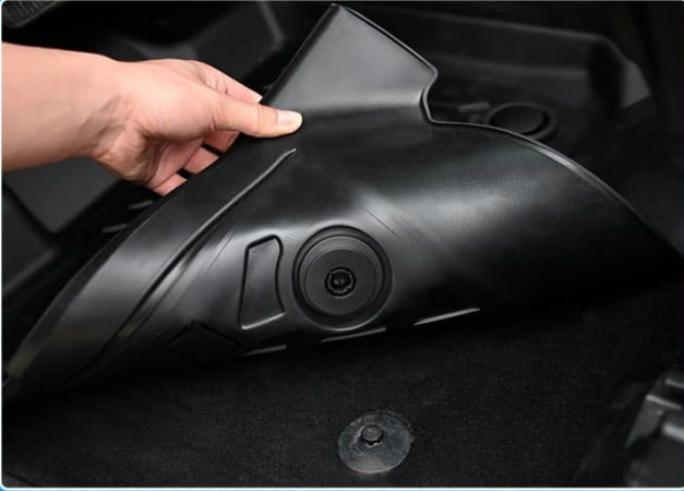
Original fixed mount