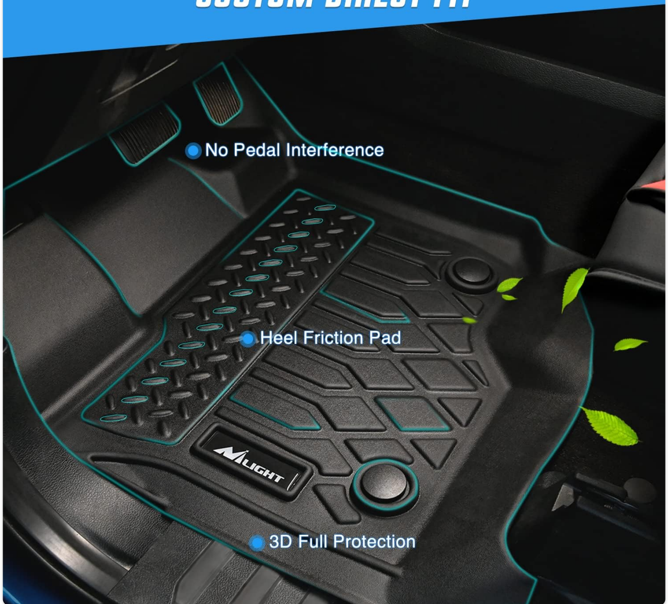
Image: A close-up view of the custom-fit floor mat installed in a vehicle, highlighting the heel friction pad and 3D full protection.