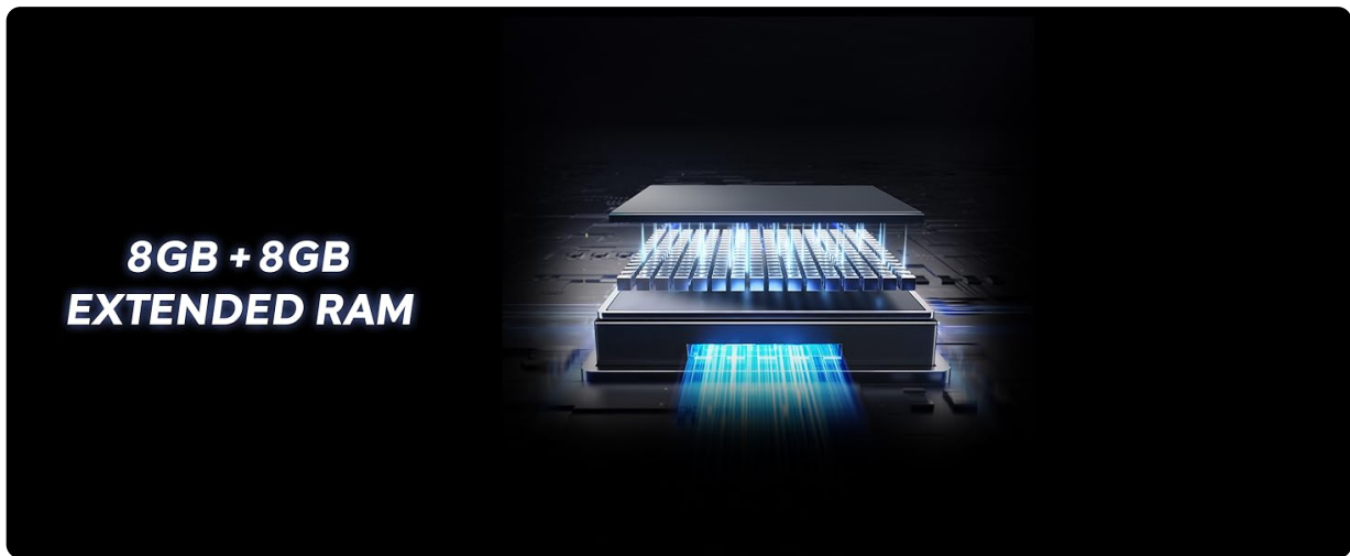
Image: Overview of iQOO Z10x 5G features including Military Grade Certified Durability, Superfast UFS 3.1 Storage, 120Hz Eye Care Display, 50MP Ultra HD Camera with 4K Video Recording and IR Blaster, and AI capabilities like AI Erase and AI Translation.