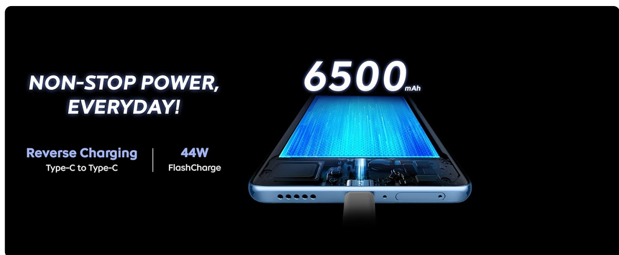
Image: The iQOO Z10x 5G connected to a charger, illustrating its 6500 mAh battery and 44W FlashCharge capability.