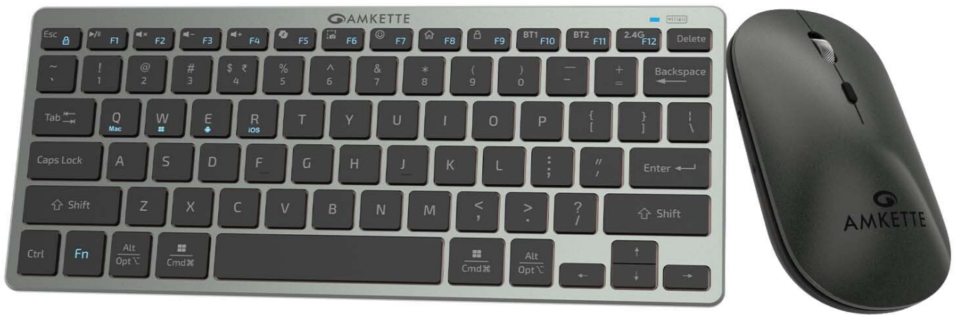
Image: The Amkette Wi-Key Mini 2 Wireless Keyboard and Mouse Combo, showing both devices.