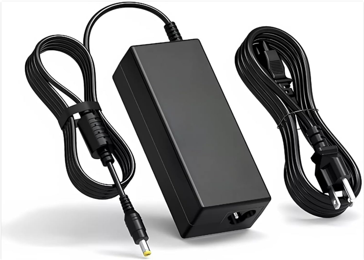
Image 2: Overview of the Pxdairy Replacement Charger, including the power adapter block and connected cables.