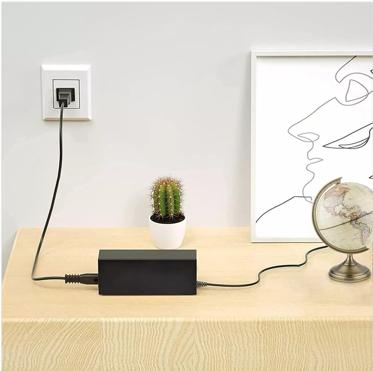
Image 4: The charger properly connected to a wall outlet and ready to charge a compatible device.