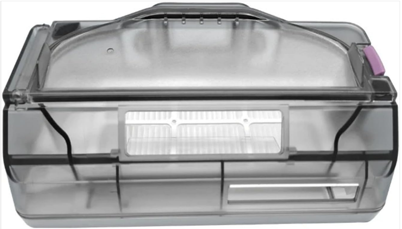
Image 1: Top view of the FUDTYSVC Robot Vacuum Cleaner Dust Box, showing the clear lid and internal filter compartment. This view helps in identifying the correct orientation for insertion.

6. Power On: You may now power on your robot vacuum cleaner.