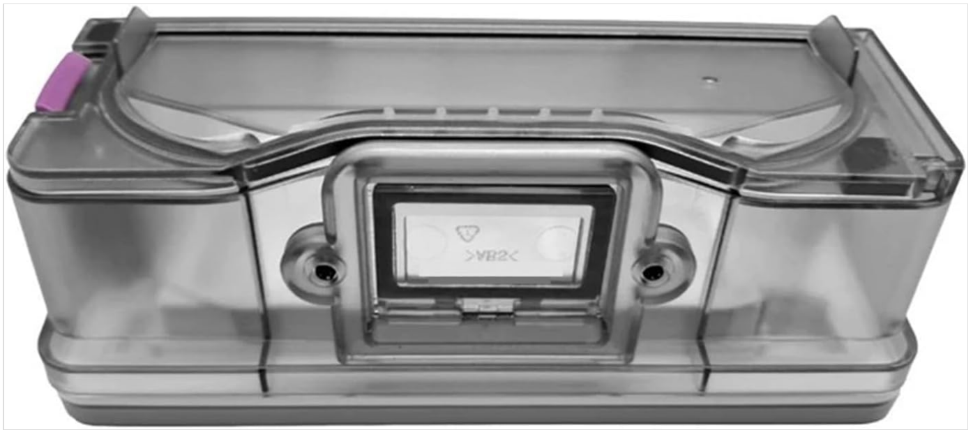
Image 2: Bottom view of the FUDTYSVC Robot Vacuum Cleaner Dust Box, highlighting the latch mechanism for opening and emptying the collected debris.