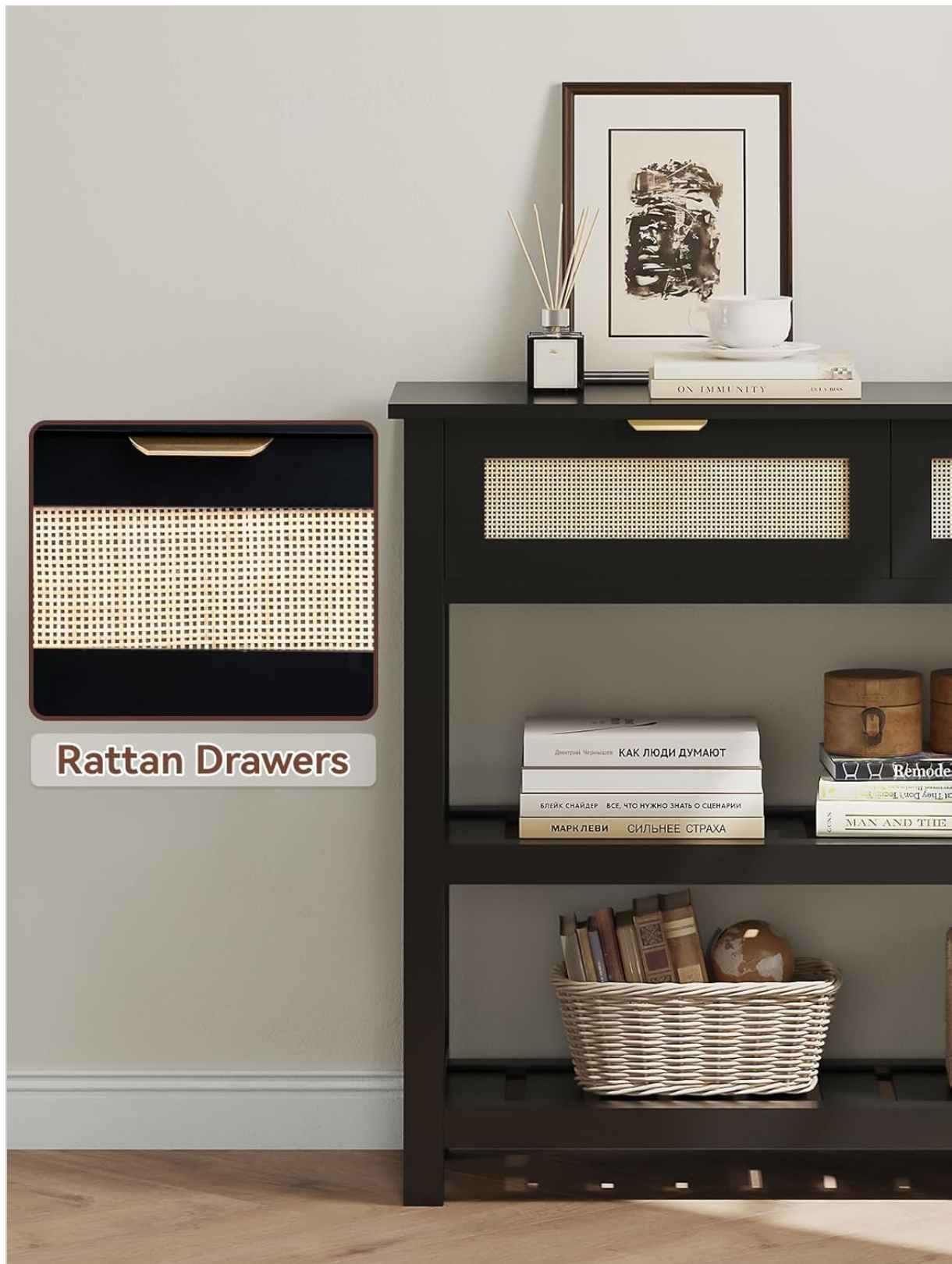
Image Description: A close-up view of the rattan drawer front, highlighting the woven texture and the integrated handle, showcasing the aesthetic detail.