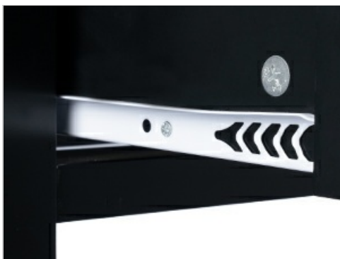
Image Description: A close-up image showing the smooth-gliding drawer slide mechanism, indicating the quality of the drawer components.