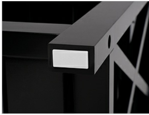
Image Description: Close-up view of the anti-tipping hardware securely installed, connecting the top of the console table to the wall. This demonstrates the importance of using the safety feature.