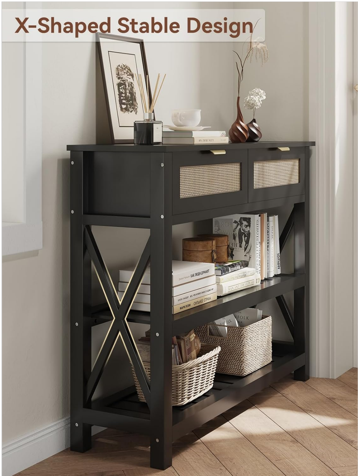
Image Description: A view of the console table highlighting its X-shaped side frames, which contribute to its stability and structural integrity during and after assembly.