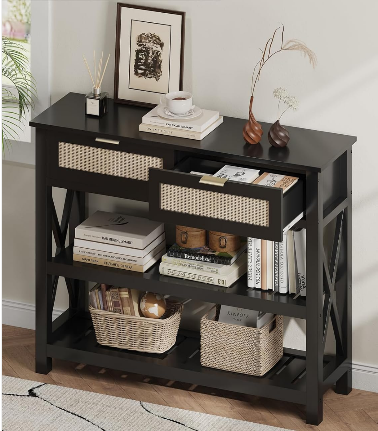
Image Description: The console table with one rattan drawer partially open, revealing its interior, and various items neatly arranged on the two open shelves below, demonstrating its storage capacity.