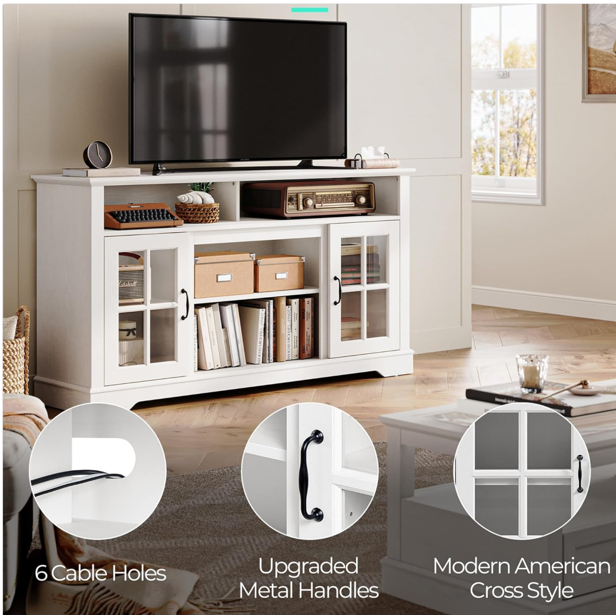
Figure 3: Design Details. This image provides a closer look at key design features such as the six cable management holes for organized wiring, upgraded metal handles for durability, and the modern American cross-style glass doors.