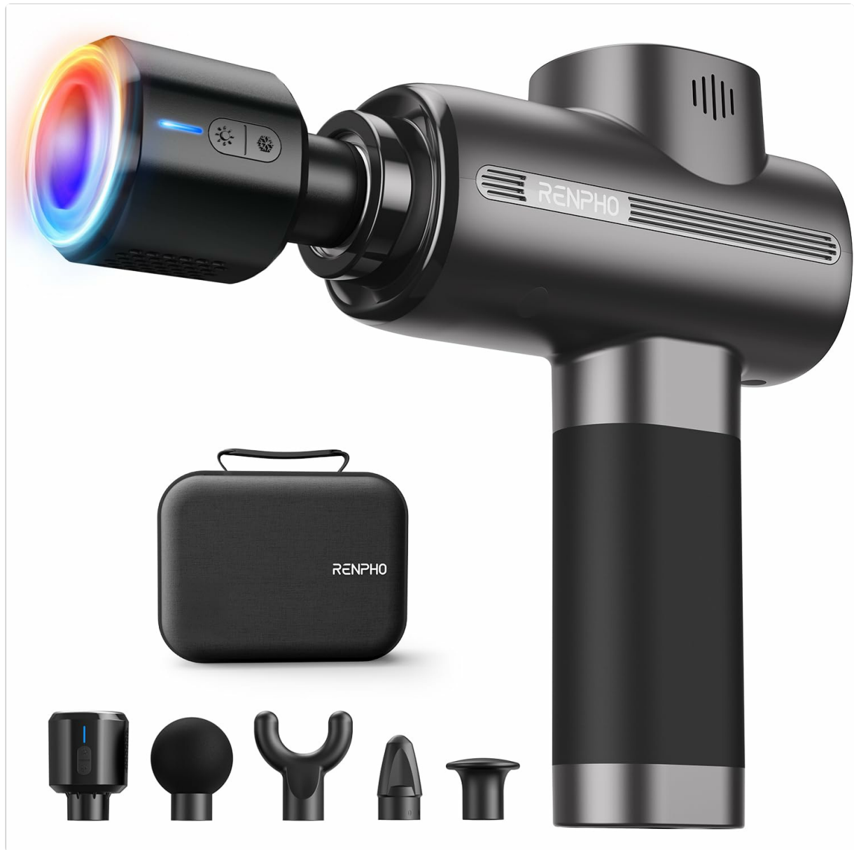
The RENPHO Active Thermacool Massage Gun, showcasing its compact design and hot/cold therapy head.