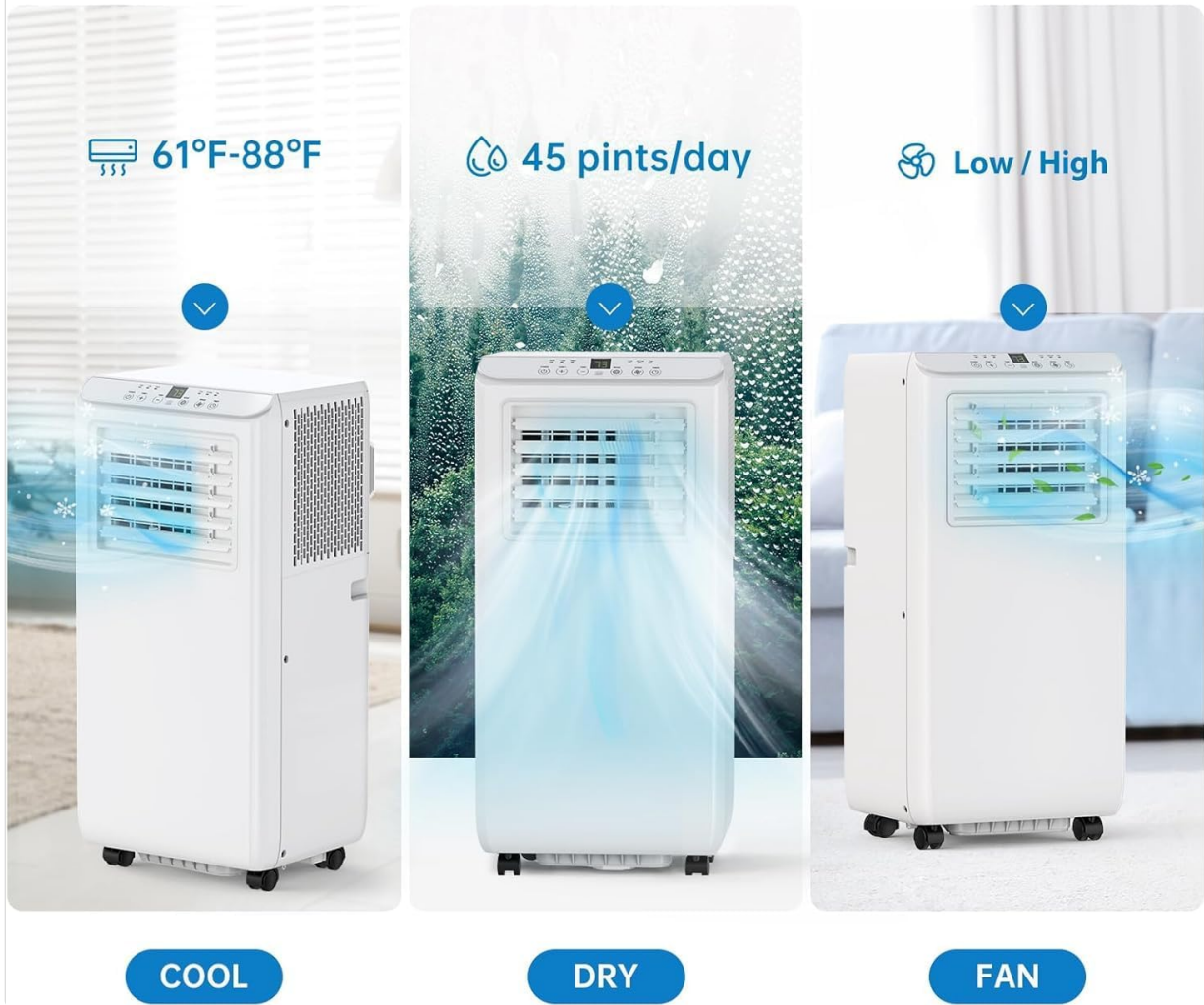
Image 4.2: The 3-in-1 functionality of the unit: Cool, Dry, and Fan modes.