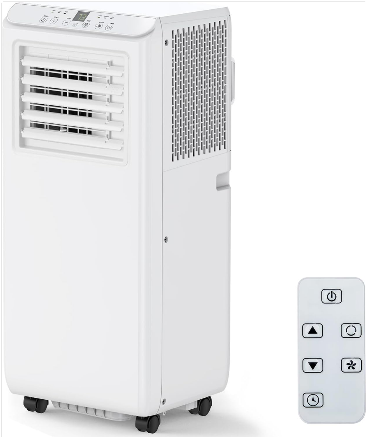
Image 1.1: Amenitlif 8000 BTU Portable Air Conditioner and its remote control.