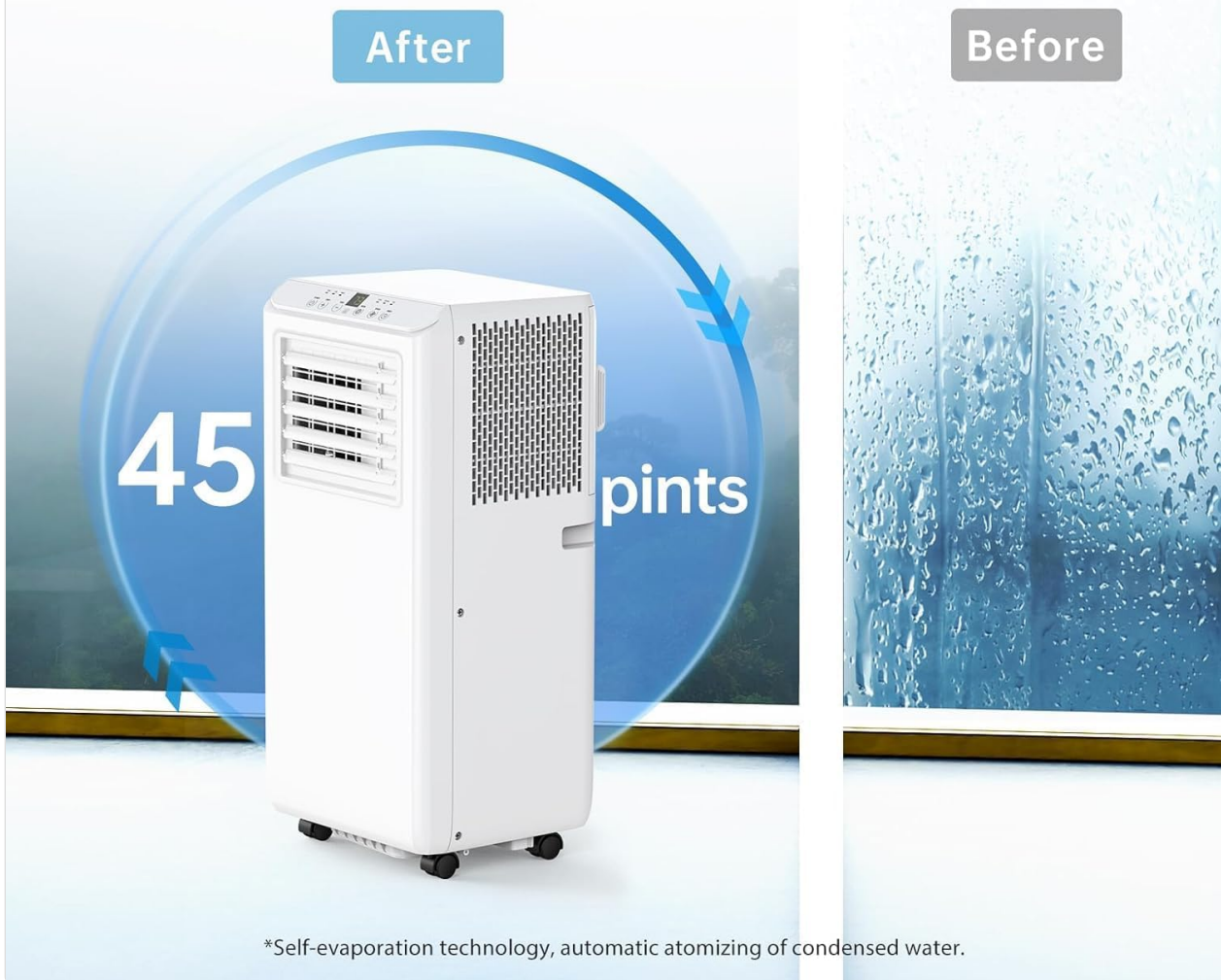
Image 4.3: Automated dehumidification technology, capable of removing up to 45 pints of moisture per day.