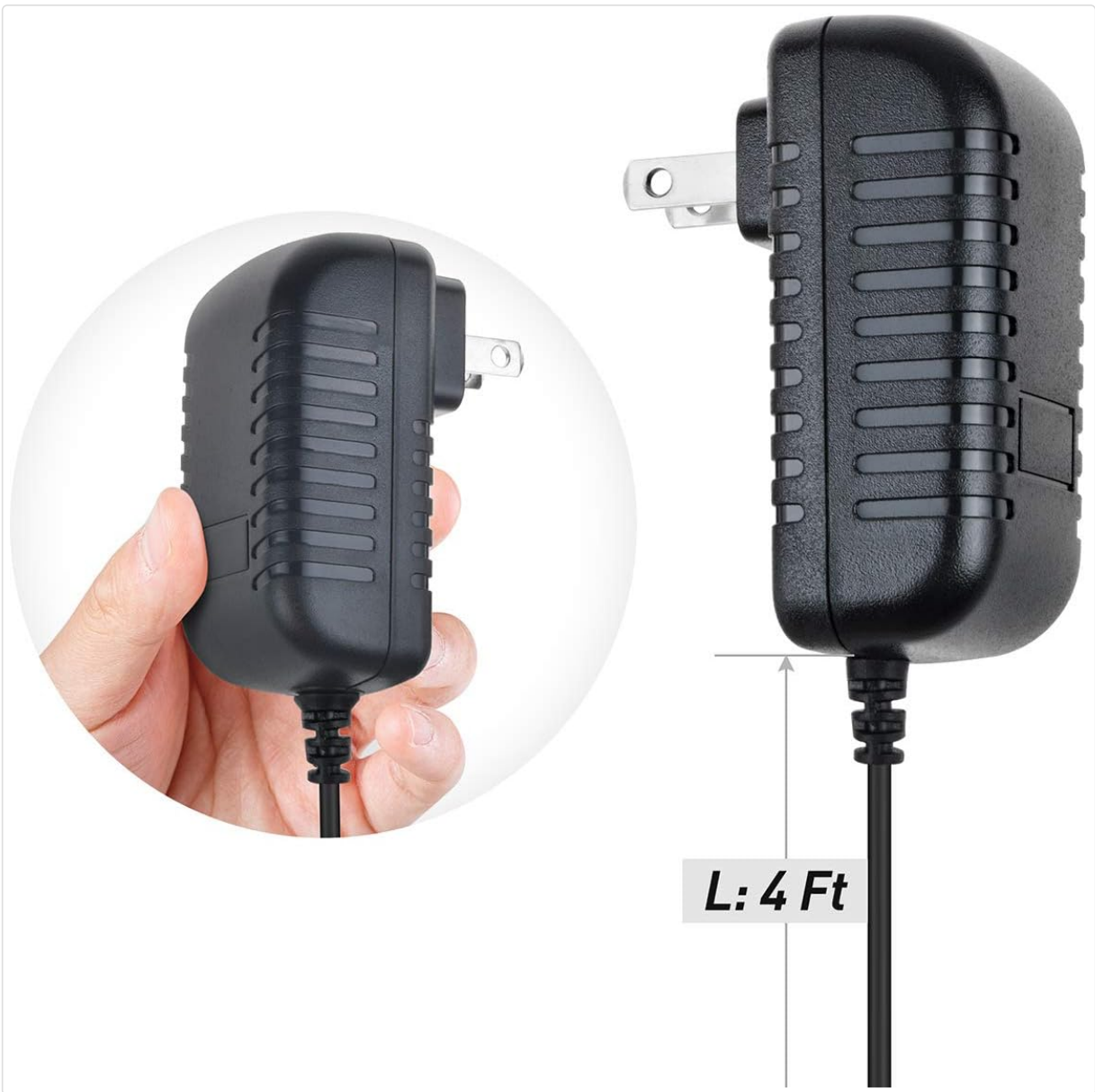
Image 3.1: AC Adapter Dimensions and Cord Length. This image illustrates the compact size of the adapter and indicates a cord length of approximately 4 feet (1.2 meters).

The power cord is constructed with high-quality copper core wire, designed for durability and to prevent breakage, thereby extending the lifespan of the power supply. It ensures efficient and stable current delivery with strong power output.