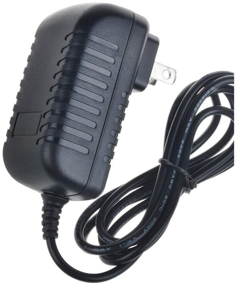
Image 2.1: Built-in Safety Electronics. This image highlights the various safety features integrated into the AC adapter, including protections against overcharge, over voltage, short-circuit, over current, and over temperature.

Always ensure the adapter is used in a well-ventilated area and avoid covering it during operation. Do not expose the adapter to water or extreme temperatures.