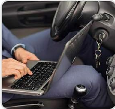
in the car