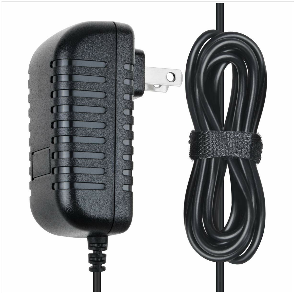
Image 1.1: SKKSource AC Adapter Charger. This image displays the main view of the AC adapter charger, showing its compact design and standard plug type.