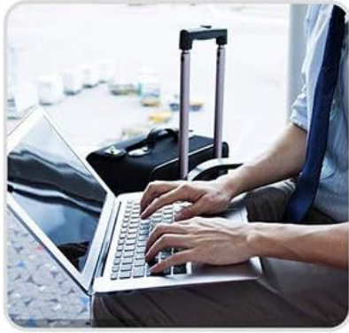
On a business trip