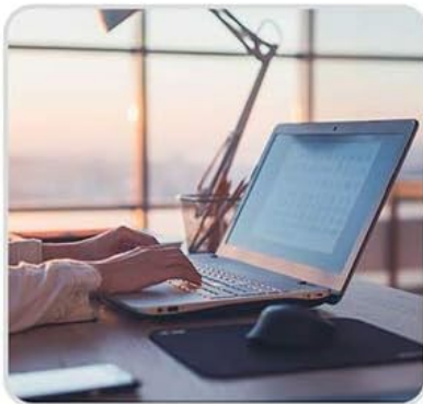
in the office