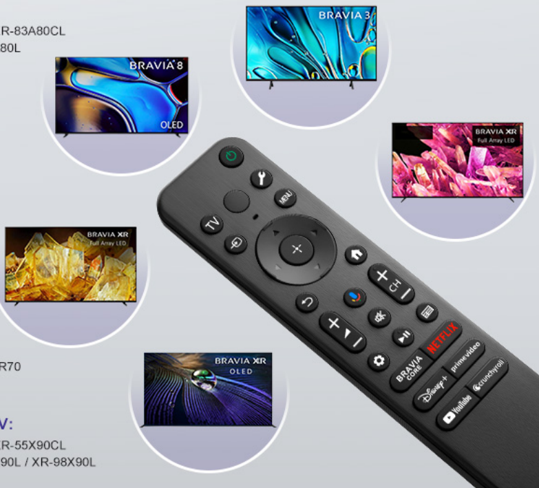
Image: The LOUTOC replacement remote control, highlighting the central voice activation button. This remote is designed for Sony Bravia TVs.

X90CL Series: XR-85X90CL / XR-75X90CL / XR-65X90CL / XR-55X90CL X90L Series: XR-55X90L / XR-65X90L / XR-75X90L / XR-85X90L / XR-98X90L