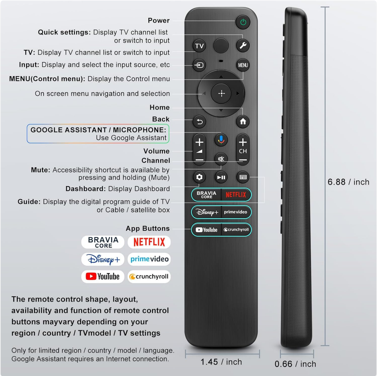
Image: A detailed diagram labeling each button on the remote control and describing its primary function, including power, navigation, volume, channel, and app shortcuts.