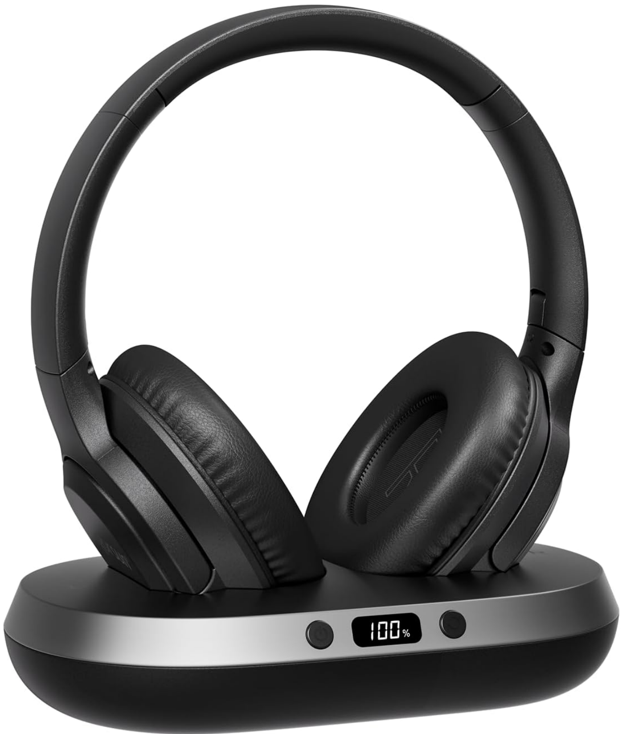
Image: The vinamass TV-3 wireless headphones are shown resting on their charging and transmitter base, displaying the integrated design.