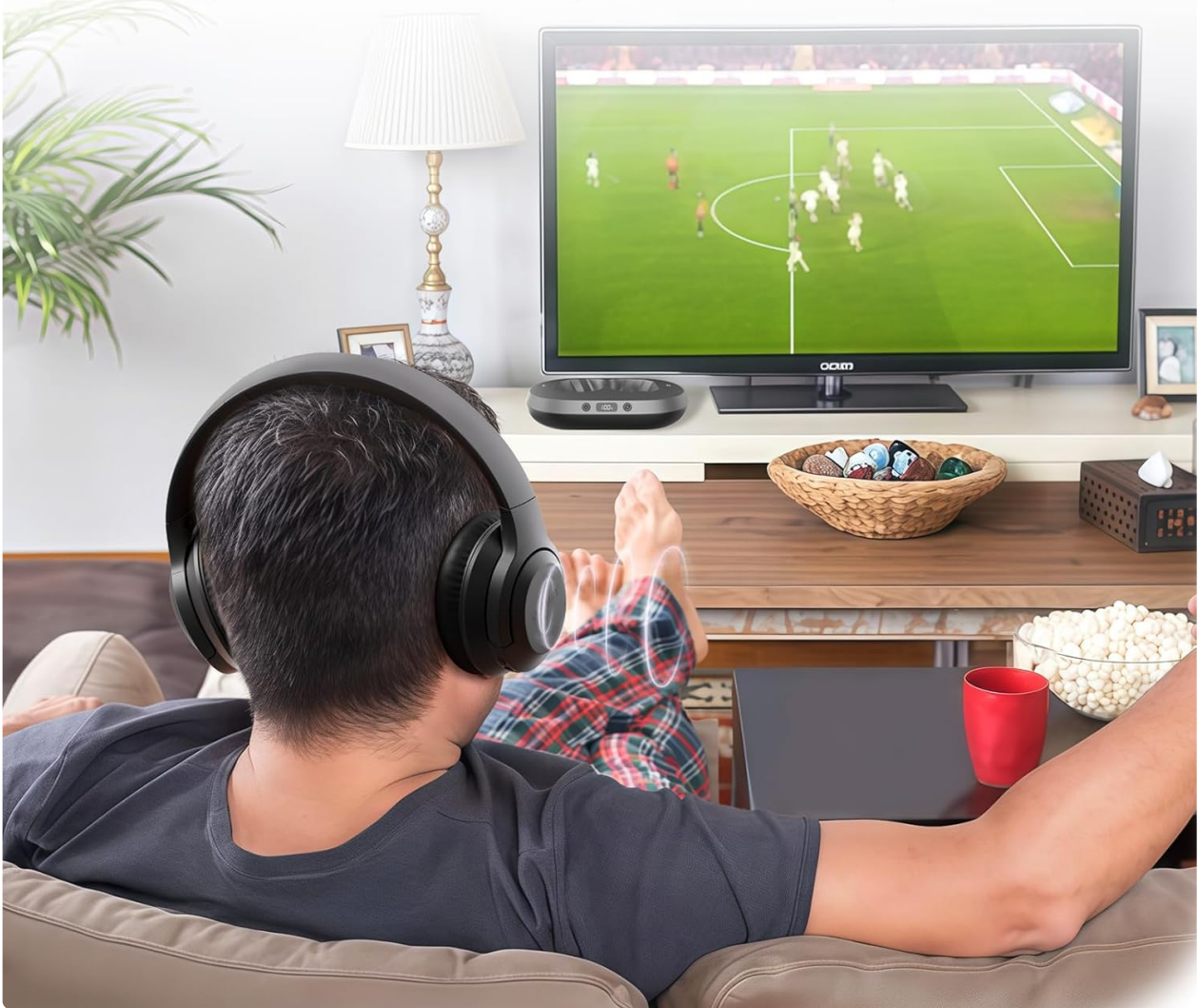
Image: A person wearing vinamass wireless headphones while watching a football match on TV, demonstrating the product's low-latency audio feature for synchronized sound and visuals.

Watch your favorite show or game with perfect synchronization