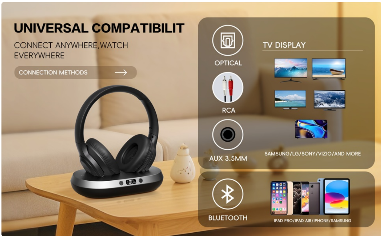
Image: An illustration demonstrating the universal compatibility of the headphones, showing connections to various TV brands, mobile phones, and laptops via Optical, RCA, AUX 3.5mm, and Bluetooth.