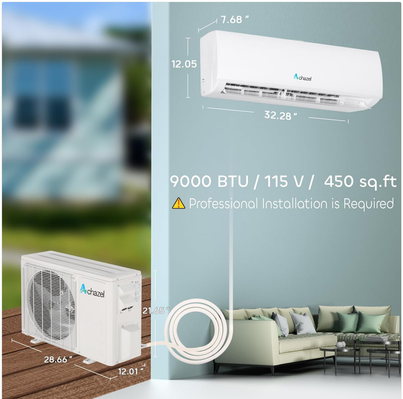
Figure 5.1: Unit Dimensions and Installation Diagram. The indoor unit measures approximately 32.28" x 12.05" x 7.68", and the outdoor unit measures approximately 28.66" x 21.65" x 12.01". Professional installation is required.