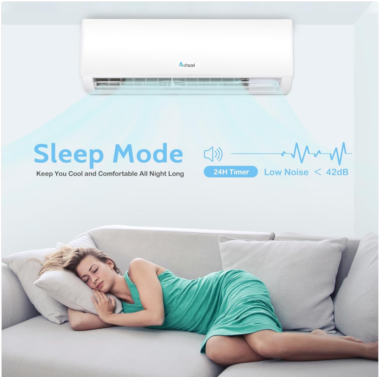
Figure 6.3: Sleep Mode for Quiet and Comfortable Operation.