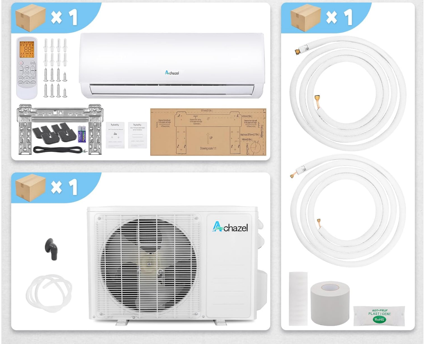
Figure 3.1: Package Contents Overview. The package includes the indoor fan coil section, outdoor condenser section, wireless remote controller with holder, 16 ft. L line set, installation accessories, and vibration absorber feet for the condensing unit. Note: The item comes in 3 separate boxes, so delivery times may vary.

Note: The item comes in 3 separate boxes, so delivery times may vary.