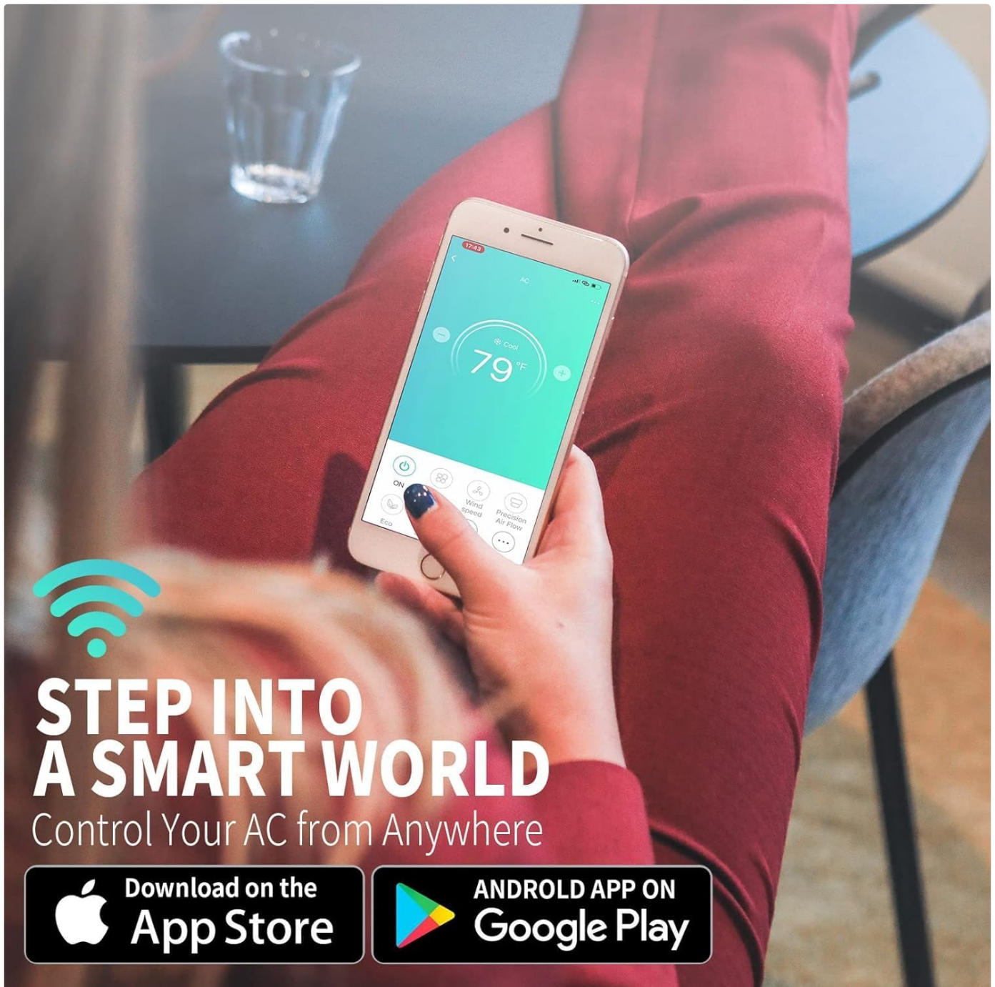
Figure 6.2: Smartphone App Interface for Smart Control.

The ACHAZEL mini split can be controlled remotely via a smartphone app. Download the app from the App Store (for iOS) or Google Play Store (for Android).