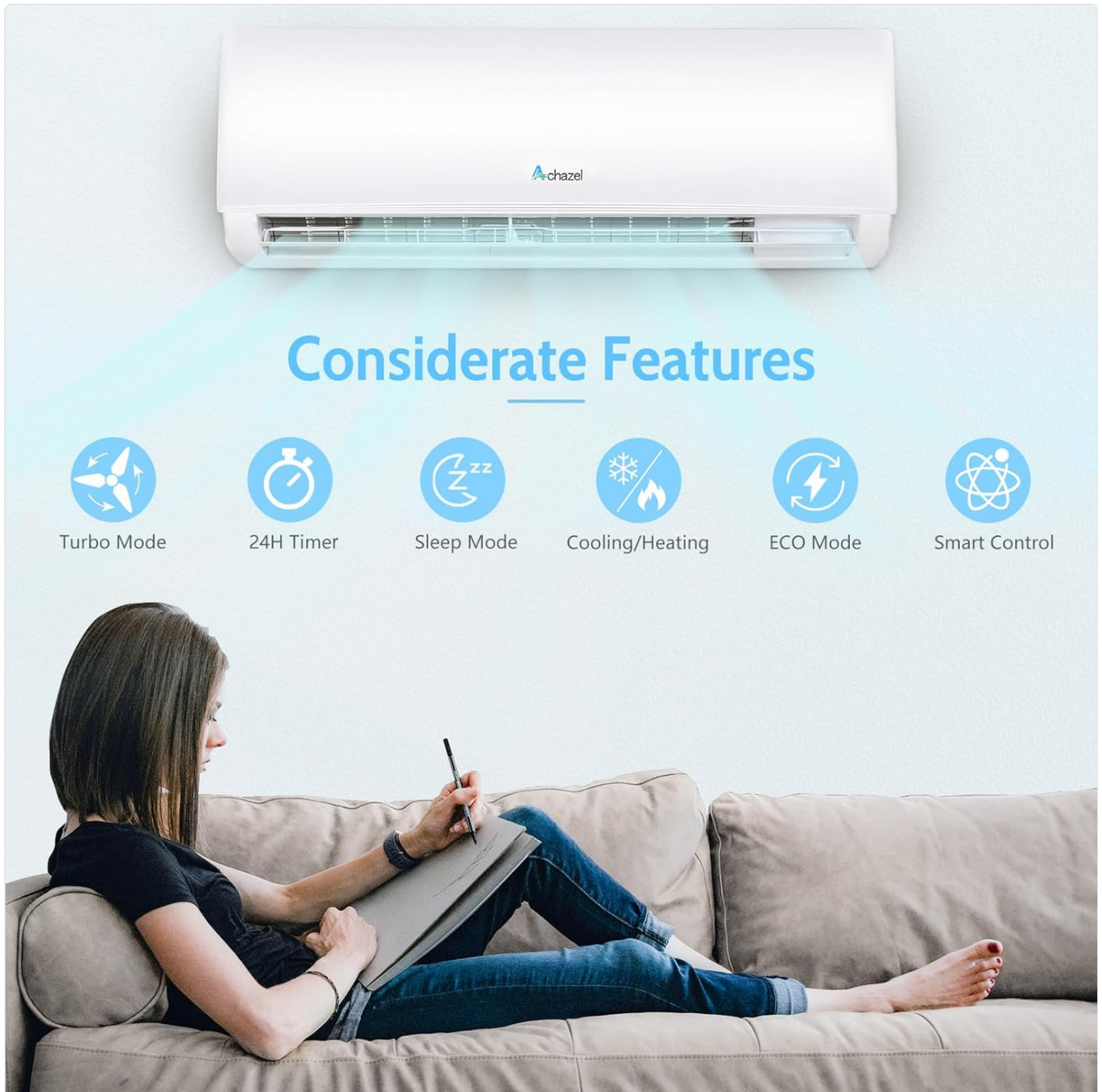
Figure 4.1: Considerate Features of the ACHAZEL Mini Split System.