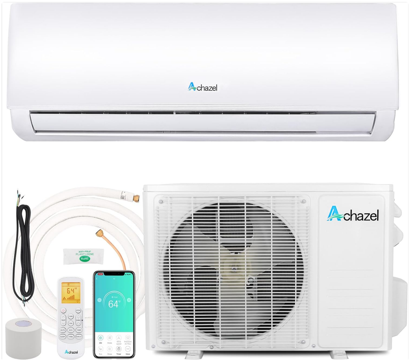
Figure 4.3: ACHAZEL Mini Split System Components.