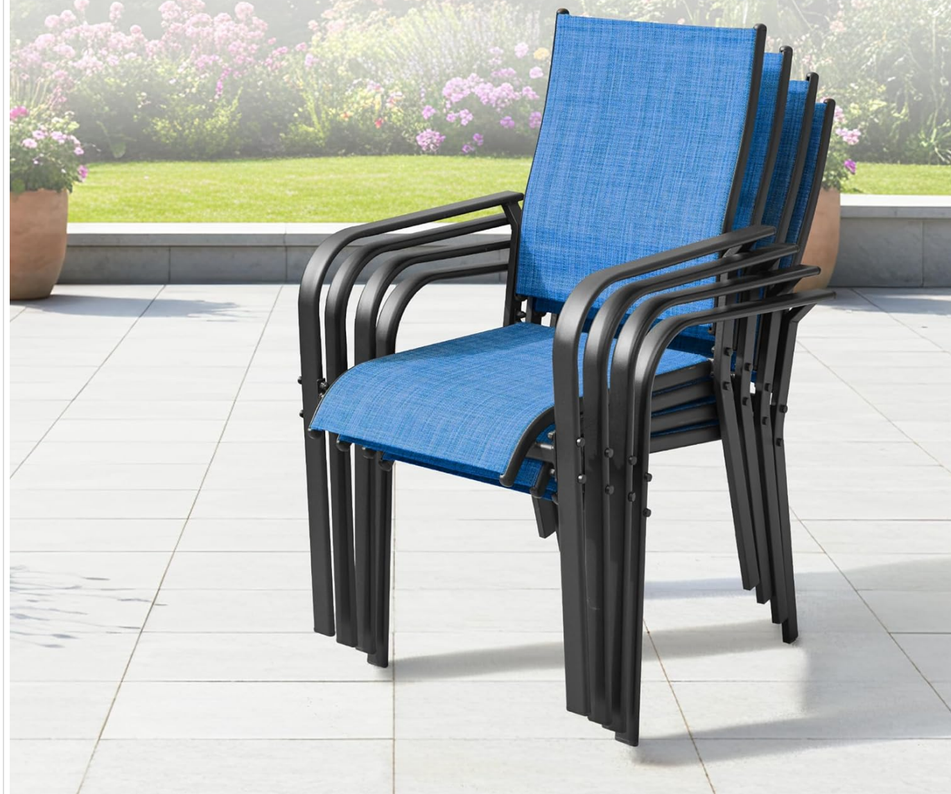
Figure 2: Stackable Chair Feature. This image shows four chairs stacked, highlighting their space-saving design for easy storage.